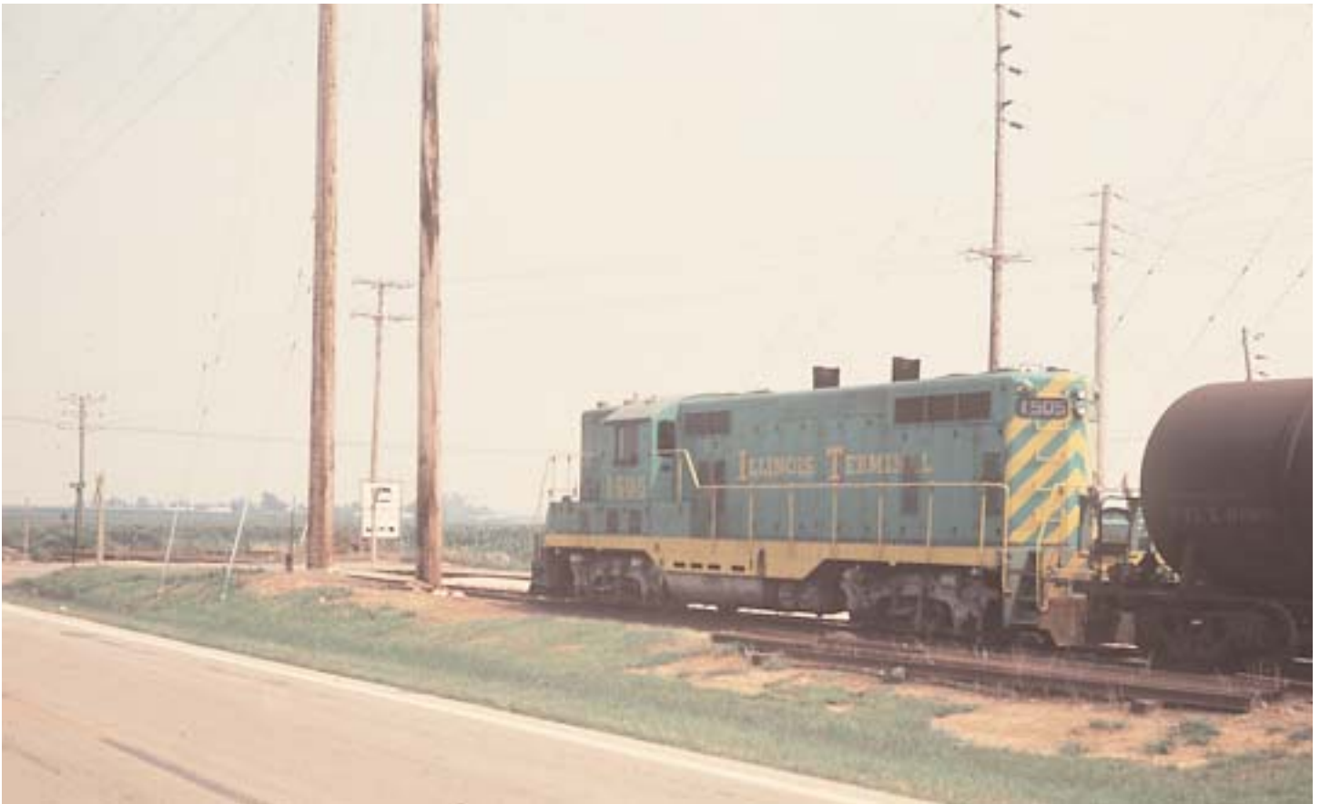
GP7 at Bordens in Illiopolis wearing scheme 6