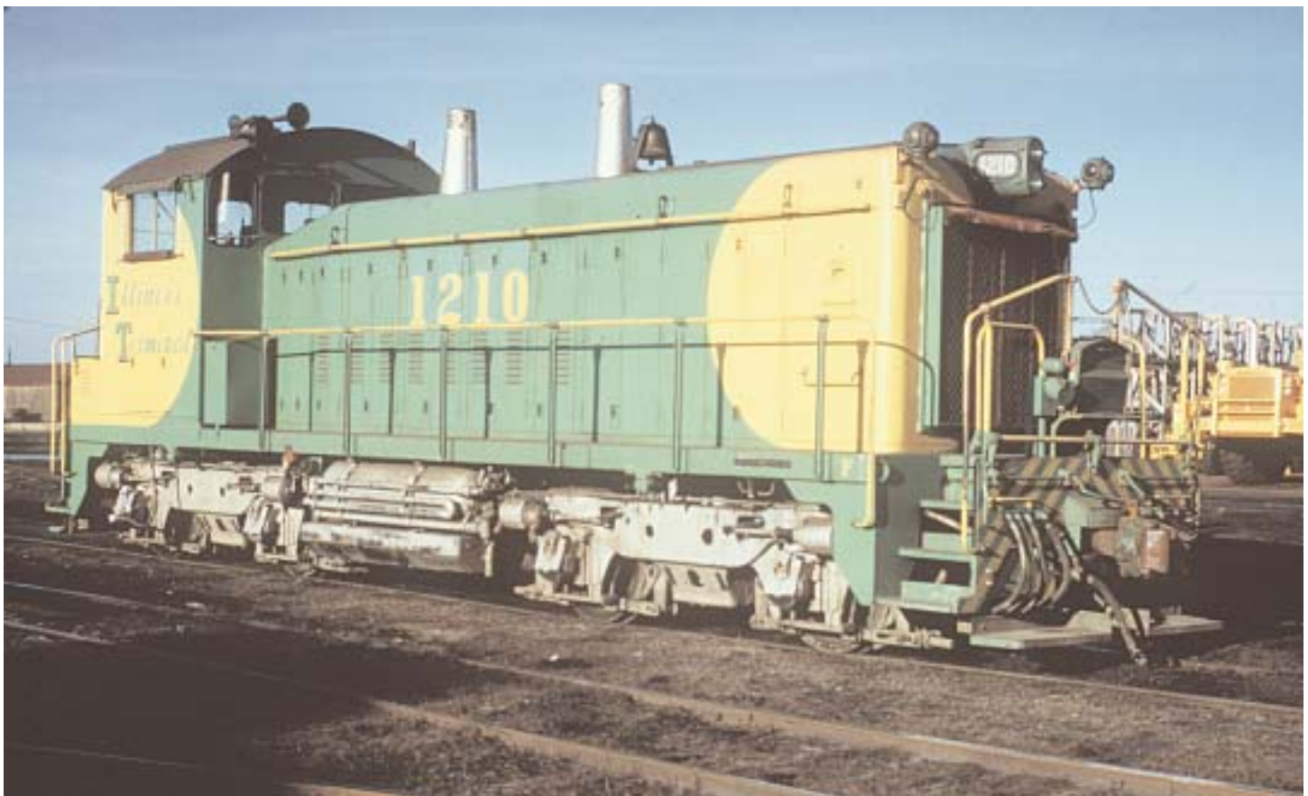
SW1200 in 1968, Decatur, IL, scheme 4