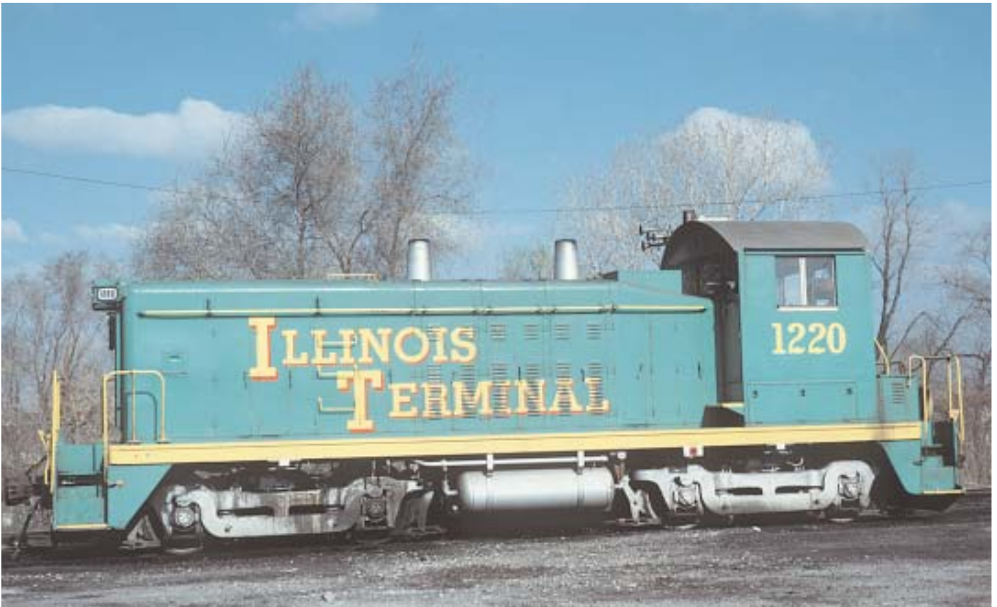
Leased SW1200, one of two leased in August 1979, at Madison in November 1979