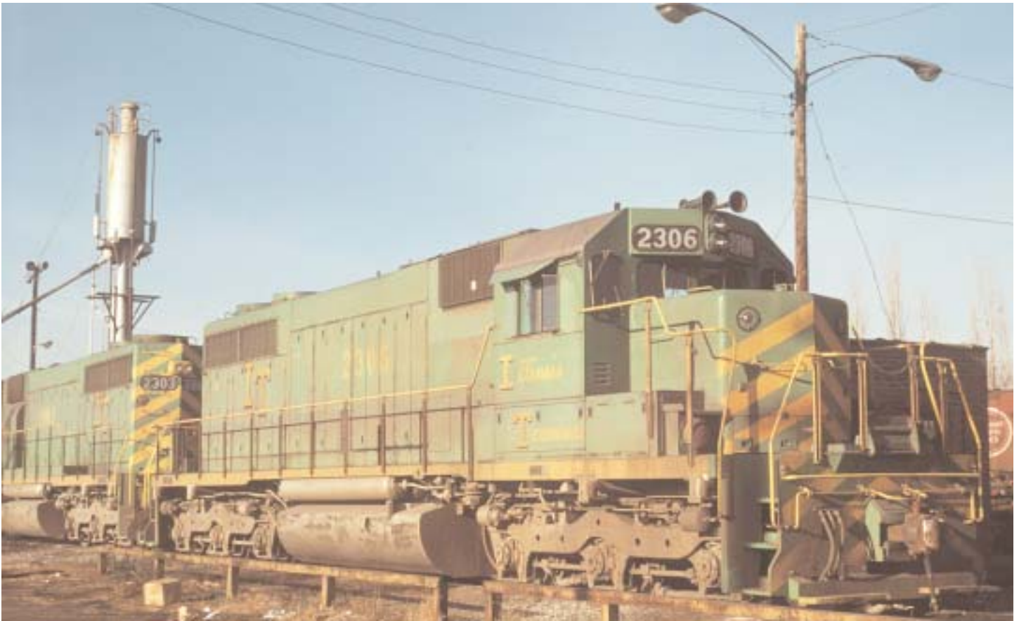
SD39 2306 in November 1974 at Madison wearing scheme 2