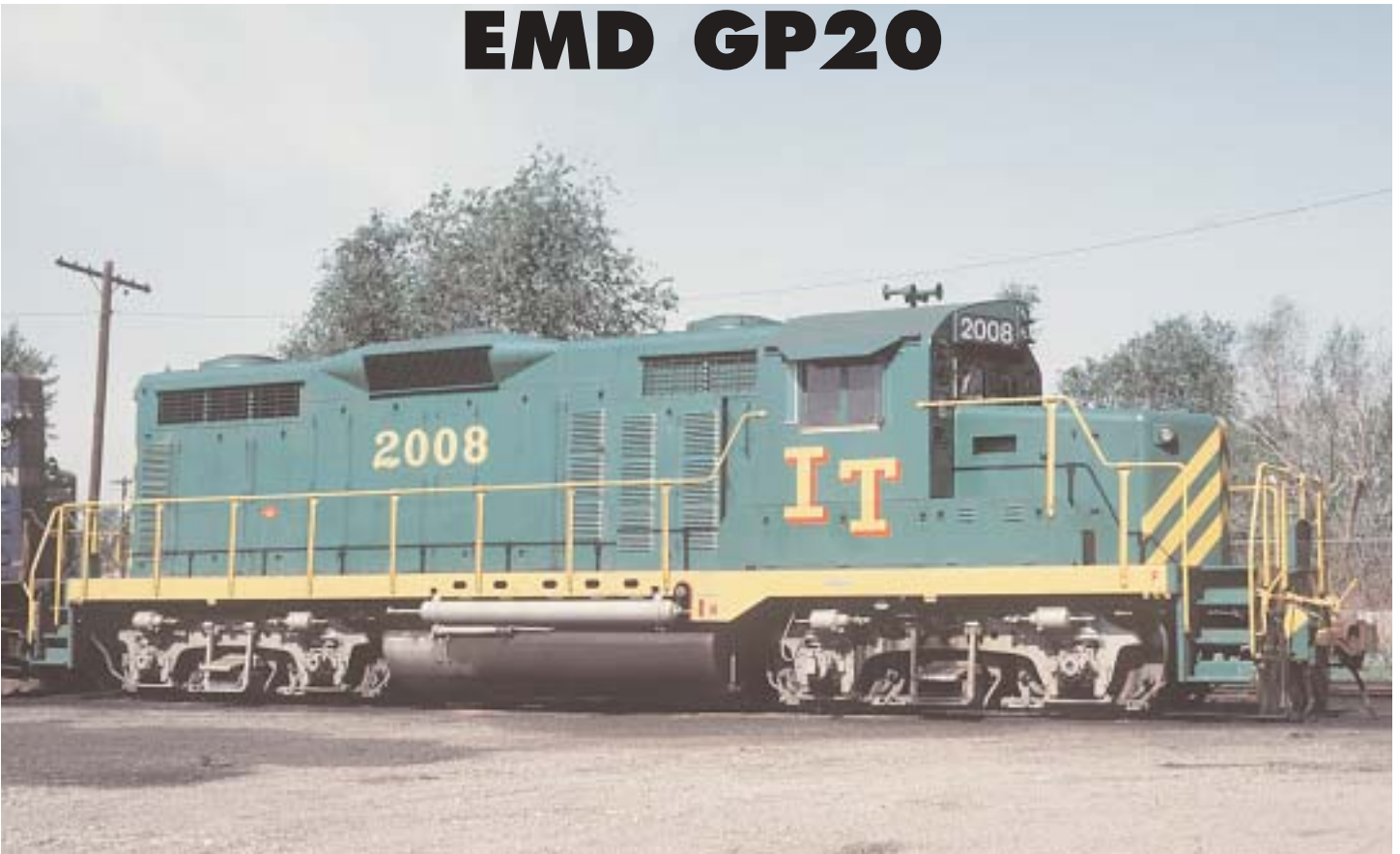
GP20 number 2008 at Madison in April 1981