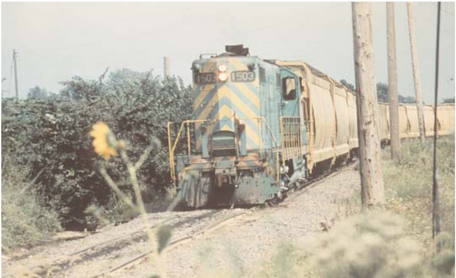
GP7 at Decatur before 1981 wearing scheme 5 Following page: GP7 at Tabor before 1981 wearing scheme 5