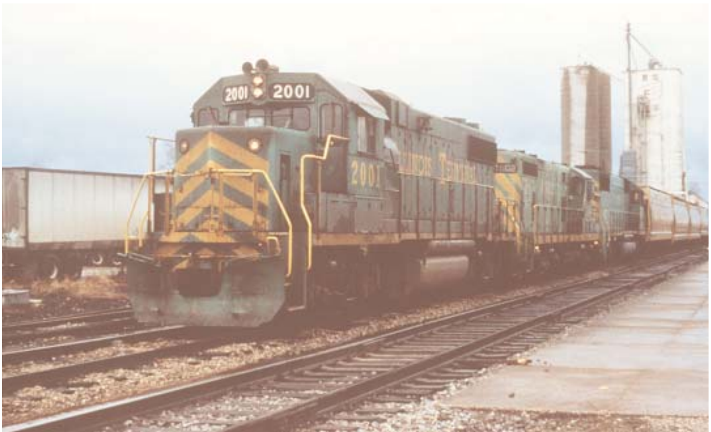
GP38-2 at Virden