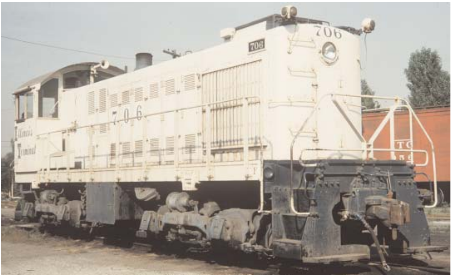
S2 wearing scheme 4, June 1965