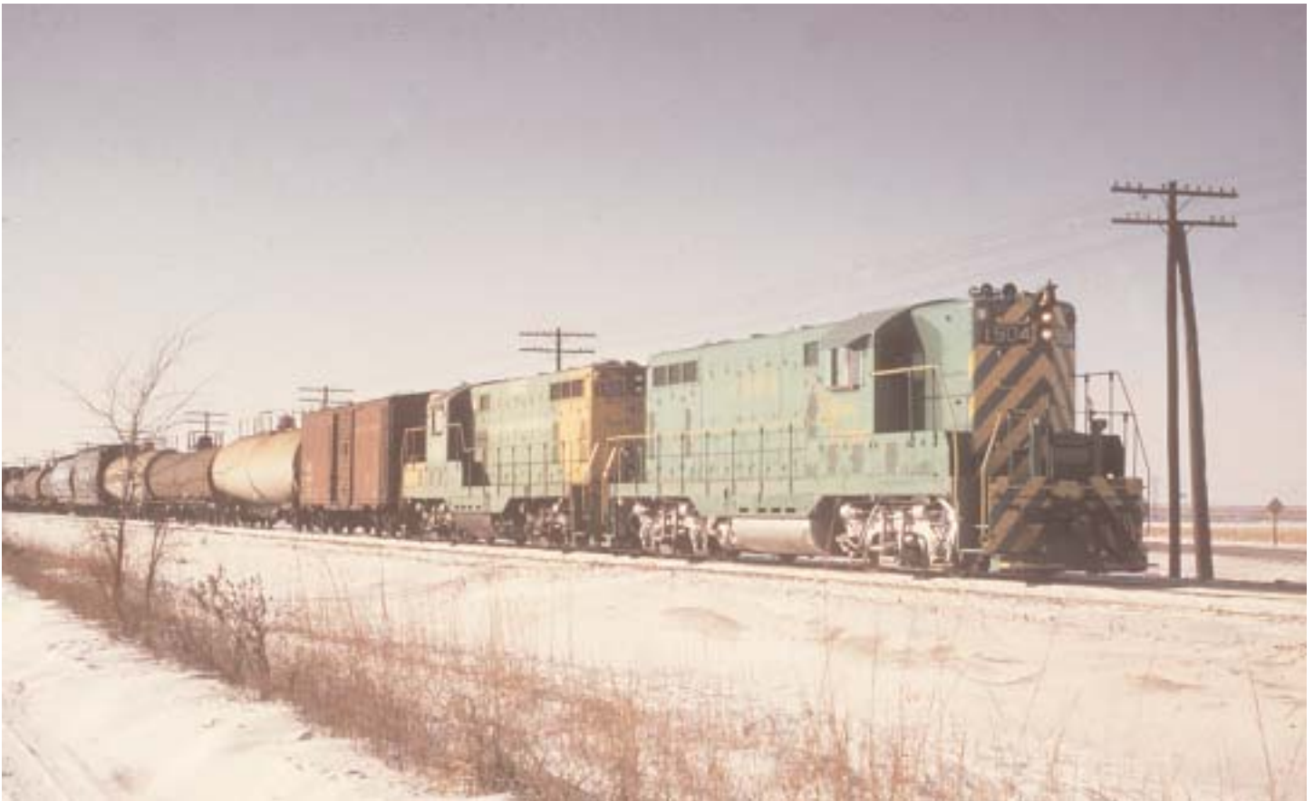
GP7 at Bissell on ICRR north of Springfield, IL in 1970 wearing scheme 5