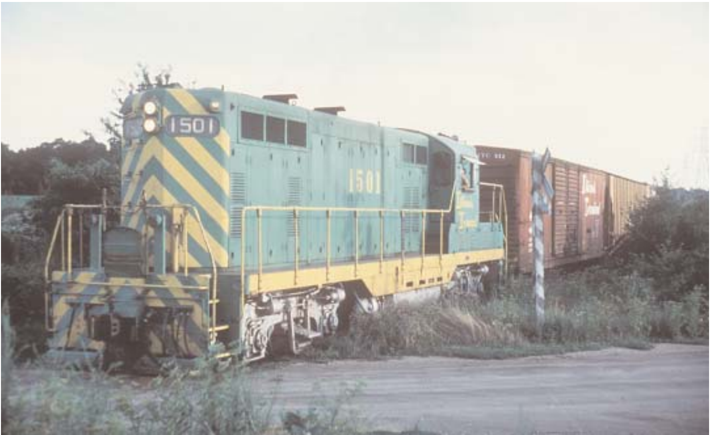
GP7 on ICRR at Monticello wearing scheme 5