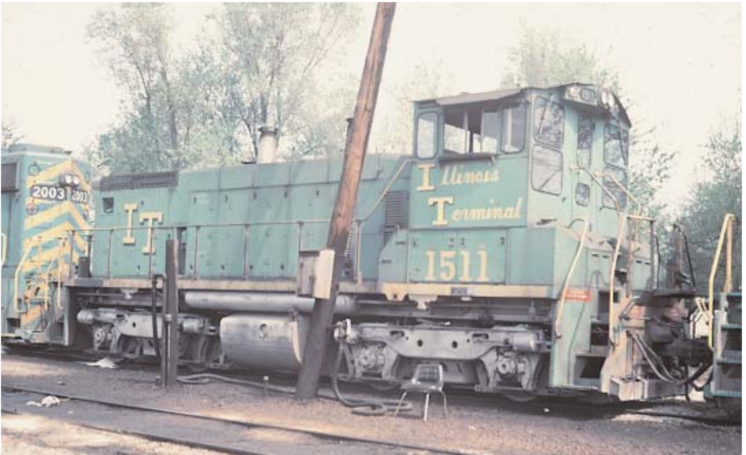
SW1500 at East Belt, Springfield, IL in 1980 in scheme 1