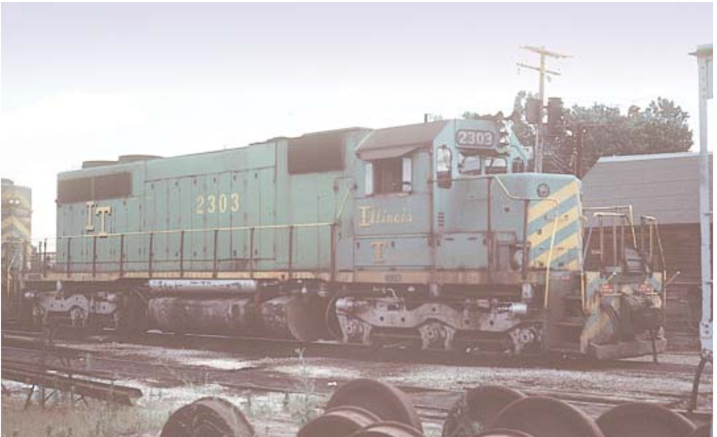
SD39 at Decatur, IL