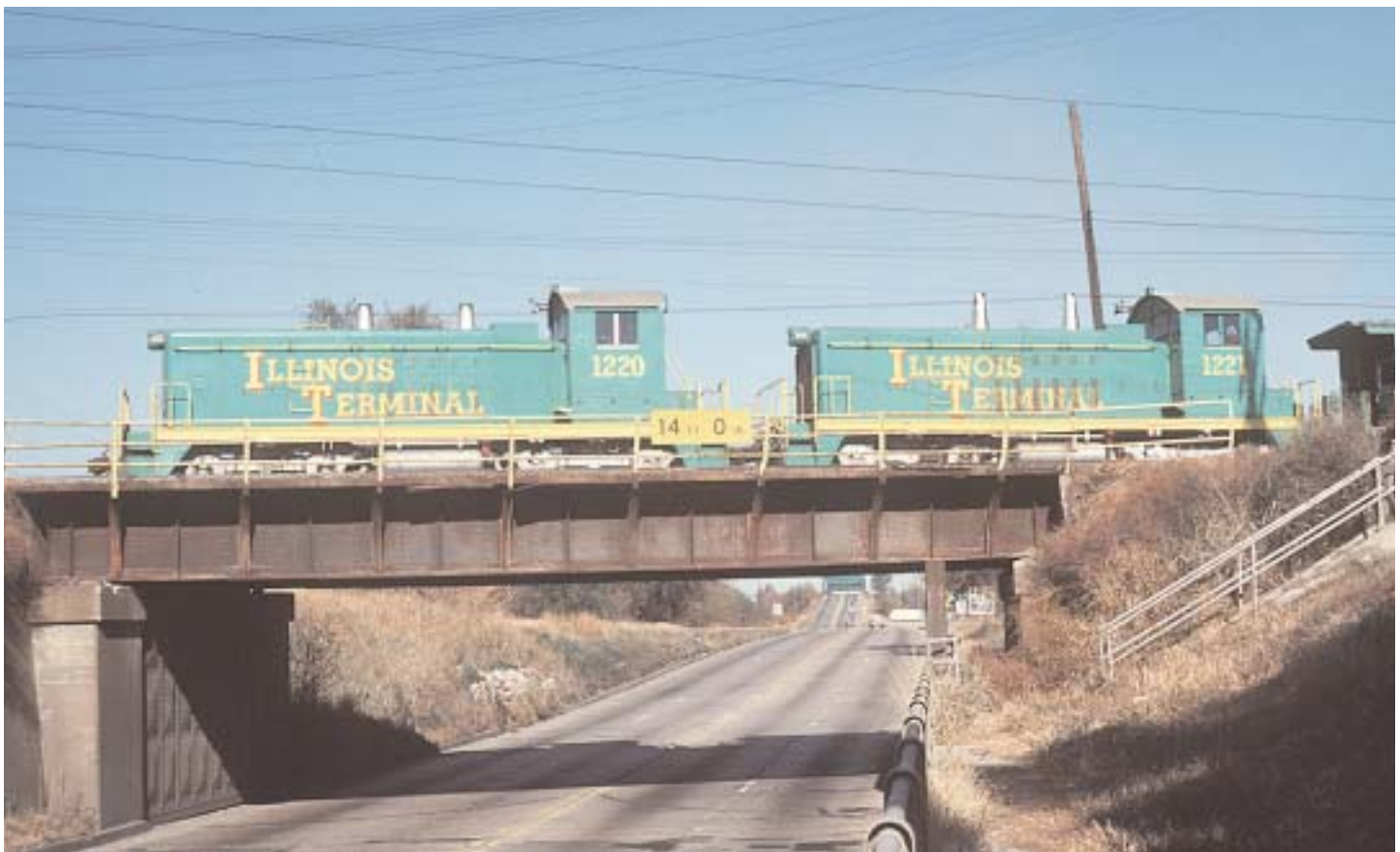
Both leased SW1200s at Madison in November 1980