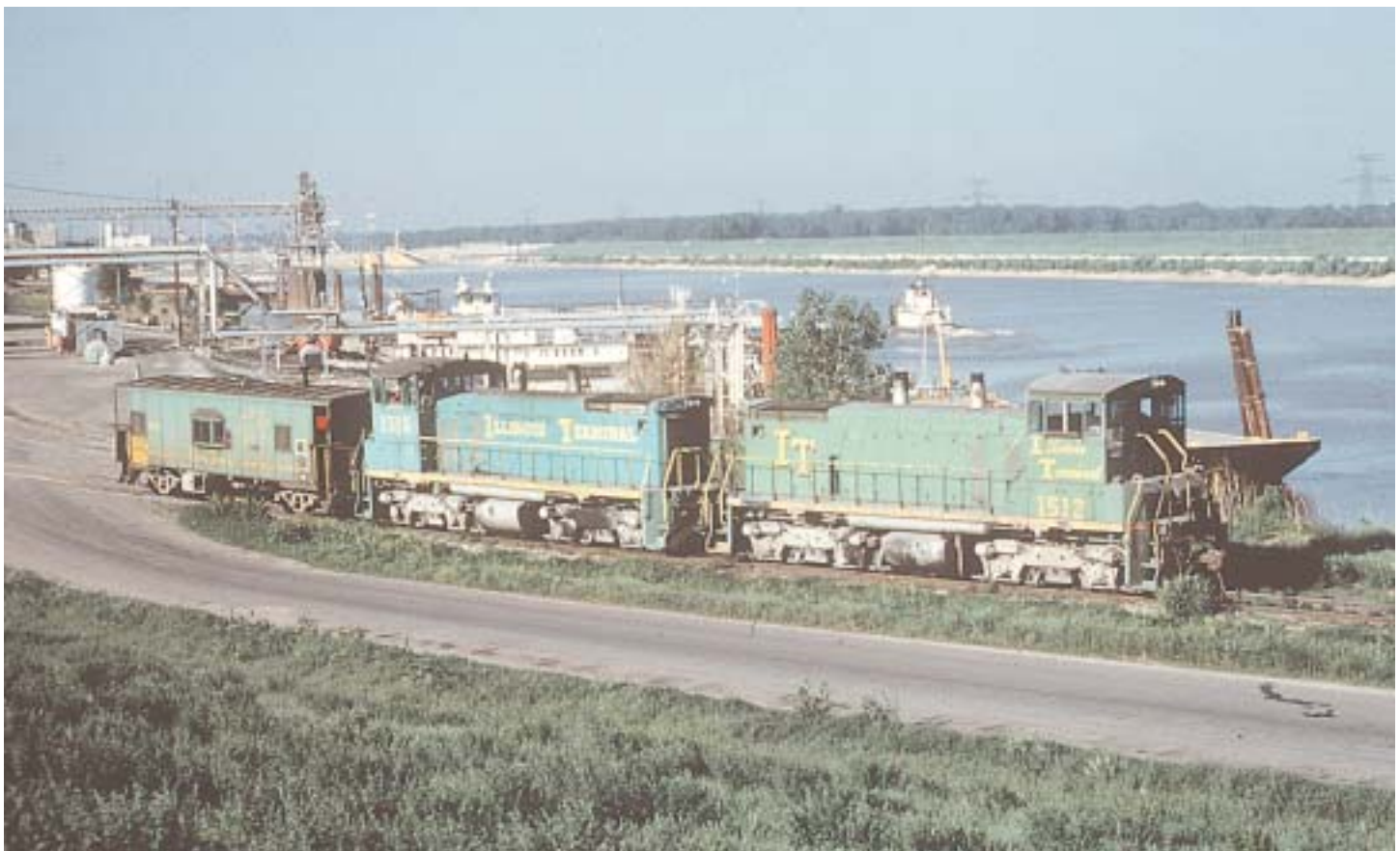
SW1500 at Granite City docks in 1981 one in each scheme