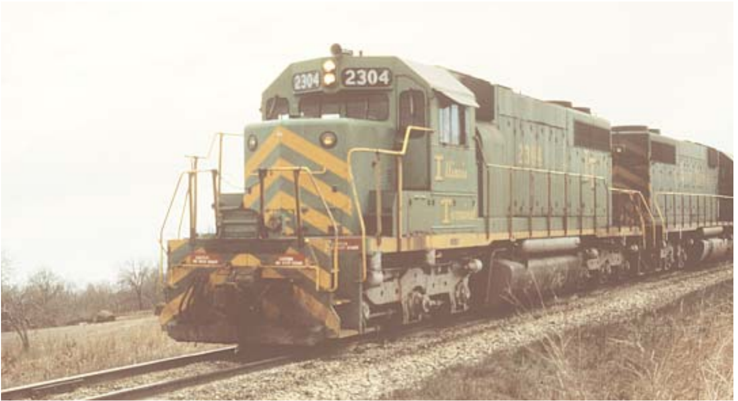
SD39 on GM&O track