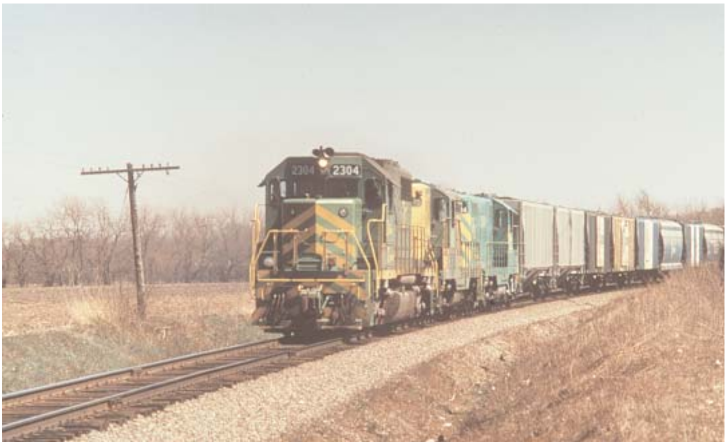
SD39 on NW near Springfield, IL in 1971