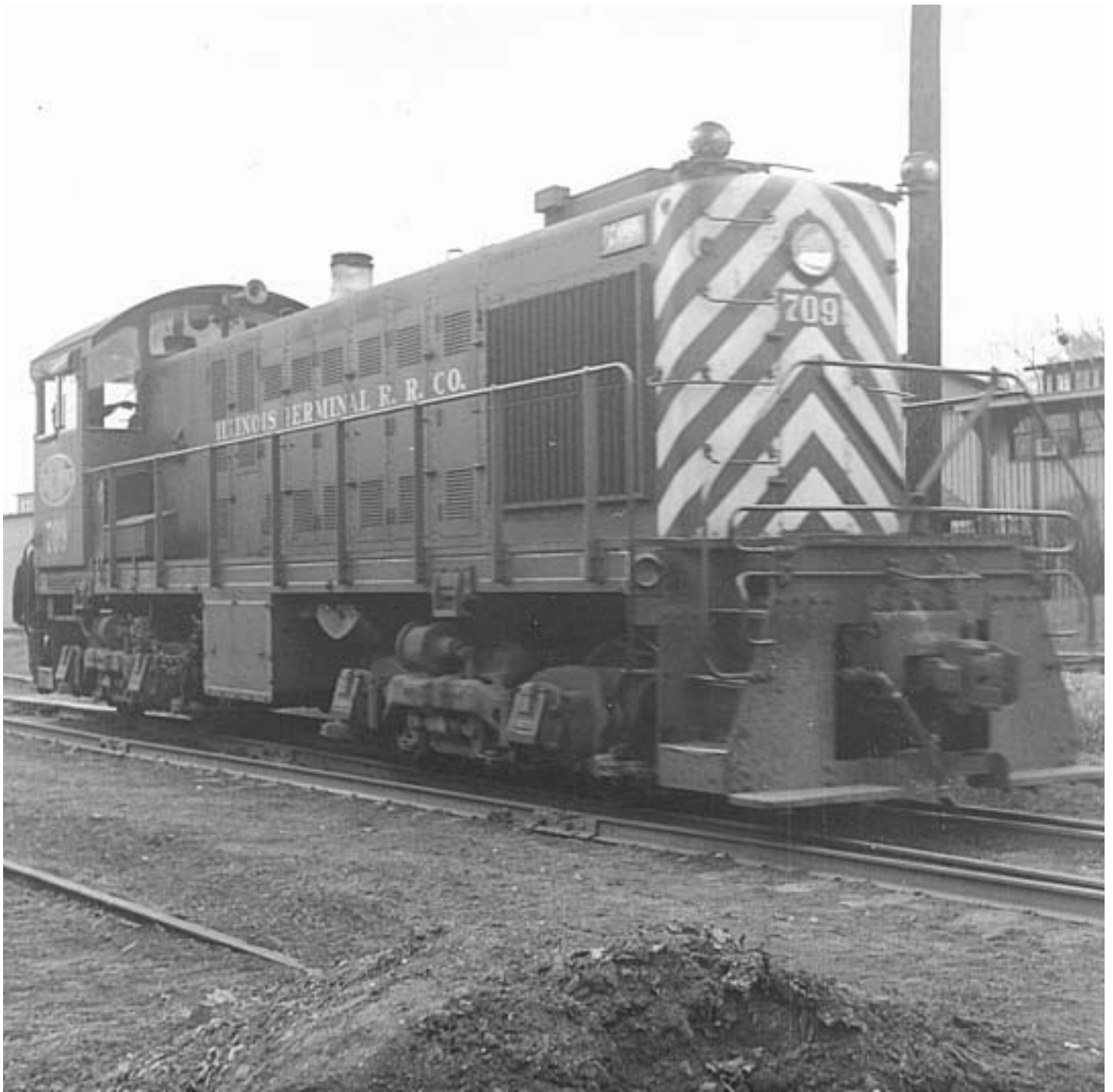
S2 at Decatur wearing scheme 1