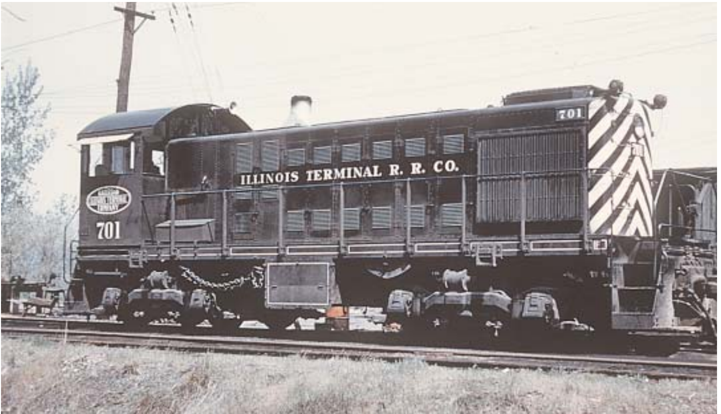
S2 at Leclaire, Edwardsville in May 1956, scheme 1 Previous page: S2 at Federal wearing scheme 2