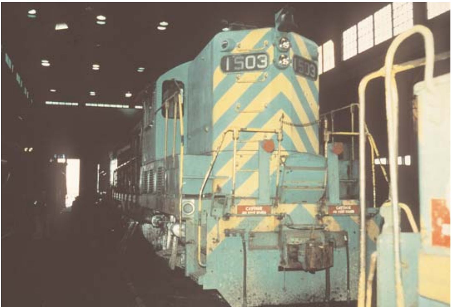
GP7 in the Federal Shops wearing scheme 5