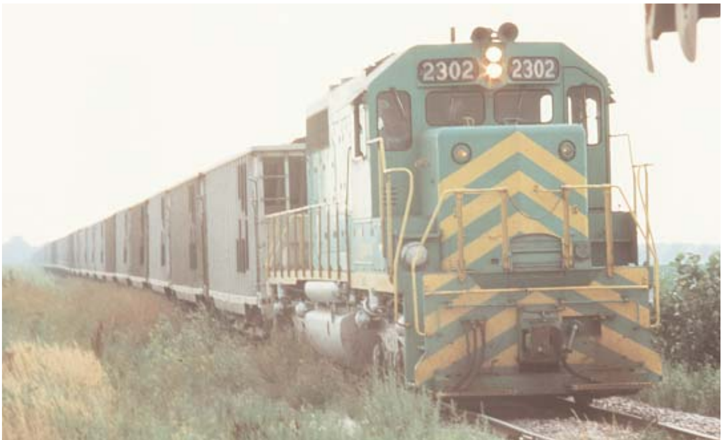
SD39 with Unit Coal, Monterey Mine turn