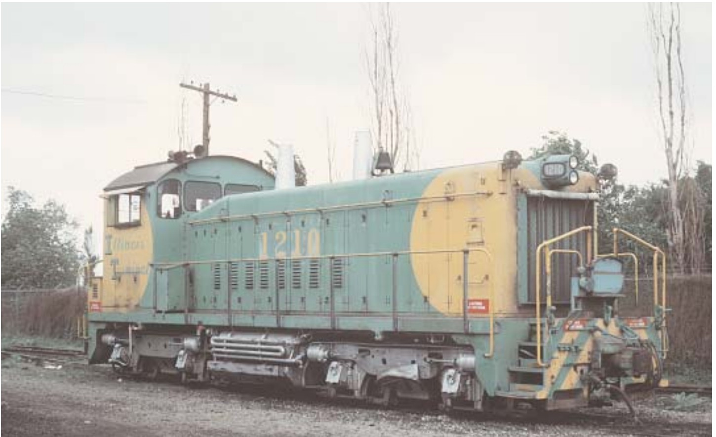
SW1200 at Madison in April 1976 wearing scheme 5