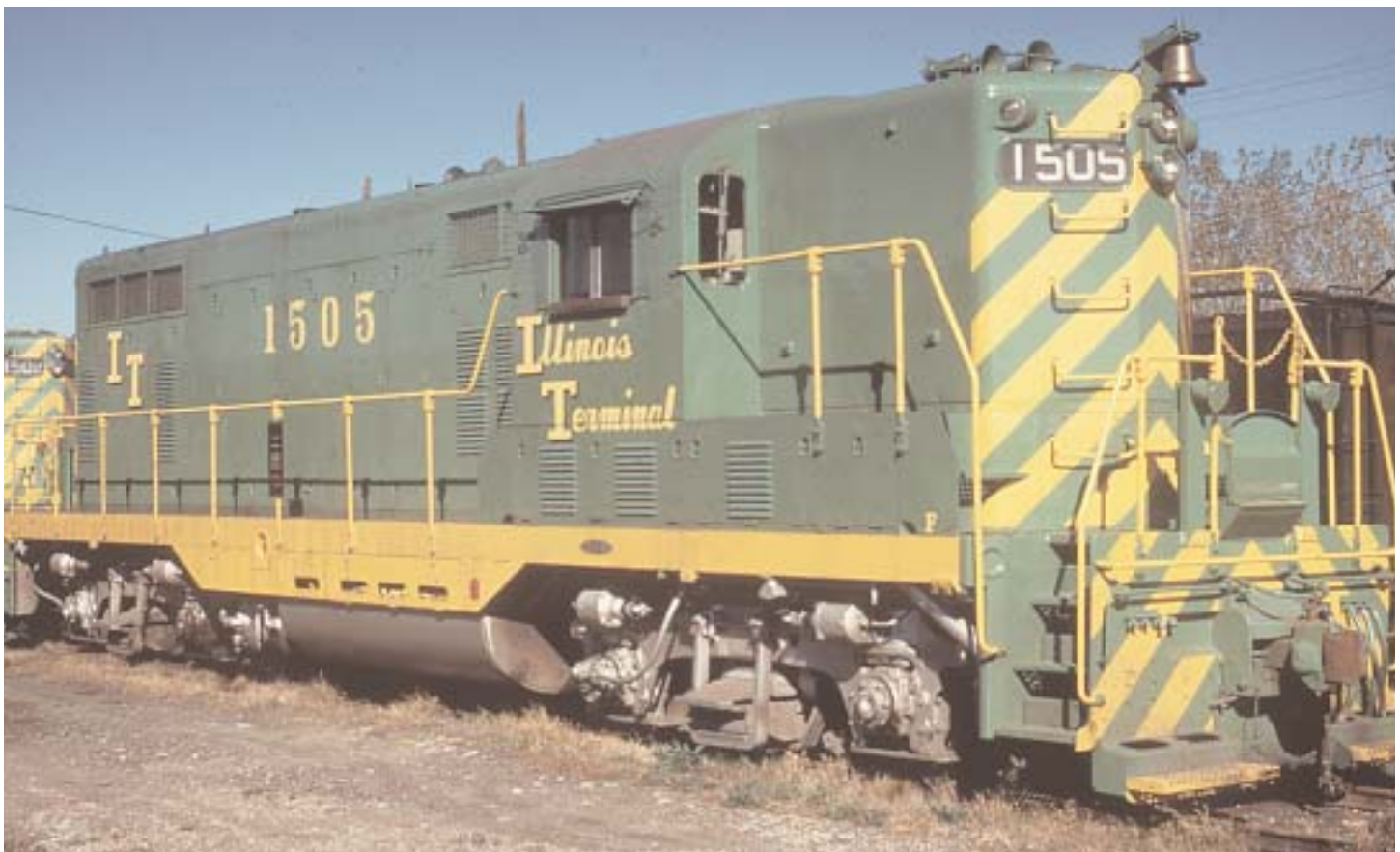
GP7 at Decatur in 1972 wearing scheme 5