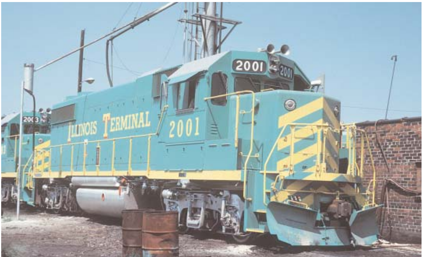
GP38-2 at Madison in July 1977