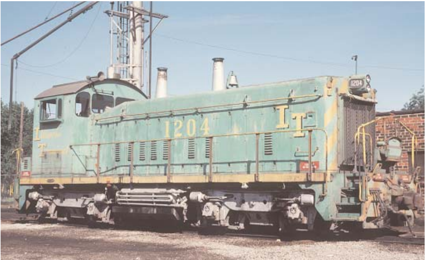
SW1200 at Madison in May 1980 wearing scheme 5