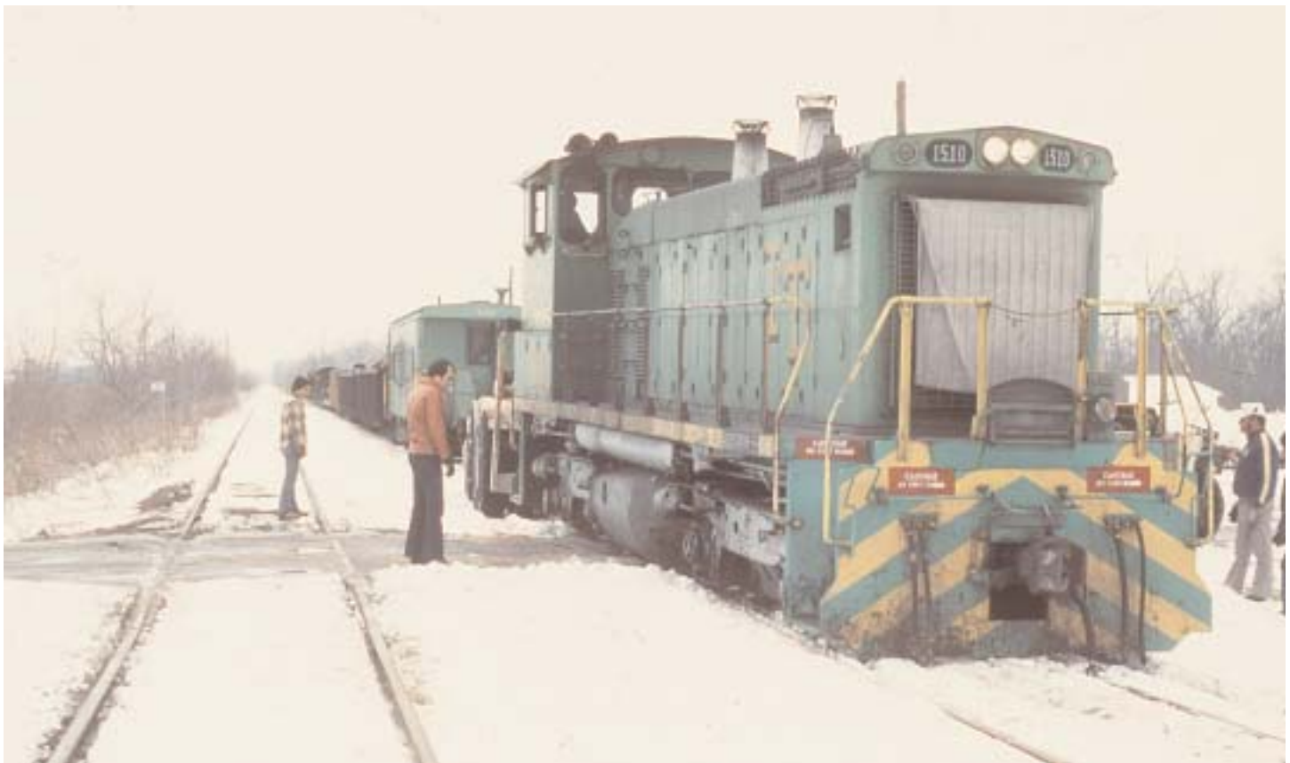
SW1500 derailed at Sheep siding in 1978 in scheme 1