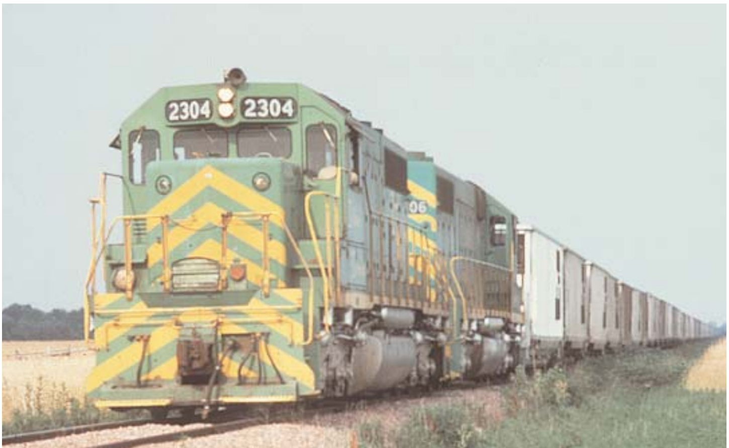
SD39 near Loveless on C&NW 1977