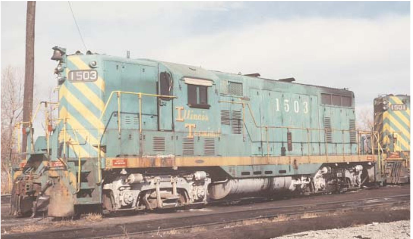
GP7 at Madison in January 1980 wearing scheme 5