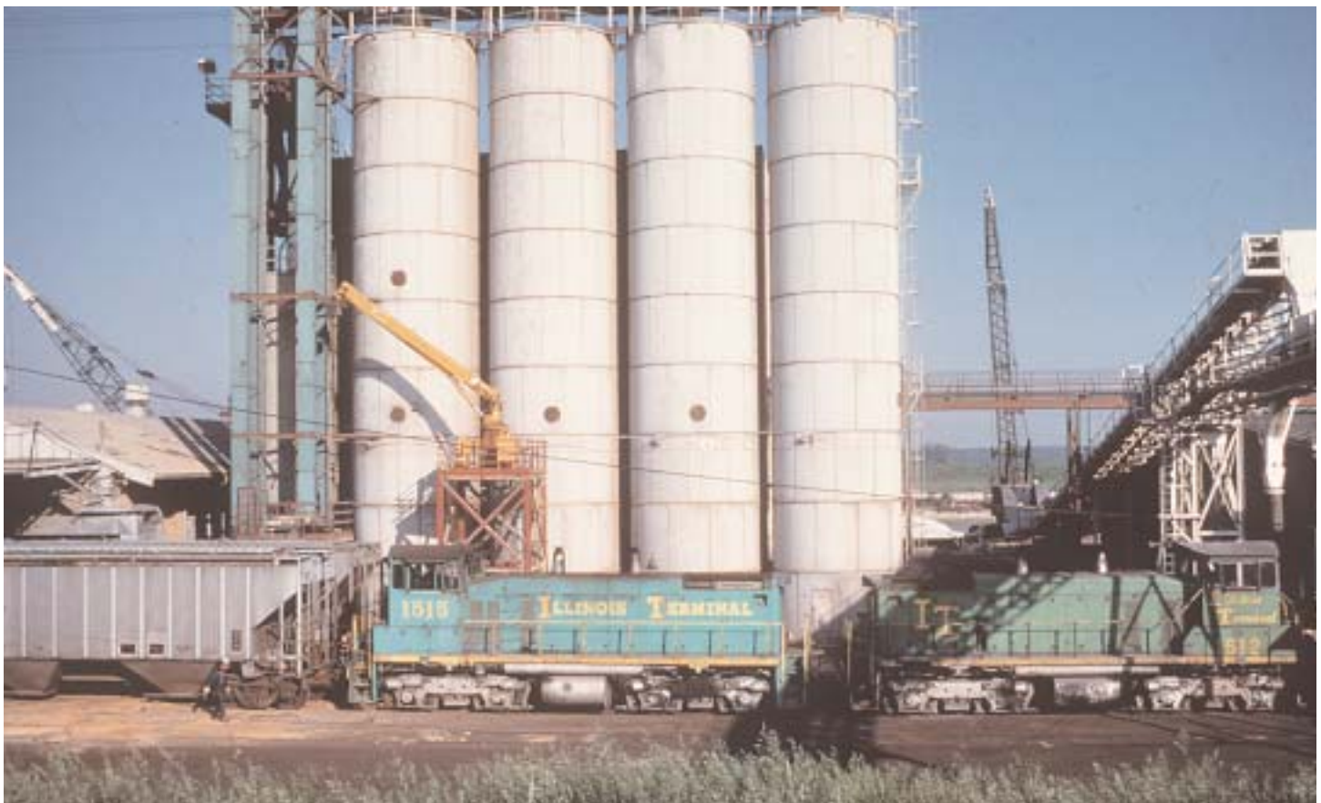
SW1500 at Granite City docks in 1981 in scheme 2