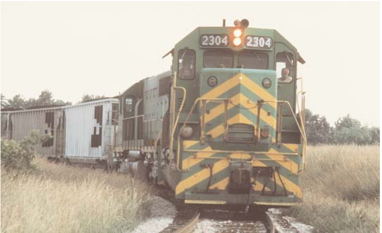
SD39 at Monterey Mine, Loveless in 1977