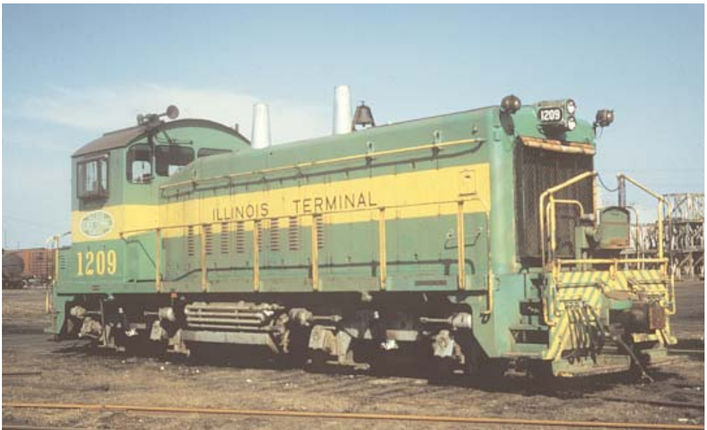
SW1200 at Decatur wearing scheme 2