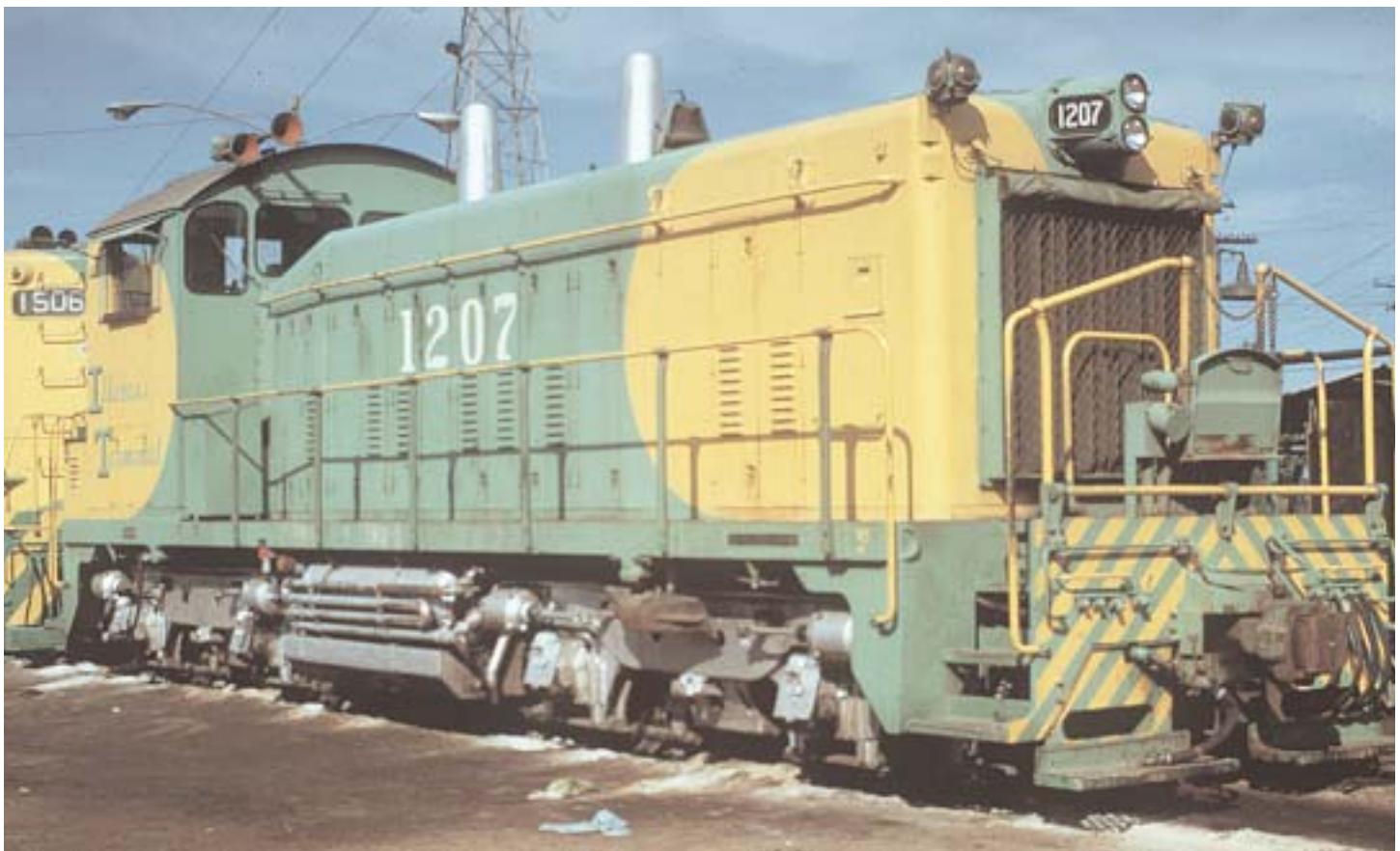
SW1200 at Lang, Madison, IL in 1971, scheme 4