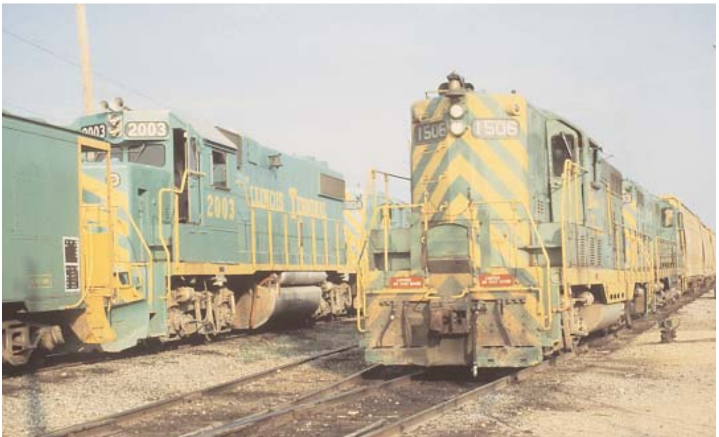
GP7 at Allentown Yard wearing scheme 5