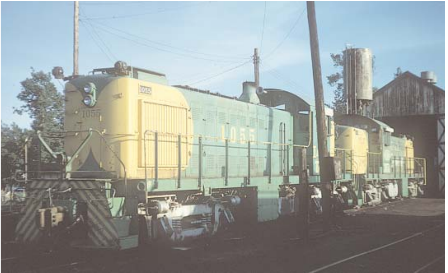
RS1 East Belt Barn, Springfield, IL wearing scheme 4