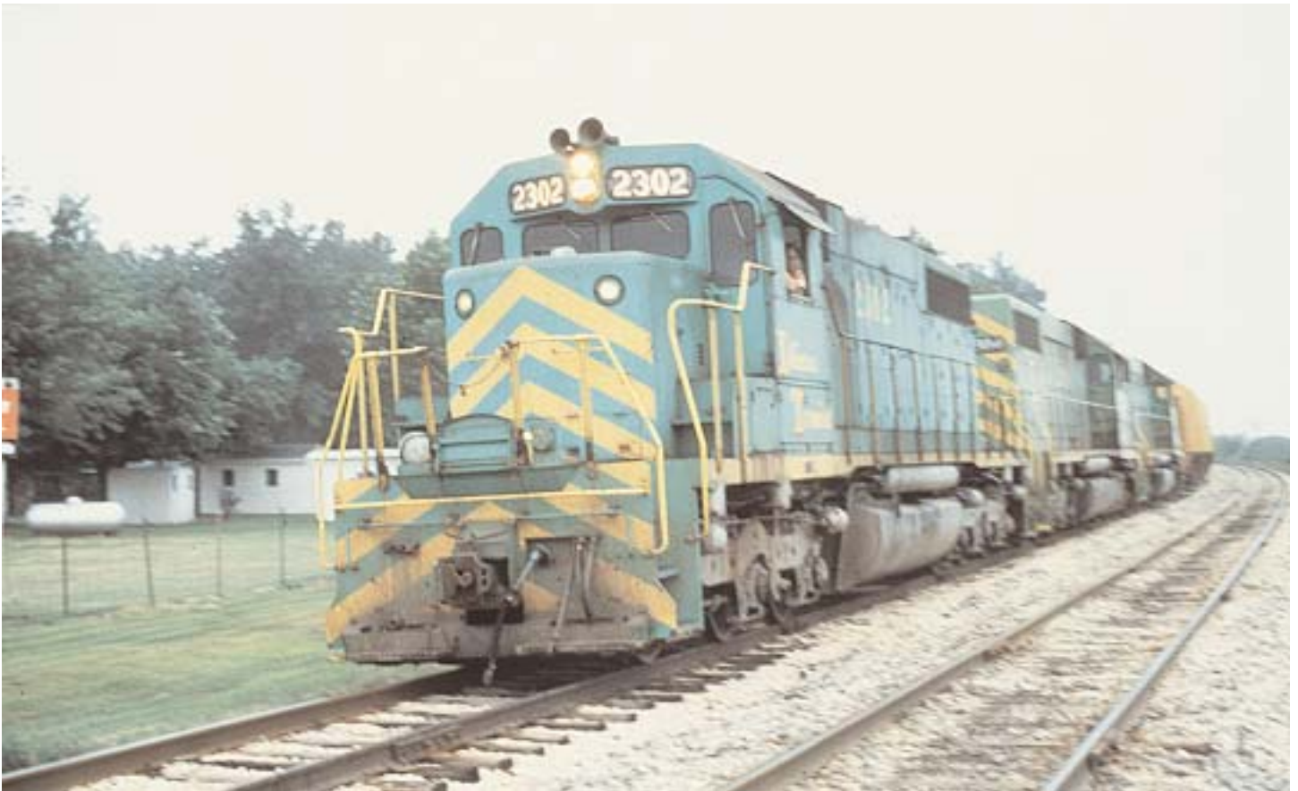
SD39s 2302 and 2304