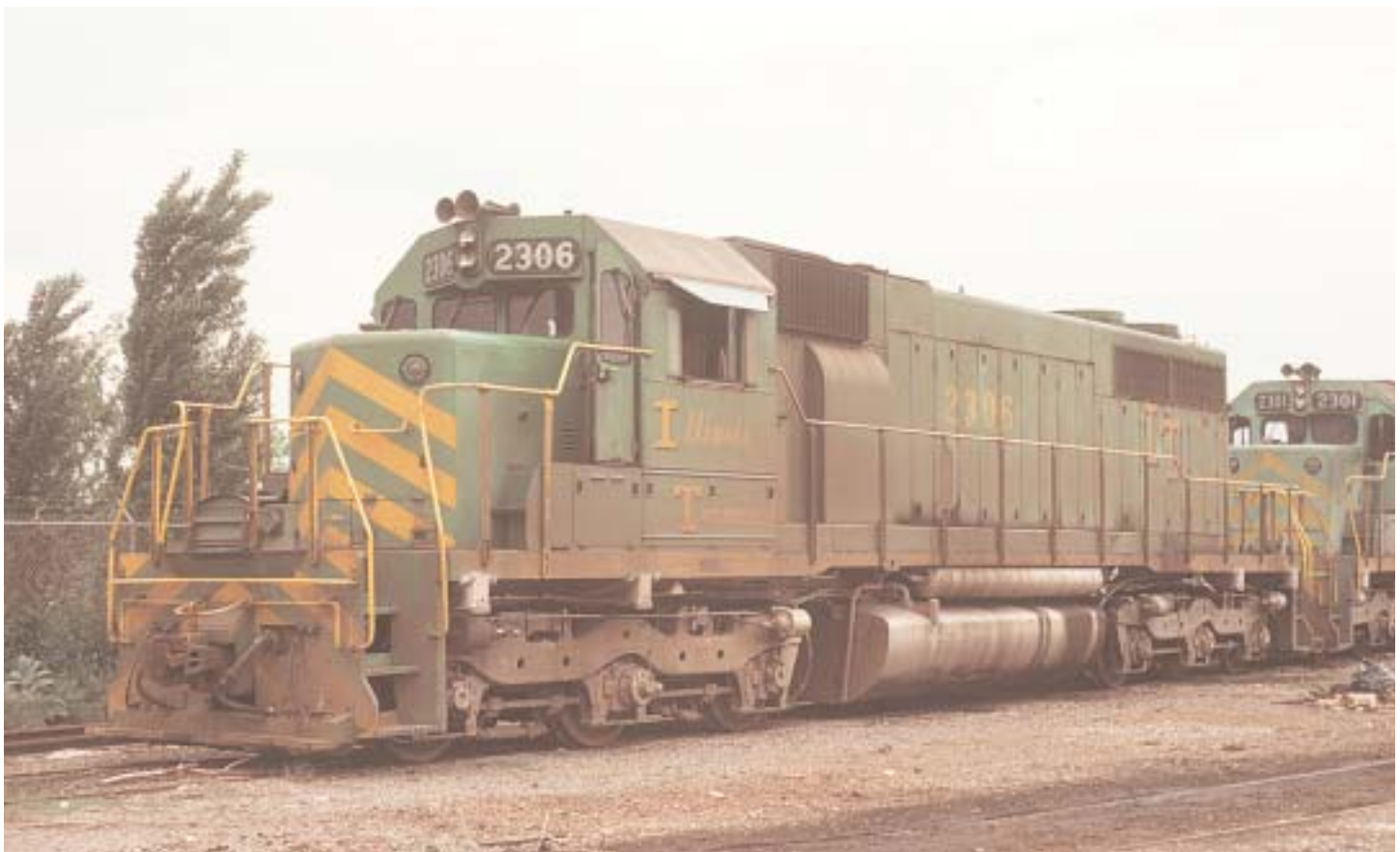
SD39 number 2306 in May 1975 at Madison wearing scheme 1