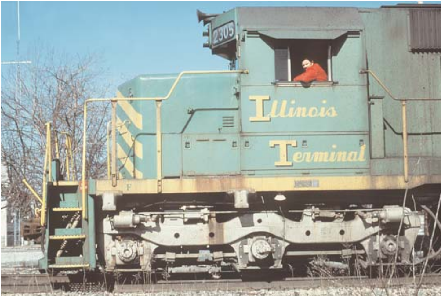
SD39 number 2305