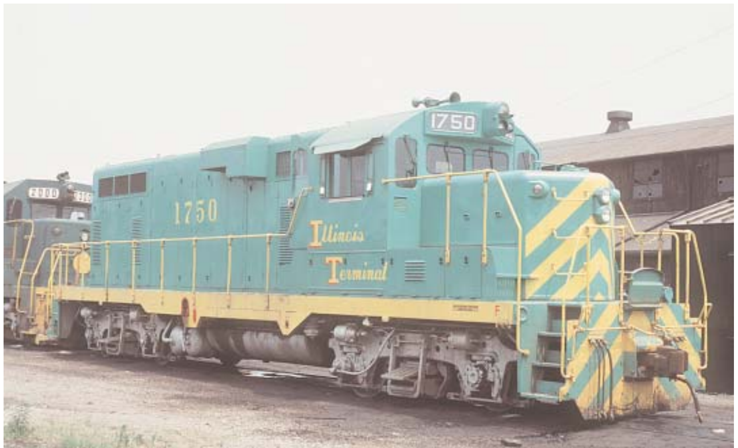
GP10 is former Wabash number 475 at Madison in June 1977