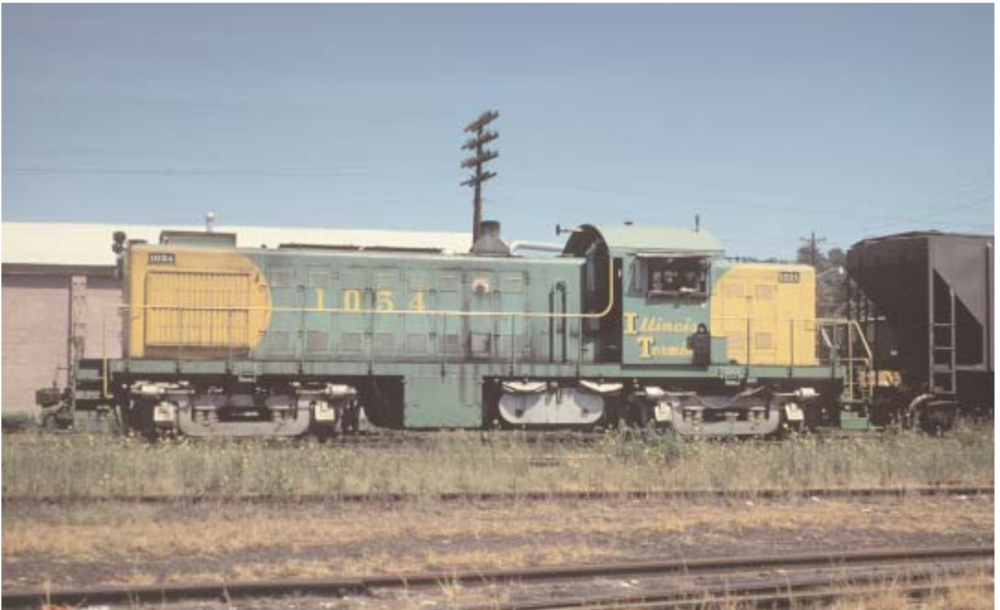
RS1 in June 1969 wearing scheme 4