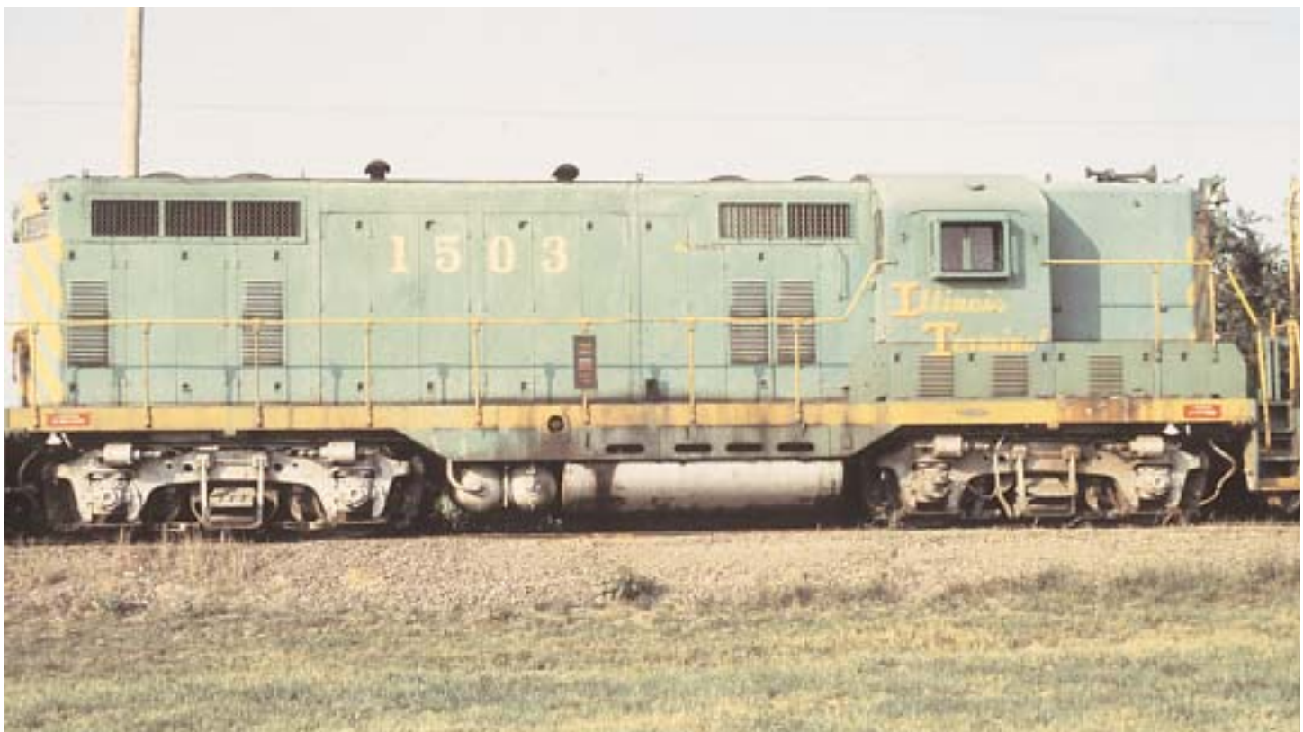
GP7 at Decatur before 1981 wearing scheme 5