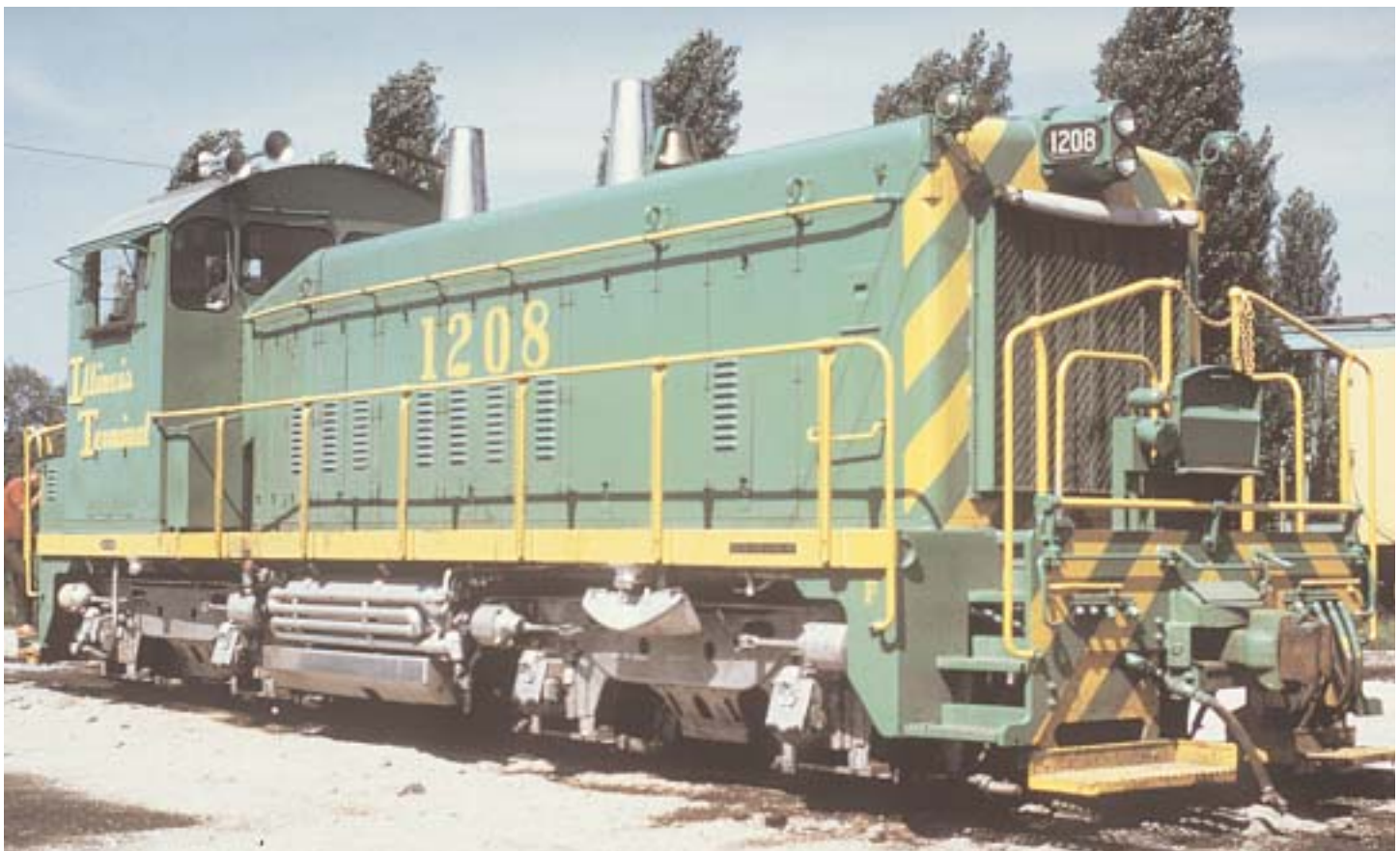
SW1200 in July of 1969, Madison, IL, scheme 5