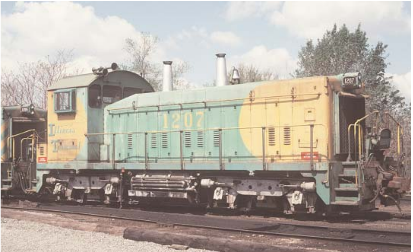
SW1200 at Madison in April 1979 wearing scheme 4