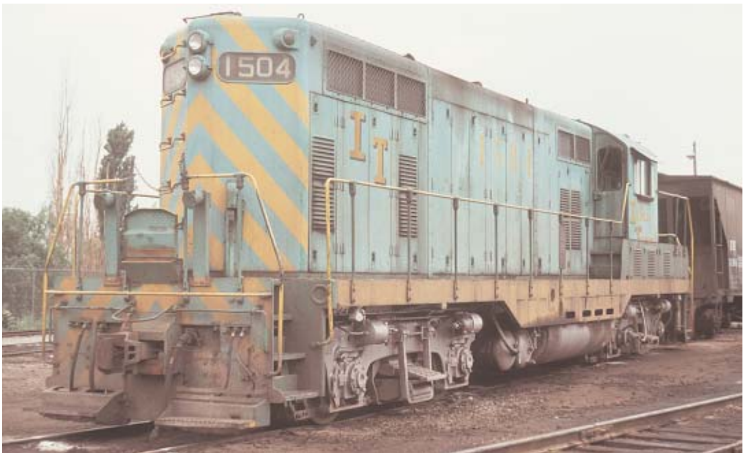
GP7 at Madison in May 1975 wearing scheme 5