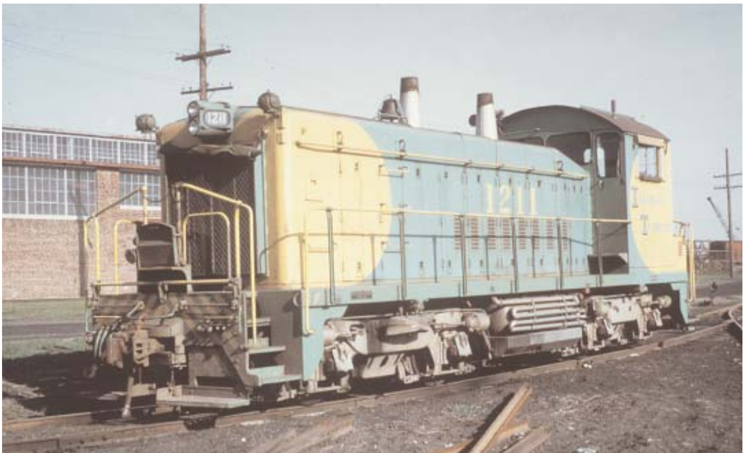
SW1200 at Decatur in 1969, scheme 4