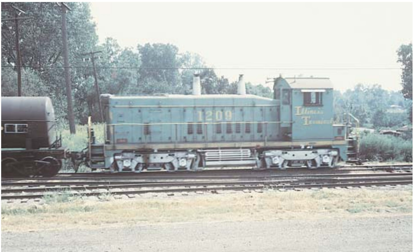
SW1200 at Lang, Madison, IL wearing scheme 5