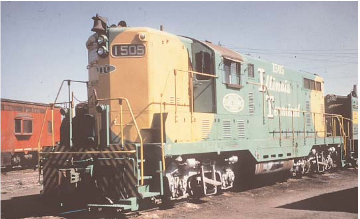
GP7 at Madison, IL in 1968 wearing scheme 3