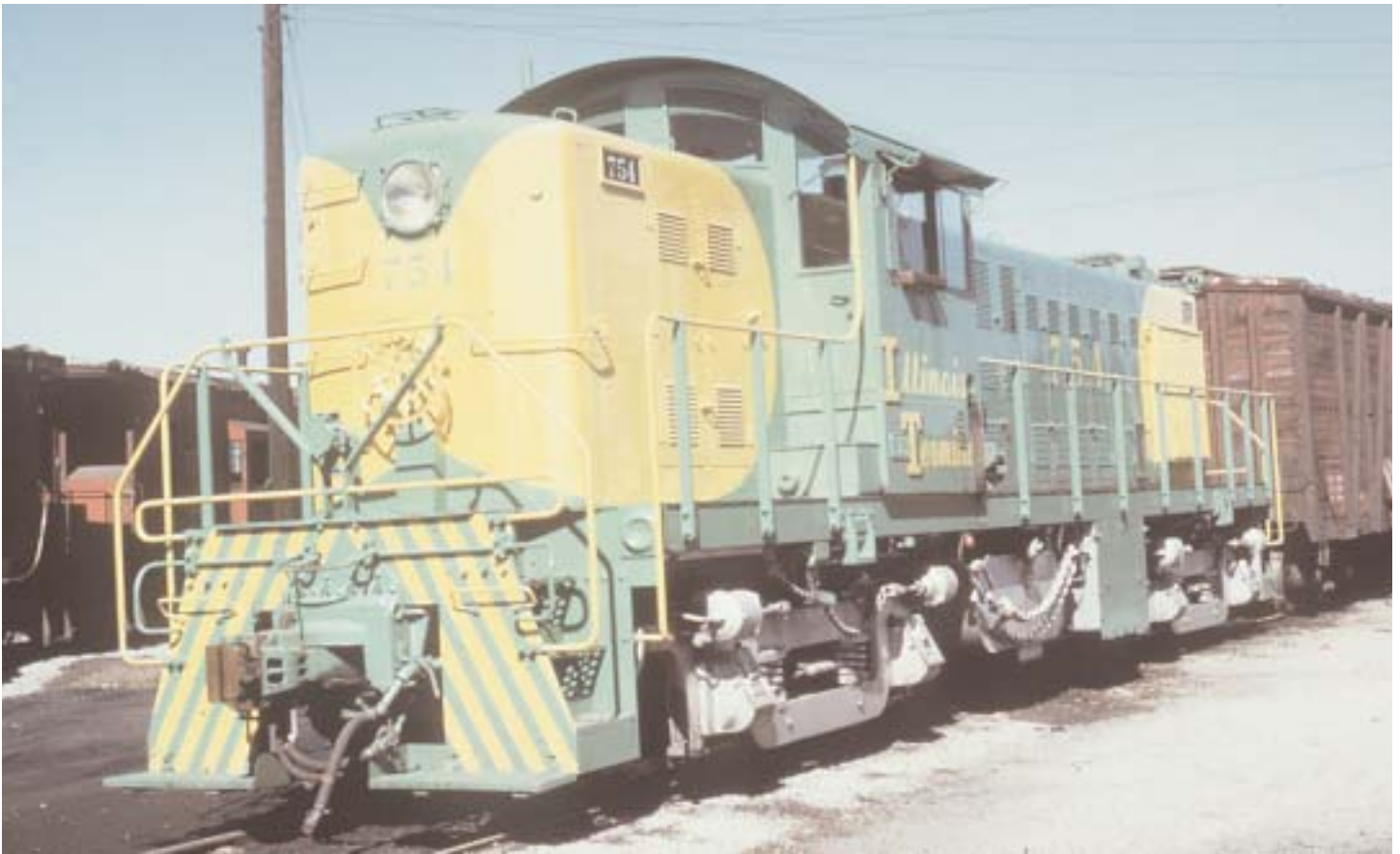
RS1 at Lang, Madison, IL wearing scheme 4 in 1966