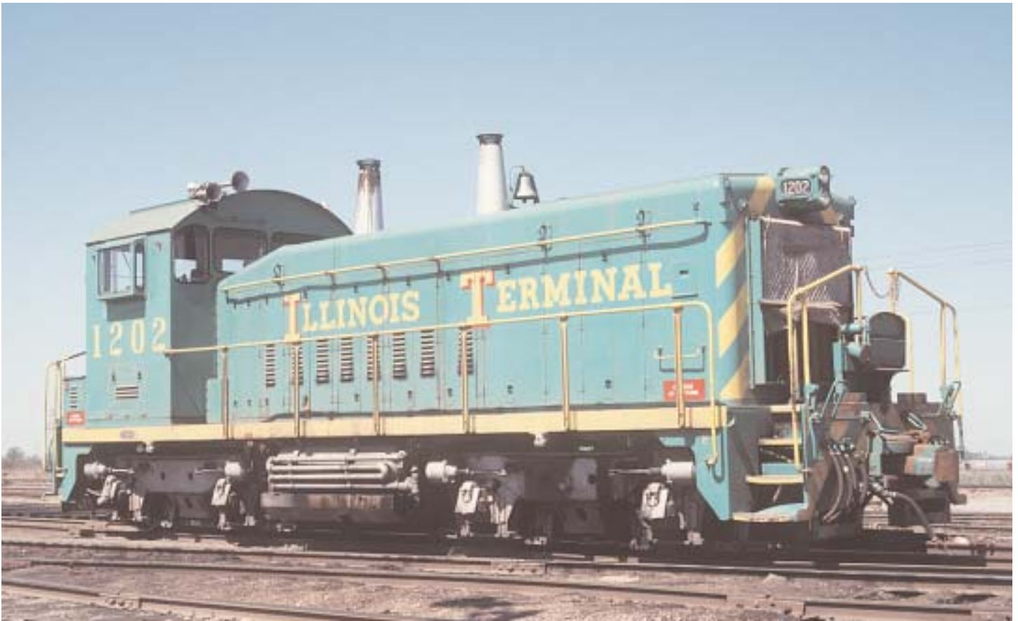
SW1200 at Madison in May 1979 wearing scheme 6