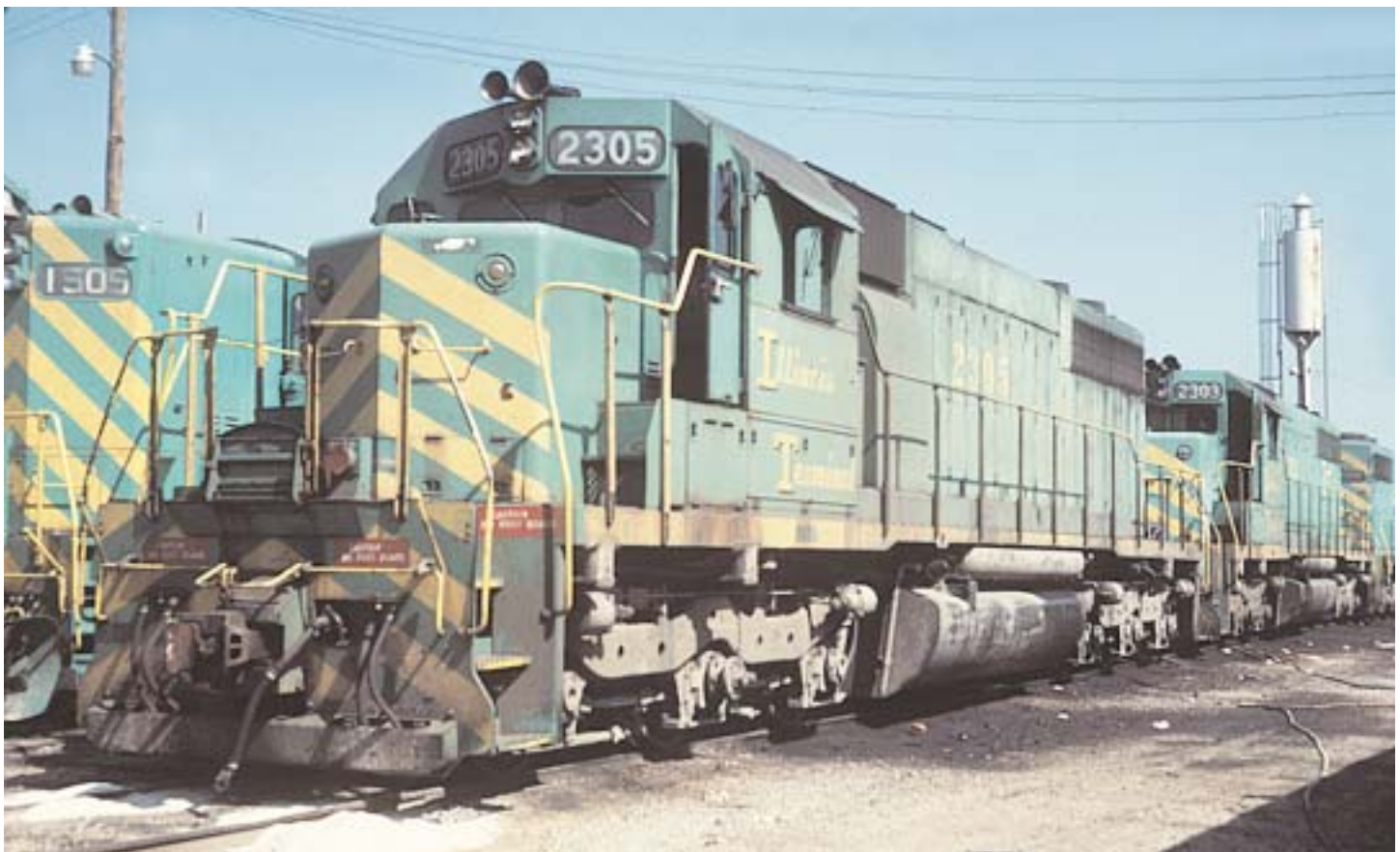
SD39 and GP7 1505 at Decatur