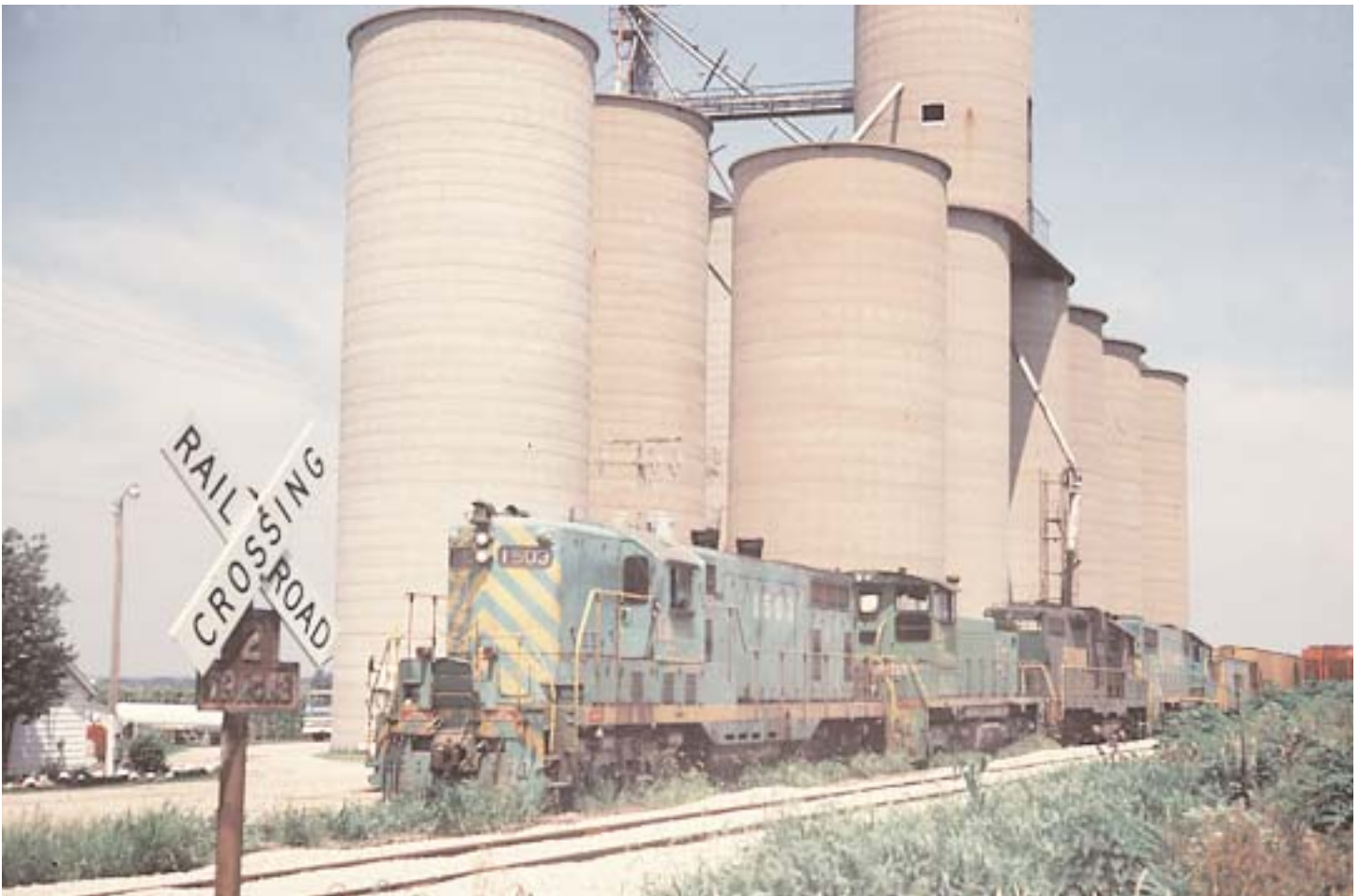
GP7 at Tabor wearing scheme 5 before 1981