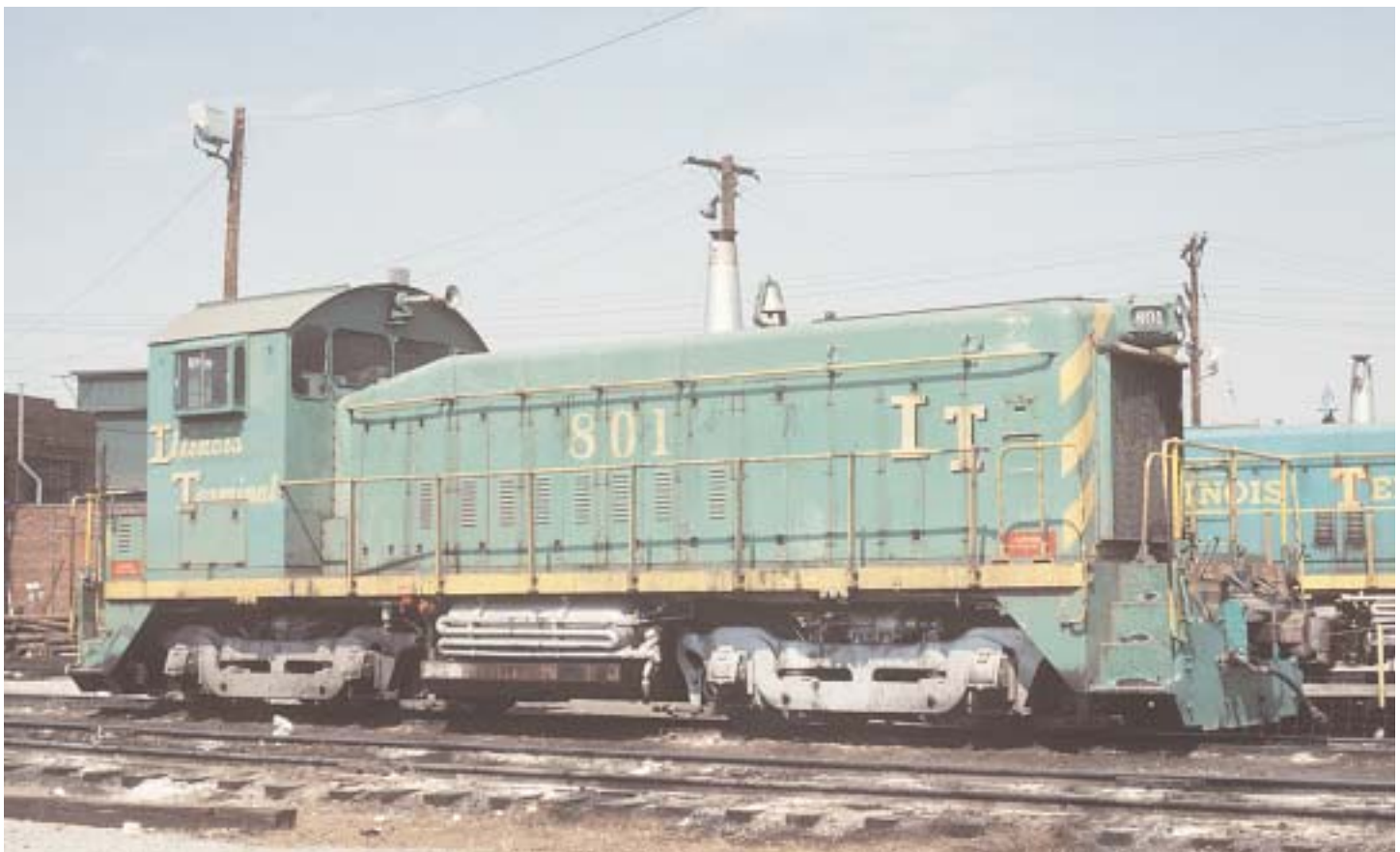
SW800 in scheme 3 at Federal in March 1981