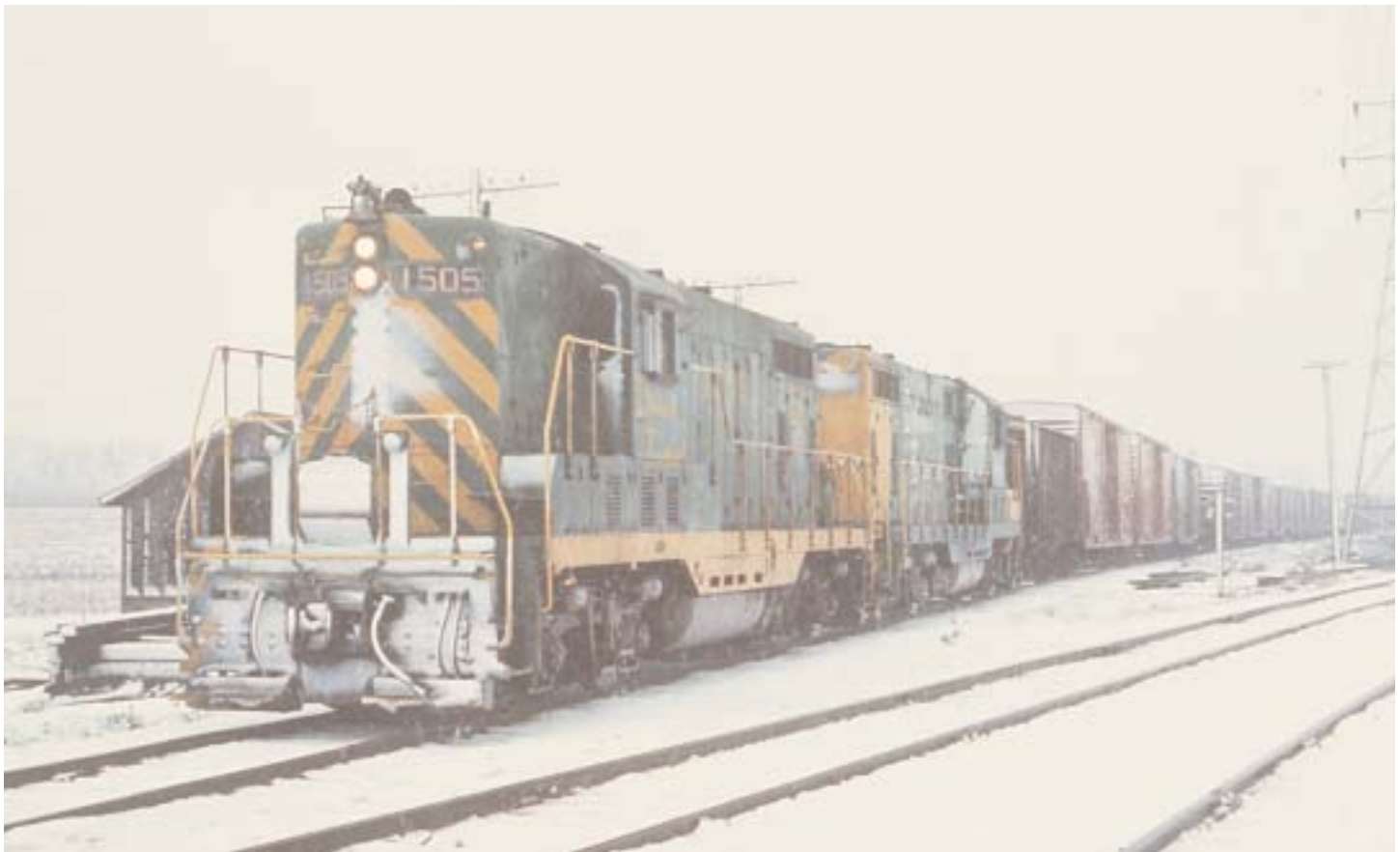
GP7 at White Heath in November 1972 wearing scheme 5