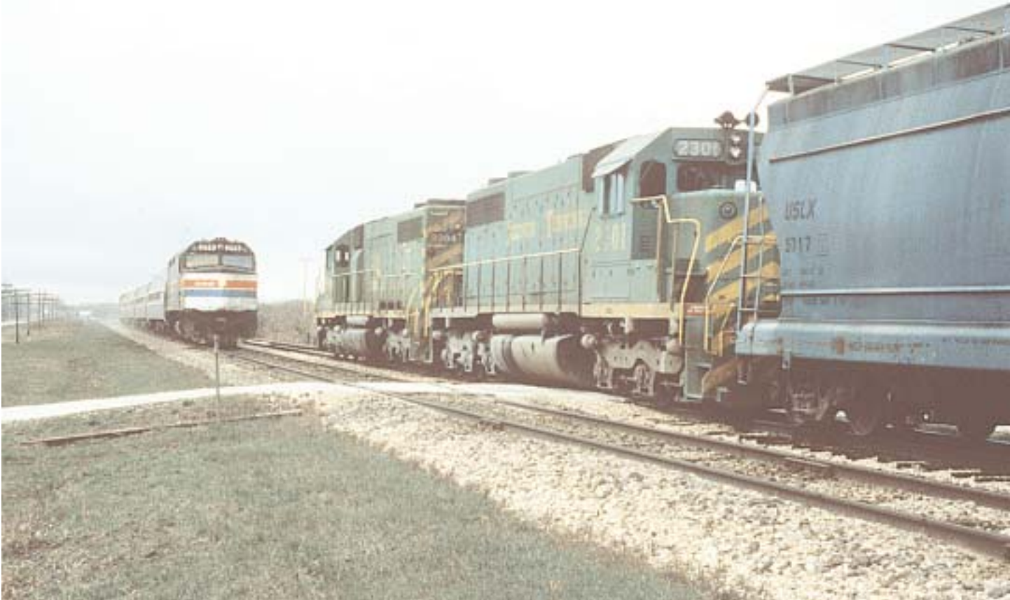
SD39 and Amtrak at Nilwood on GM&O