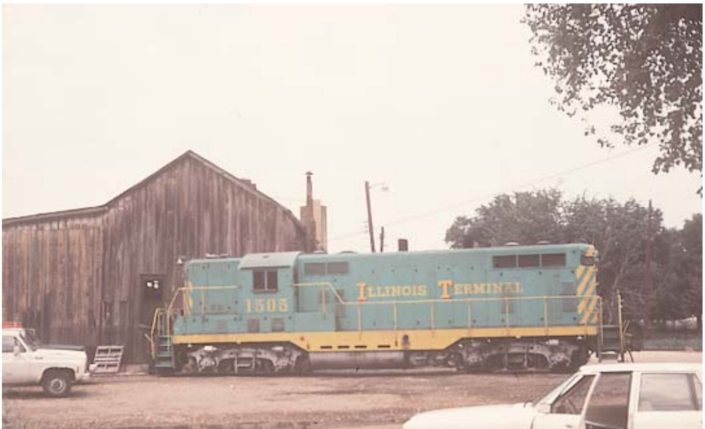
GP7 at East Belt between 1979 and 1981 wearing scheme 6