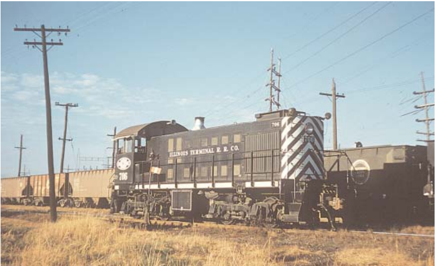
S2 at Springfield in November 1961, scheme 1