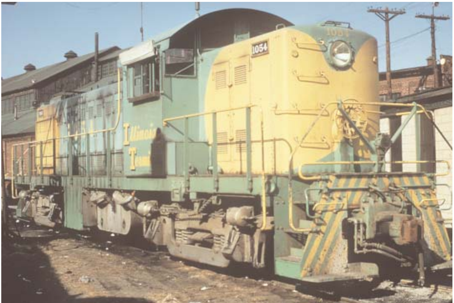
RS1 at Alton, Illinois wearing scheme 4