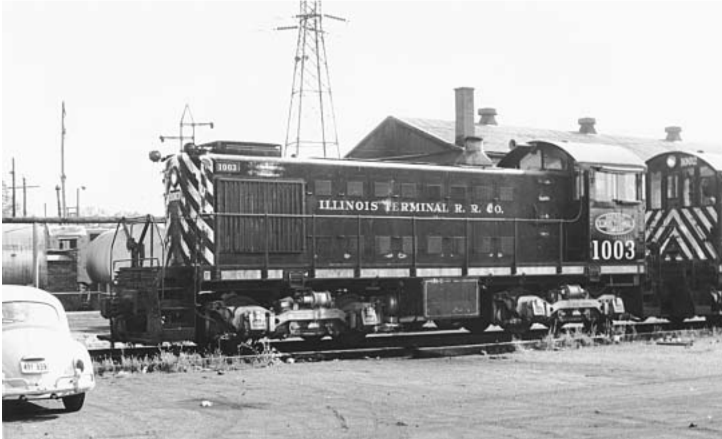
S2 at Madison in August 1967 wearing scheme 1