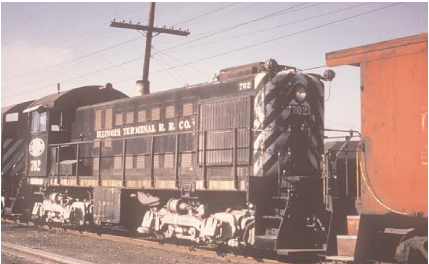
S2 in 1966, scheme 1, Lang, Madison, IL