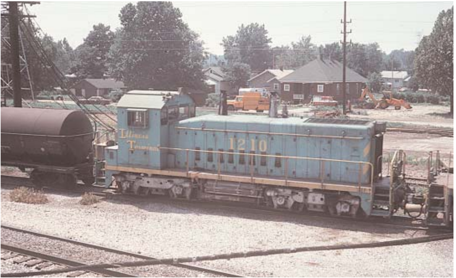
SW1200 at Wood River wearing scheme 5