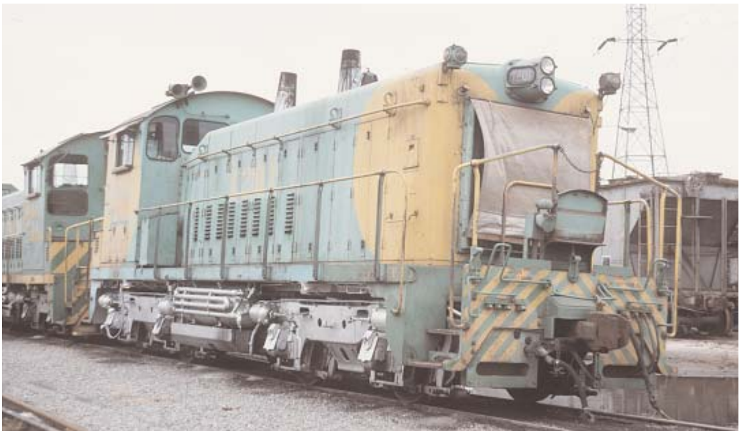
SW1200 at Madison in November 1975 wearing scheme 4