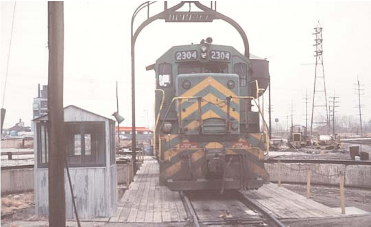
SD39 in Federal in 1980