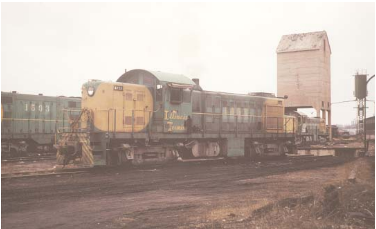
RS1 at Federal wearing scheme 4