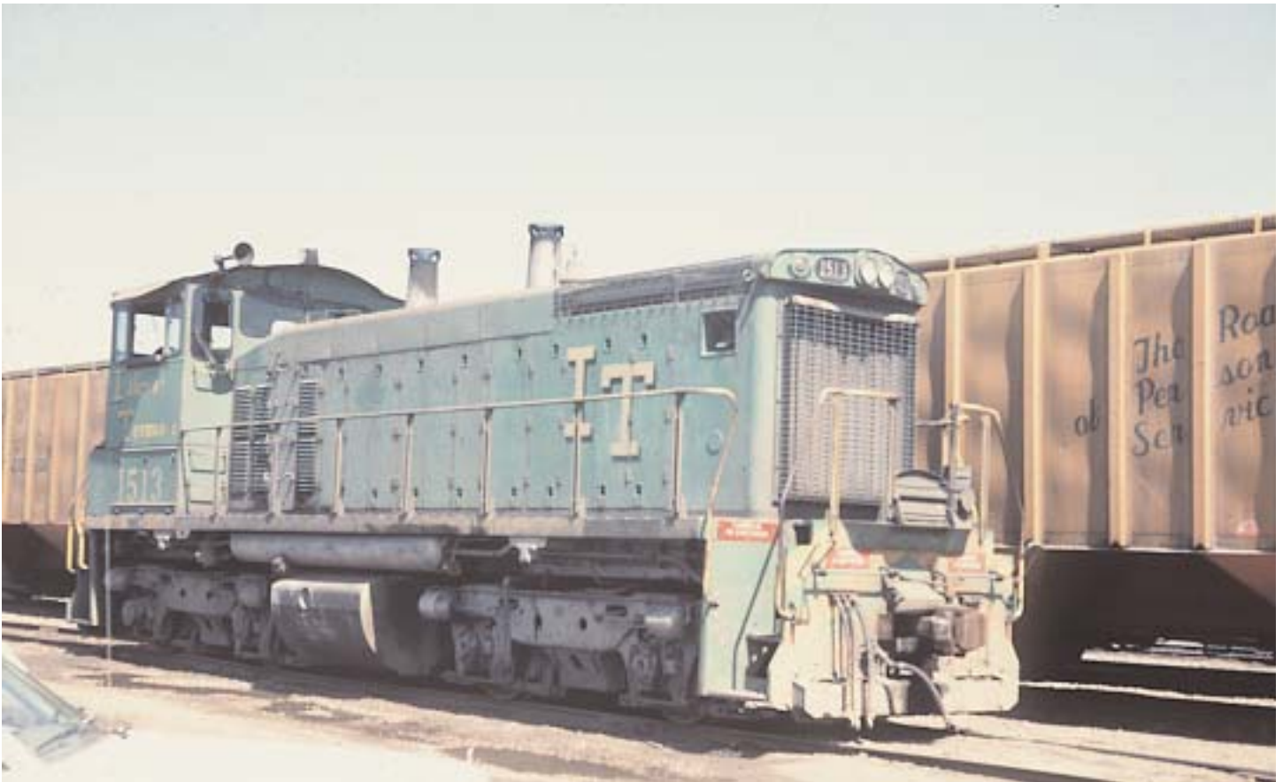
SW1500 at Decatur wearing scheme 1