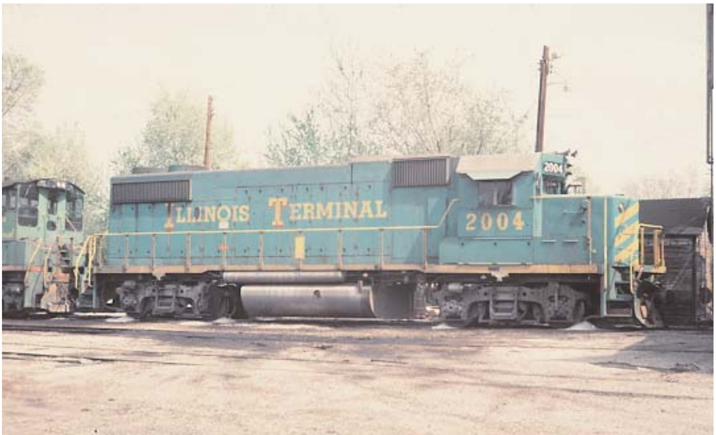
GP38-2 at East Belt Barn