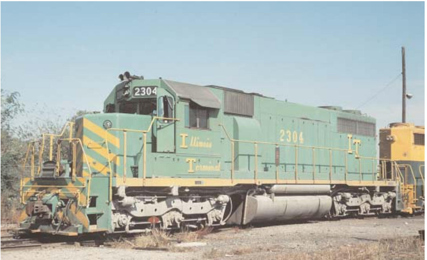
SD39 number 2304 at Madison wearing scheme 1