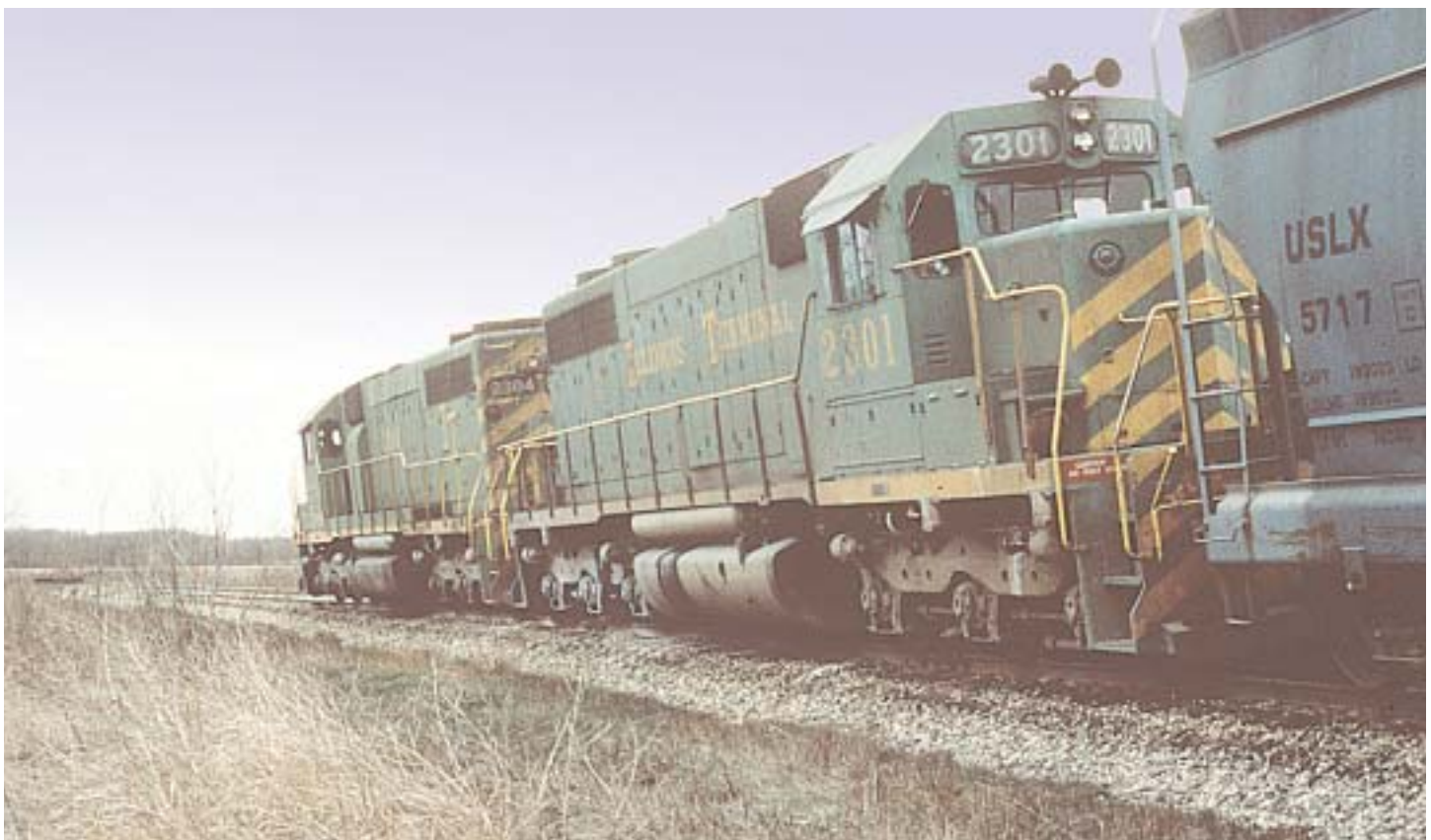
SD39s 2301 and 2304 on GM&O