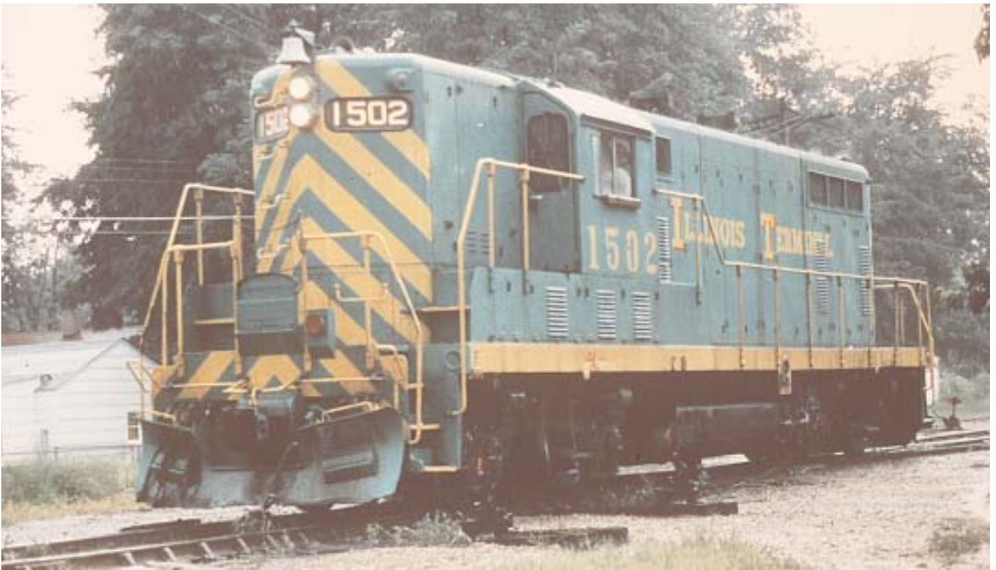
GP7 at East Belt between 1980 and 1981 wearing scheme 6