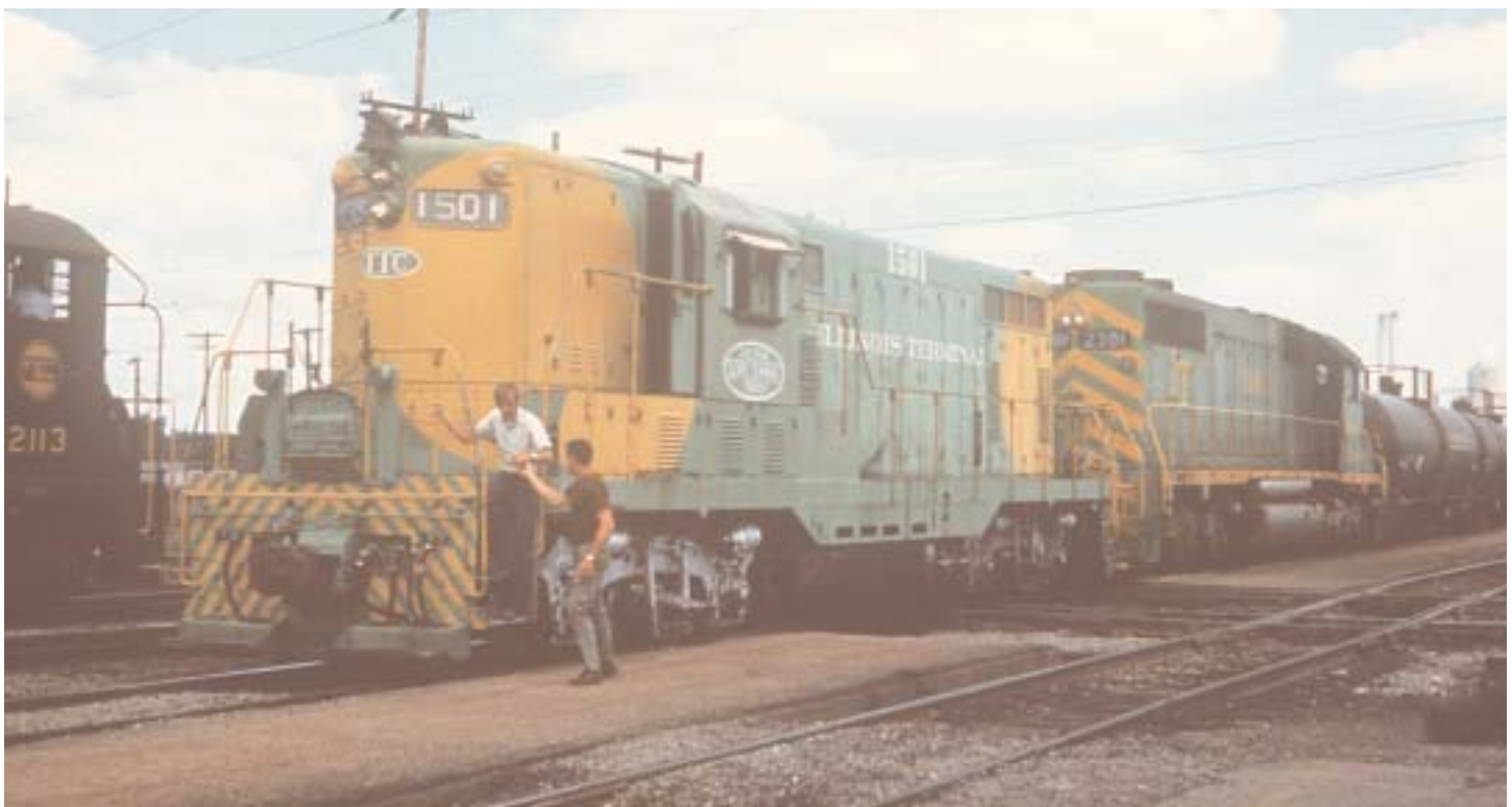
GP7 at Wabic Tower, Decatur in 1971 wearing scheme 2