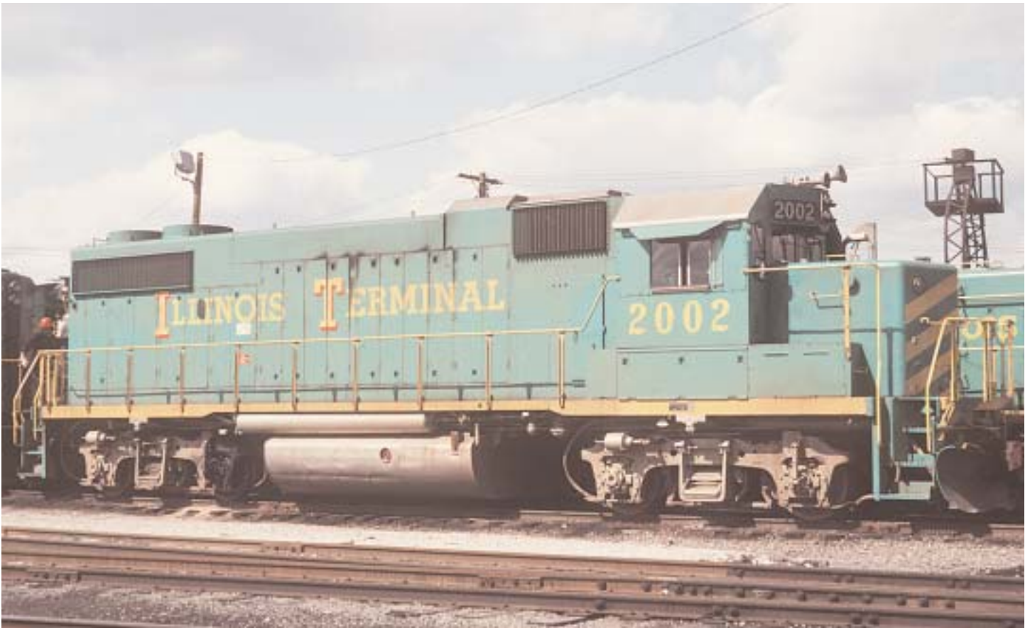
GP38-2 at Federal in April 1979