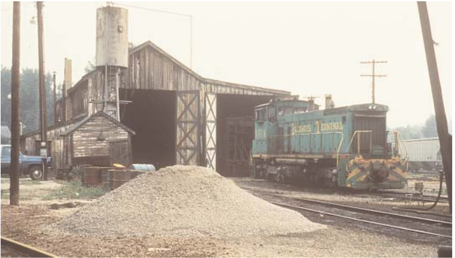
SW1500 at East Belt Barn, Springfield, IL in scheme 2