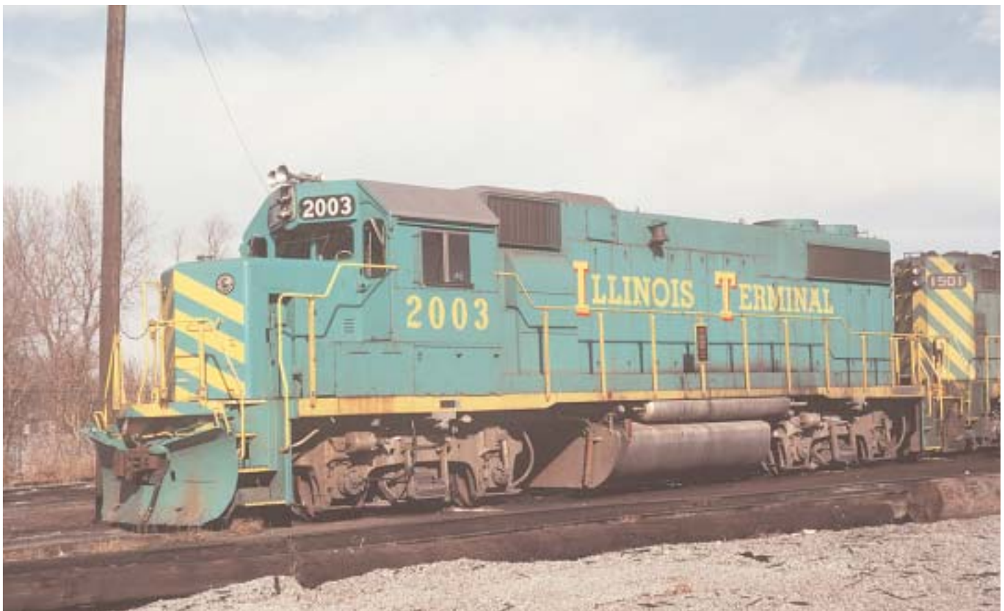
GP38-2 at Madison in January 1980