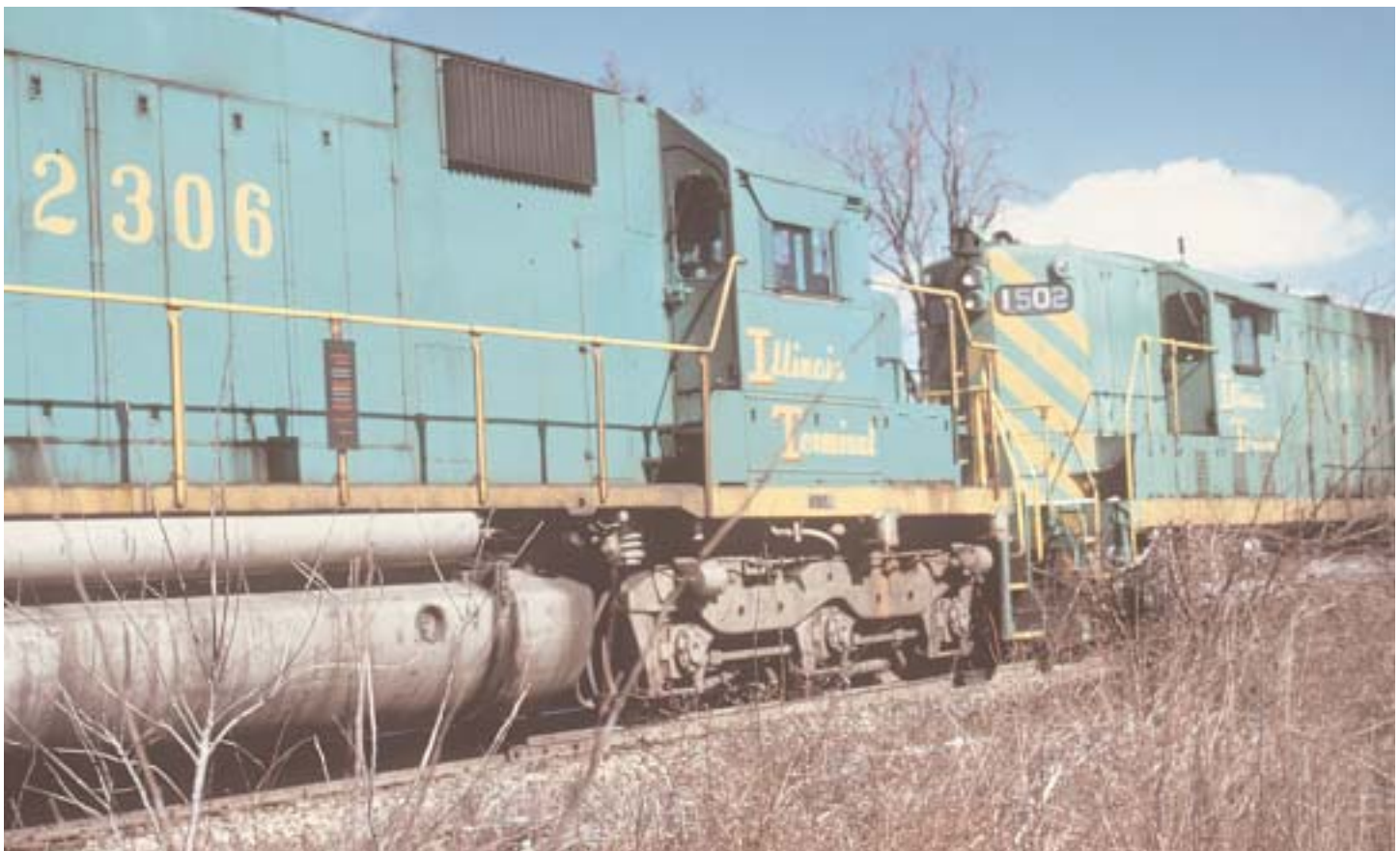
SD39 and GP7 number 1502