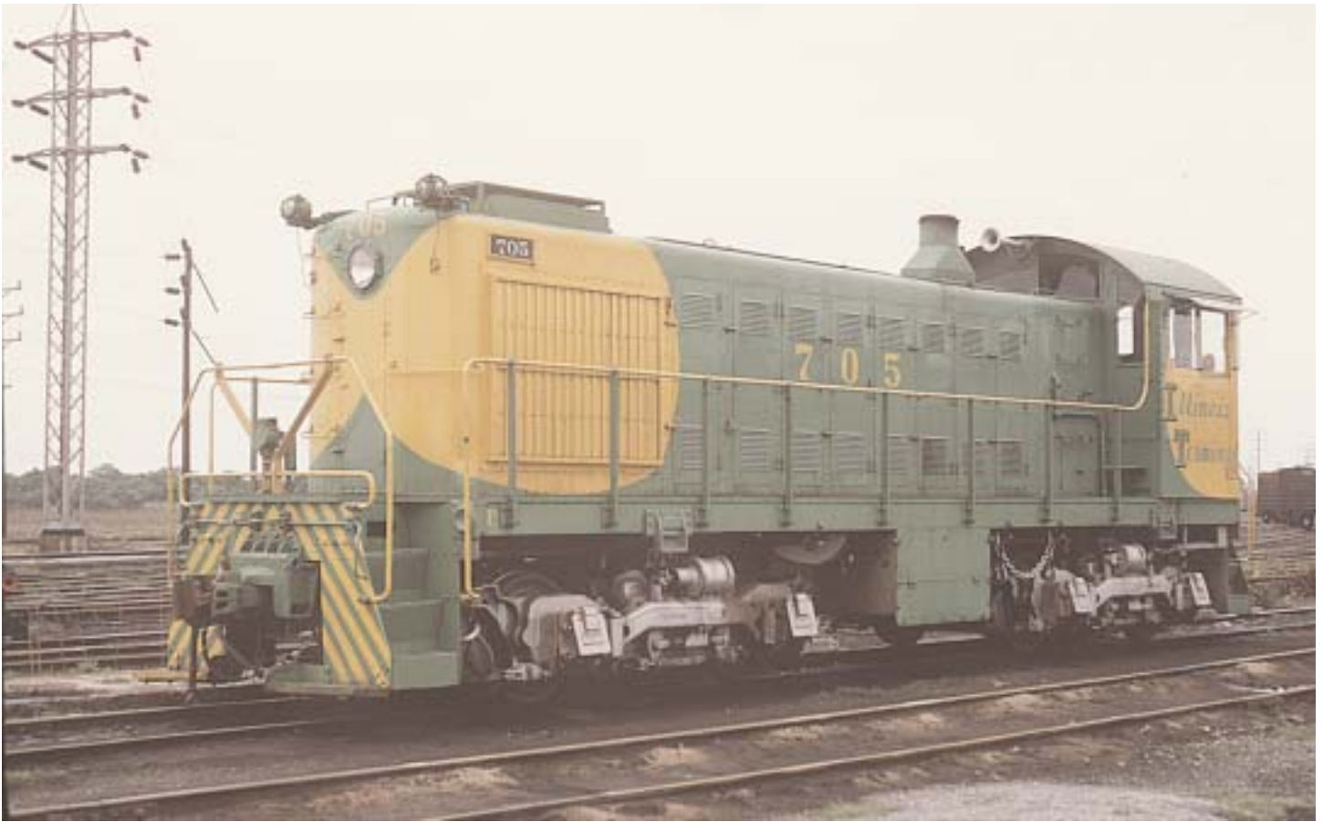
S2 at Federal May 1964, scheme 3