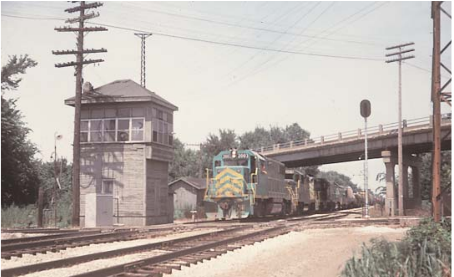
GP38-2 passing Starnes Tower, Springfield, IL