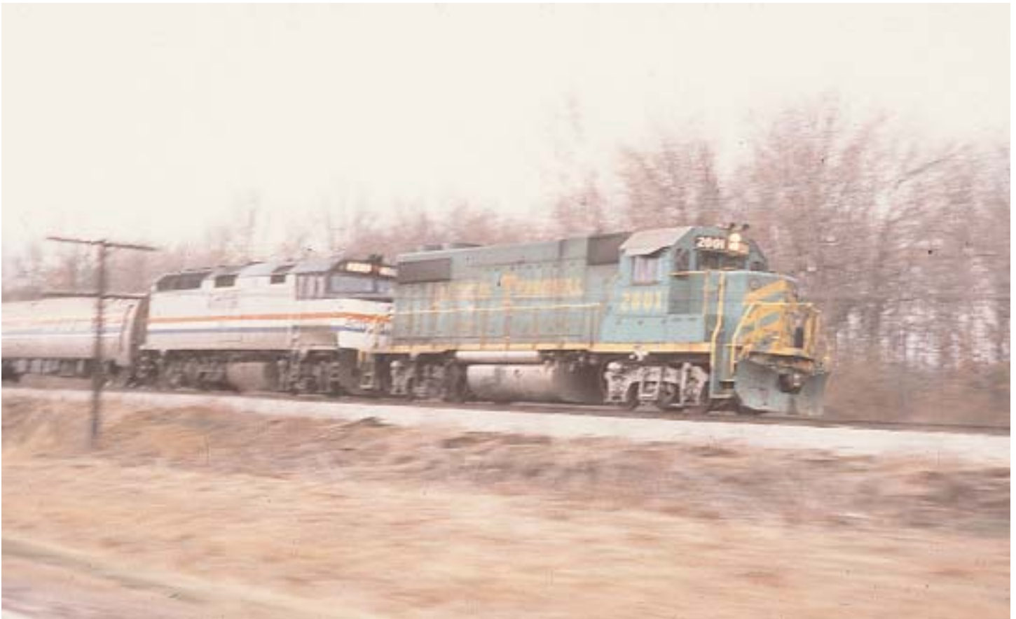
GP38-2 leading Amtrak south of Carlinville in 1981