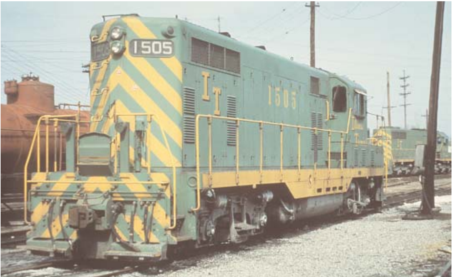
GP7 at East Belt wearing scheme 5