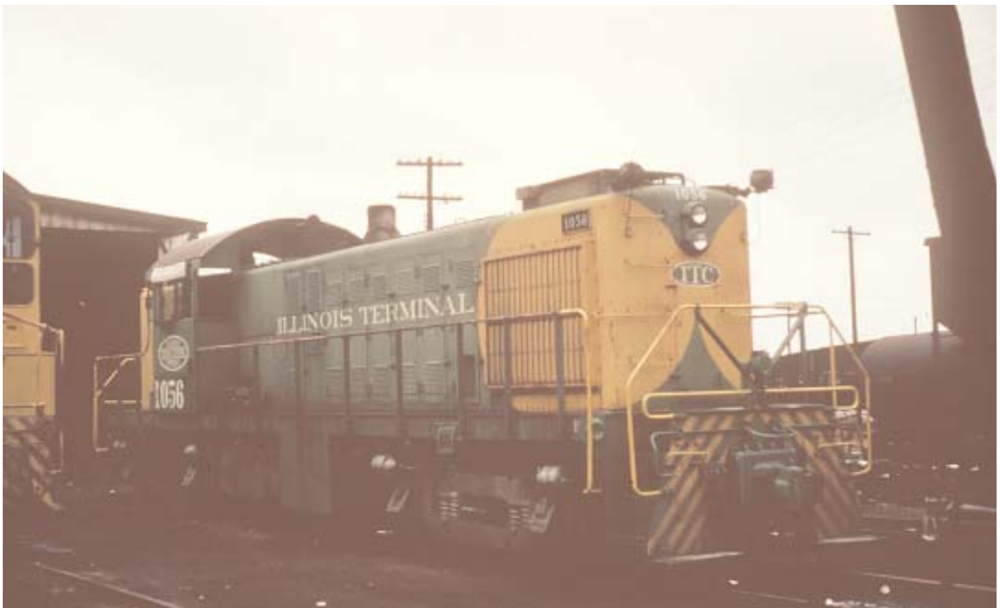
RS1 Springfield, Illinois in November 1967 wearing scheme 2