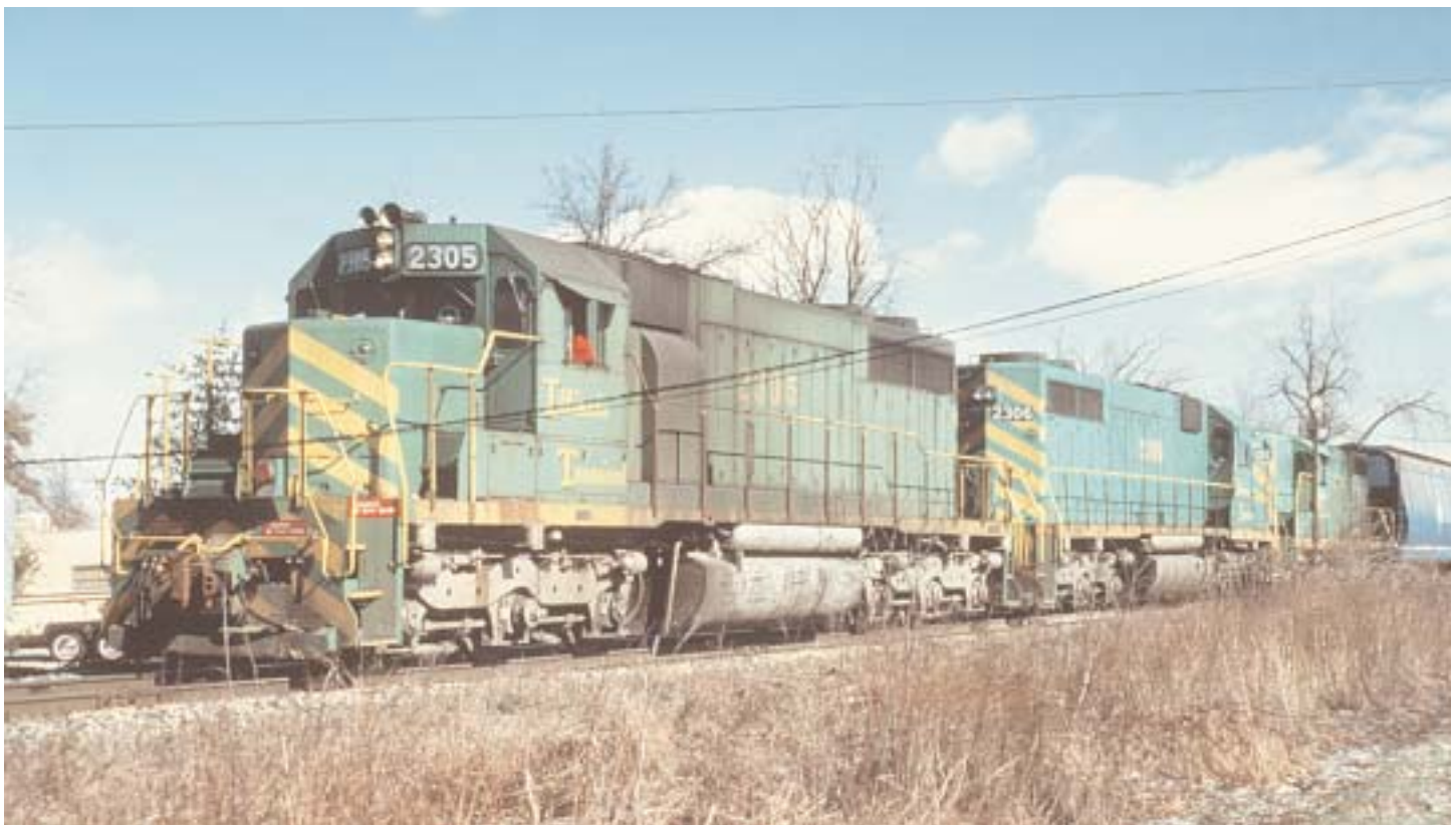
SD39 on GM&O track at Girard