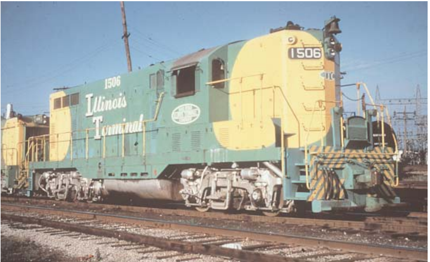
GP7 at Springfield in 1968 wearing scheme 3