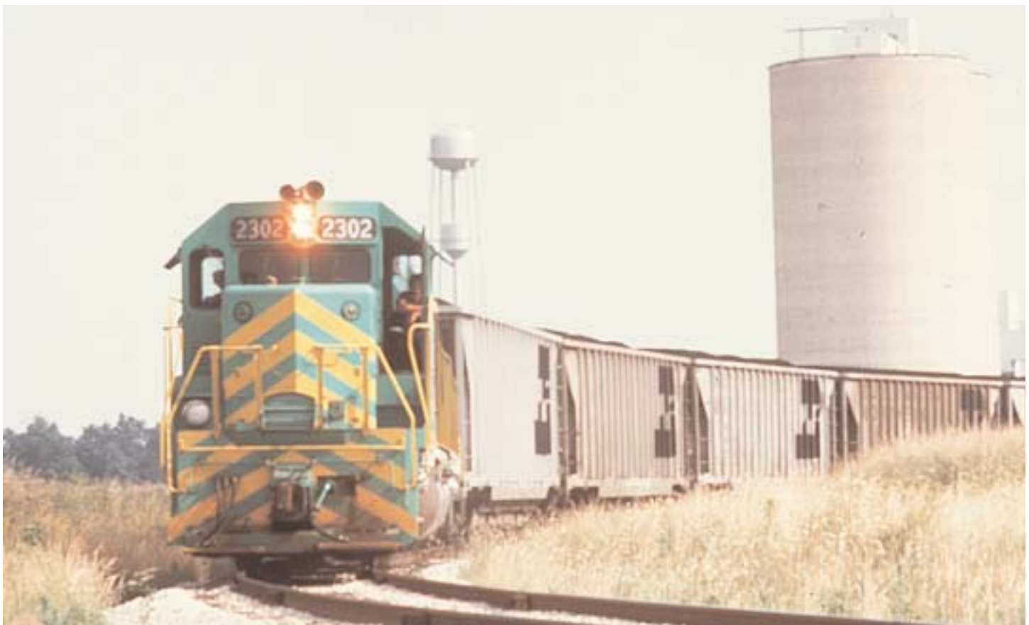
SD39 at Monterey Mine in June 1977