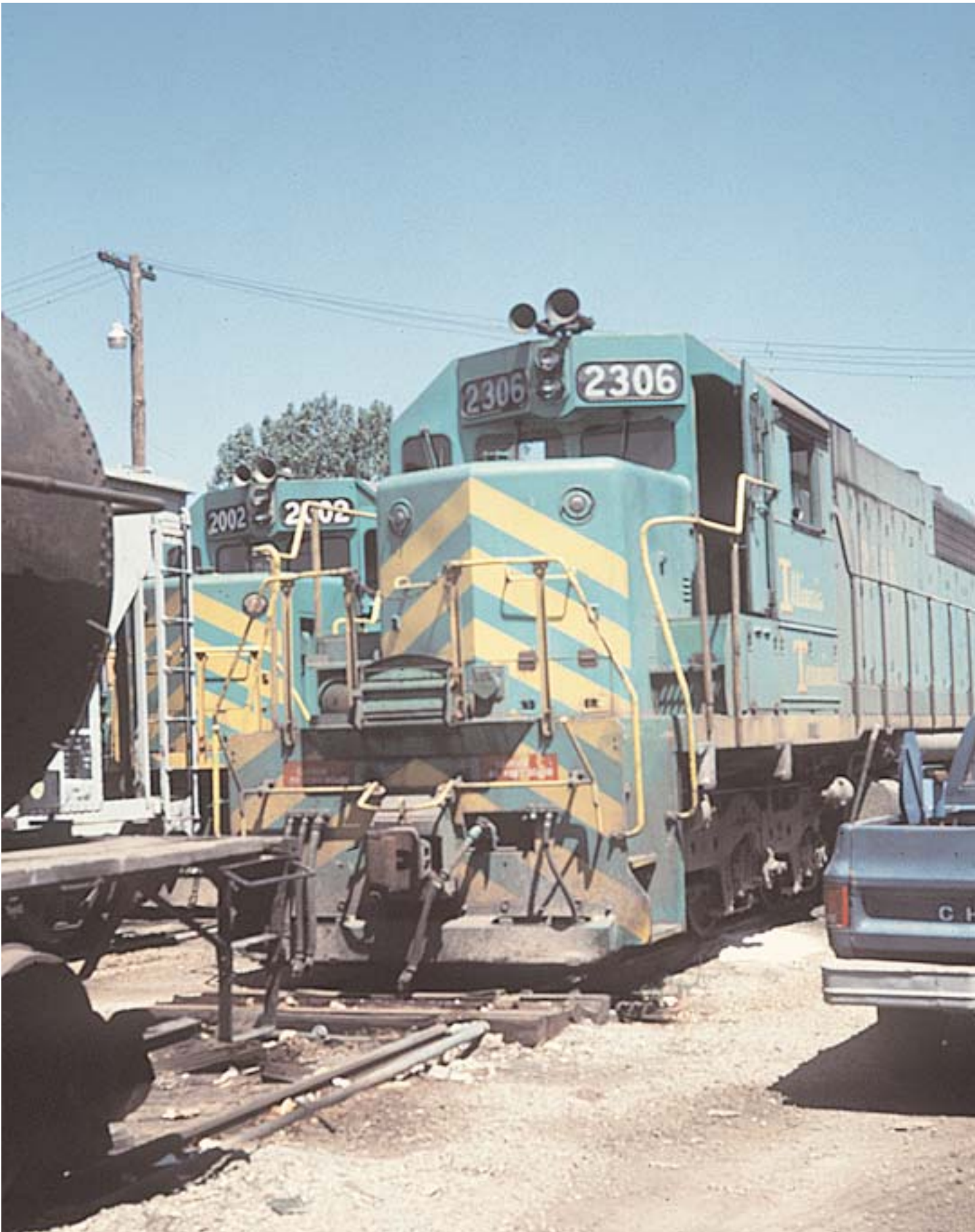
SD39 and GP38-2 number 2002 at Decatur, IL