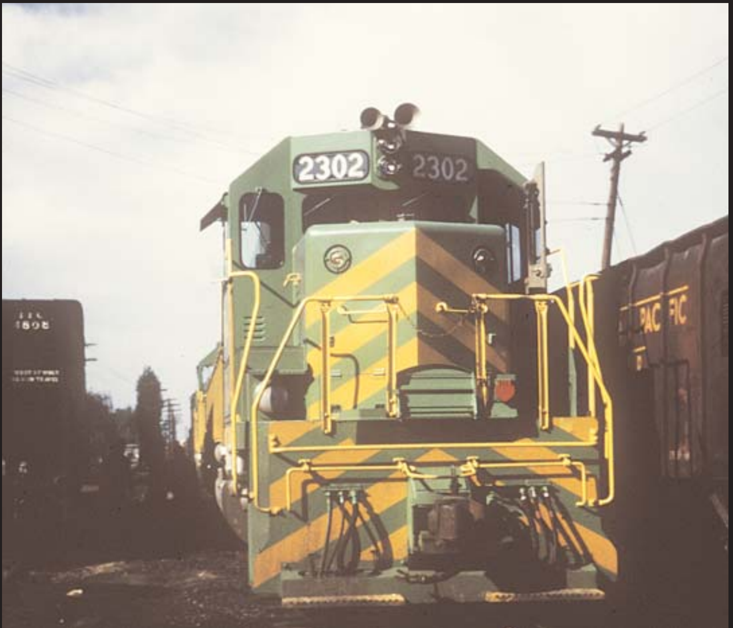
SD39 at East Belt yard, Springfield, IL