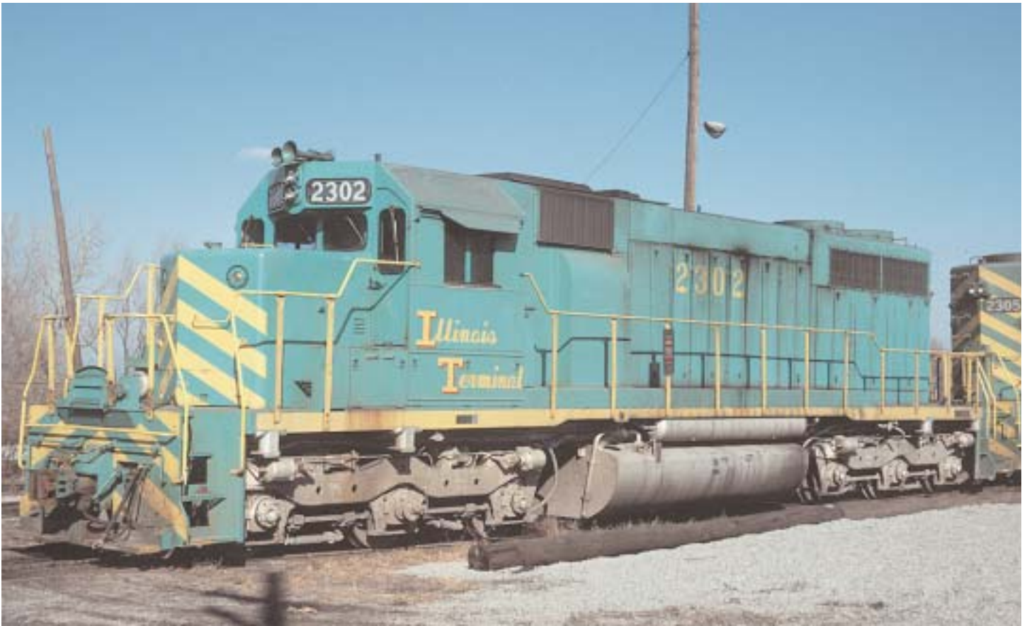
SD39 at Madison in October 1979