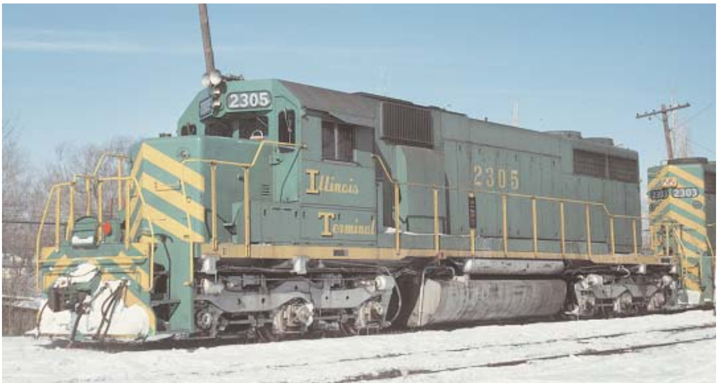
SD39 in Madison in January 1977