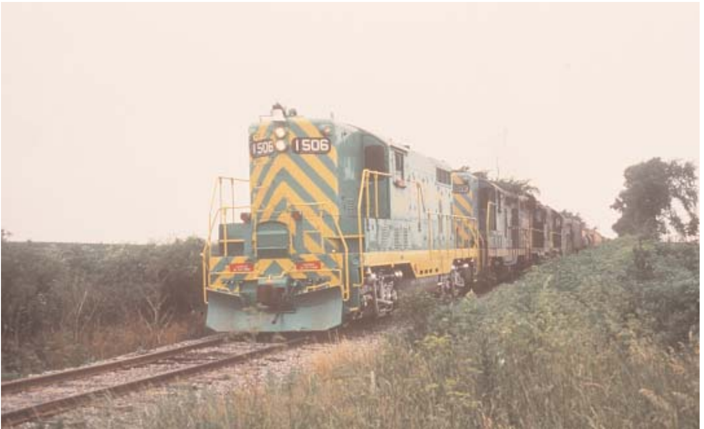
GP7 at Talewell wearing scheme 6