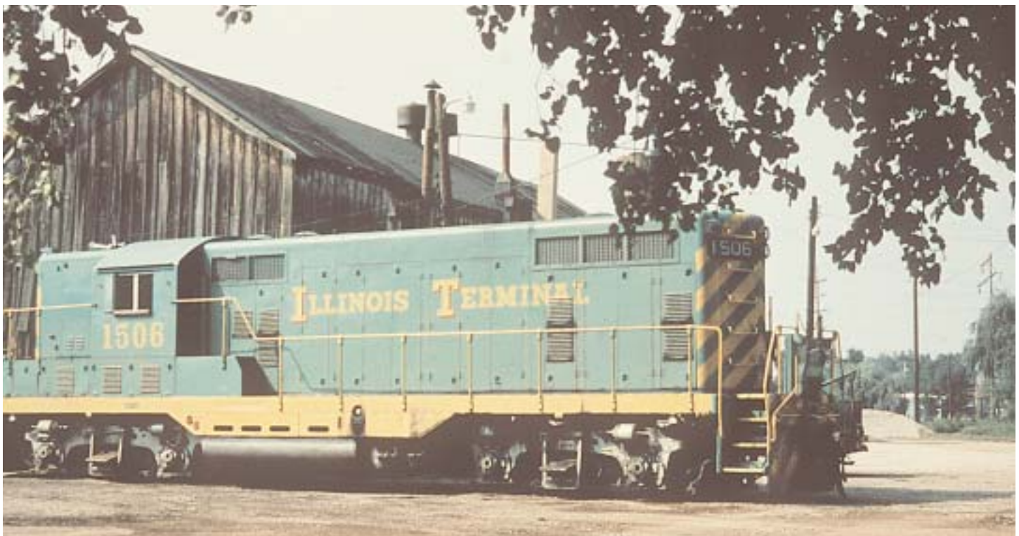
GP7 at East Belt Barn between 1980 and 1981 wearing scheme 6