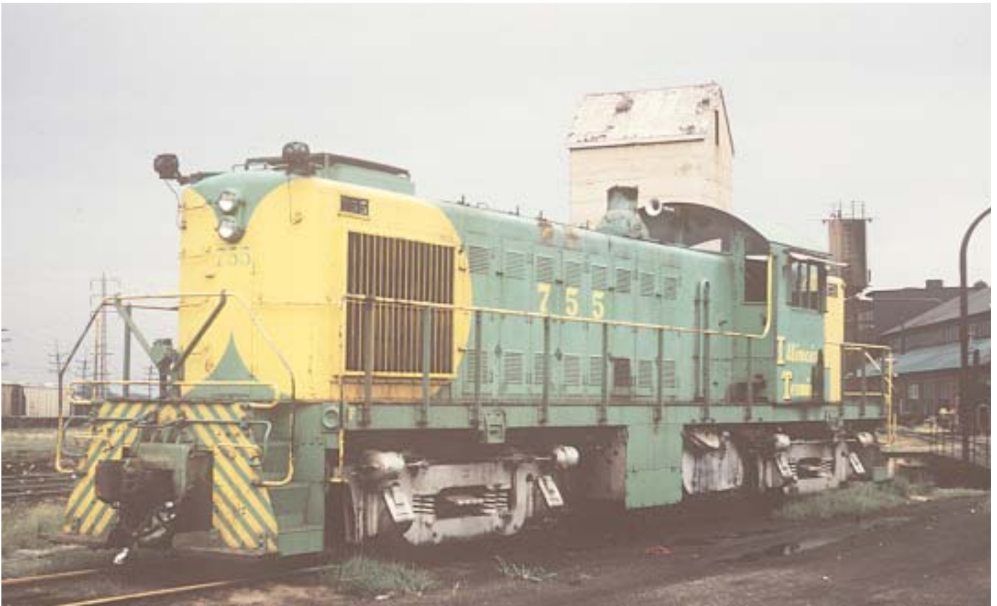
RS1 at Federal wearing scheme 4 in July 1966