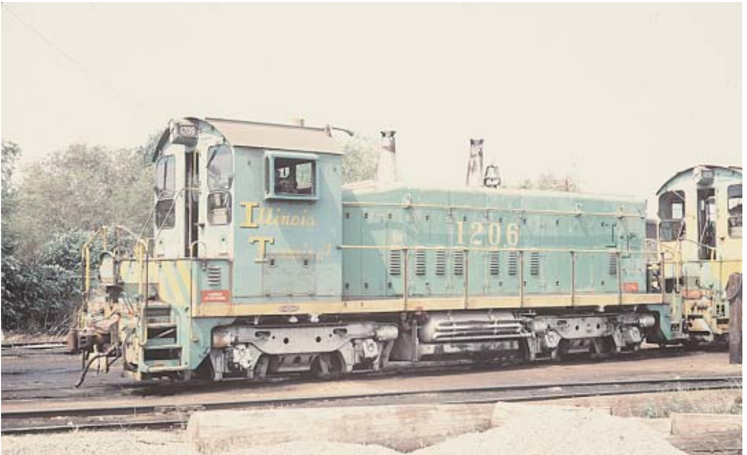
SW1200 at Lang, Madison, IL wearing scheme 5