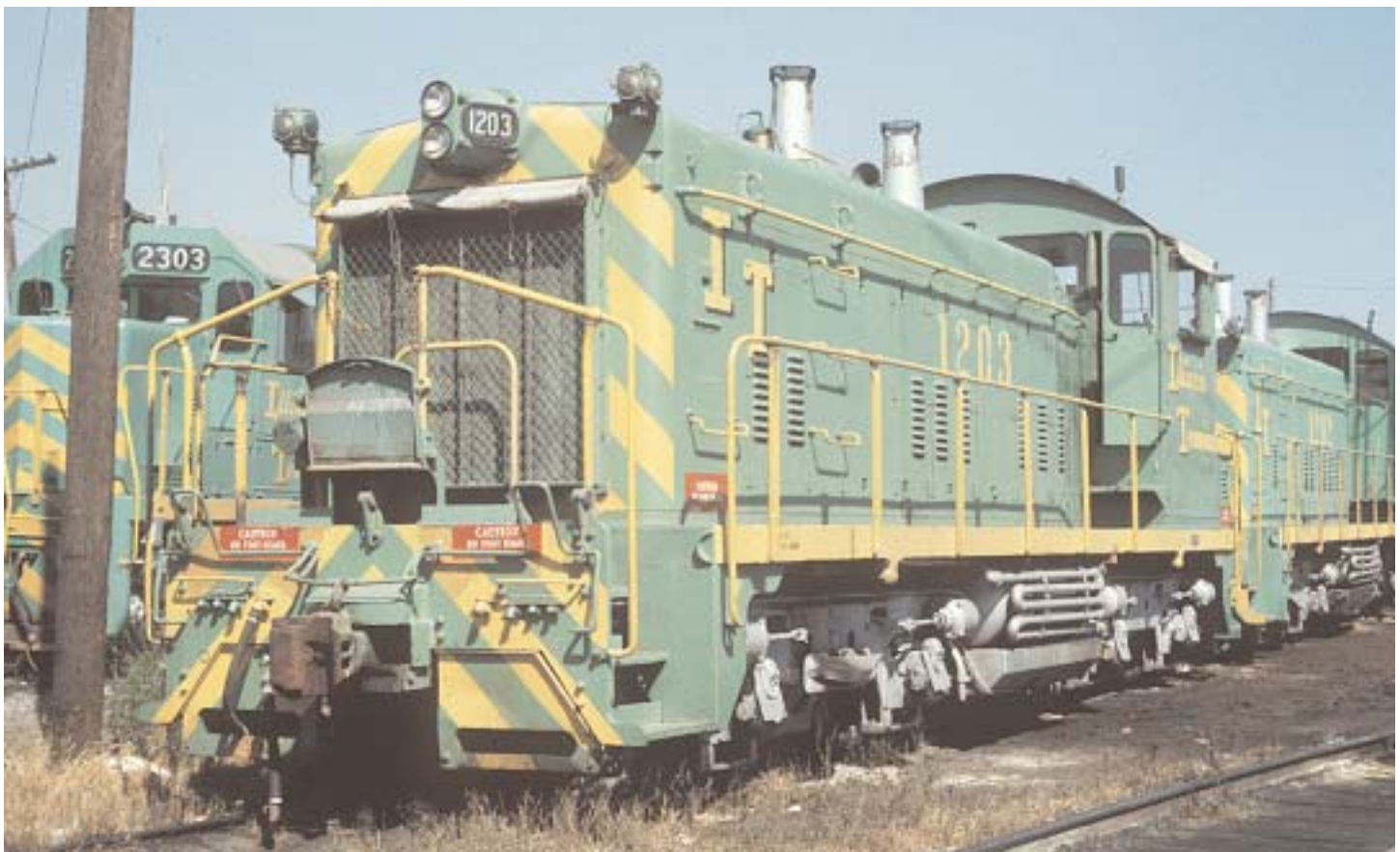
SW1200 at Madison in October 1976 wearing scheme 5