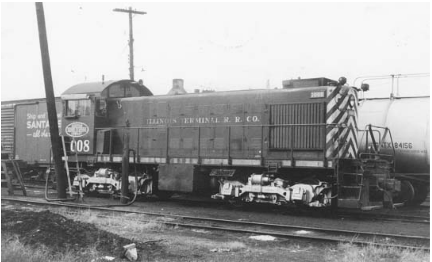
S2 at East Belt in September 1969 wearing scheme 1