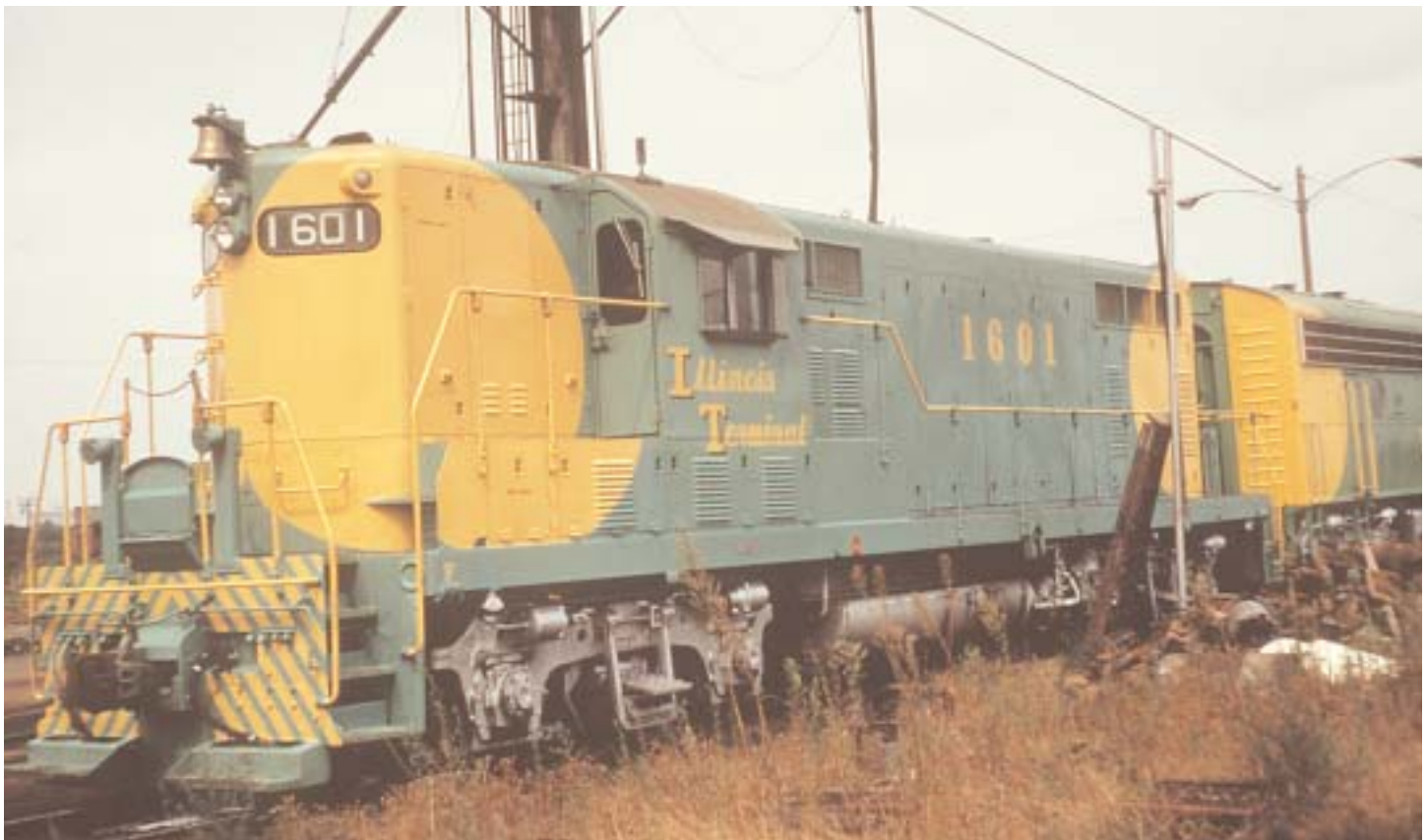
GP7 at Lang, Madison, IL in 1967 wearing scheme 4