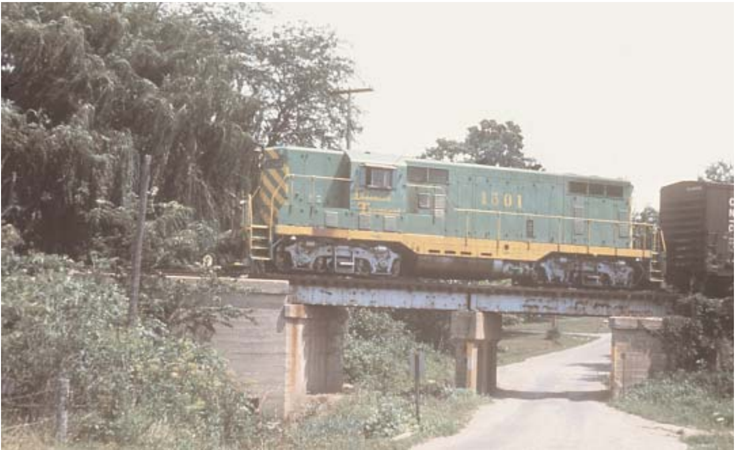
GP7 on ICRR south of Monticello in 1977 wearing scheme 5