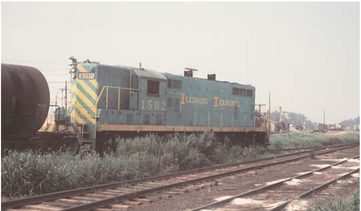
GP7 on C&M connection north of Springfield wearing scheme 6