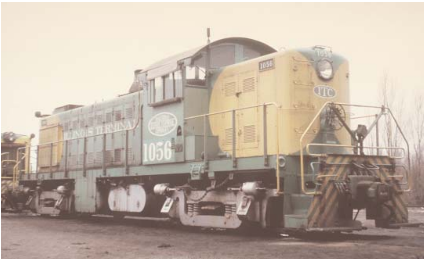
RS1 at Madison in April 1968 wearing scheme 2