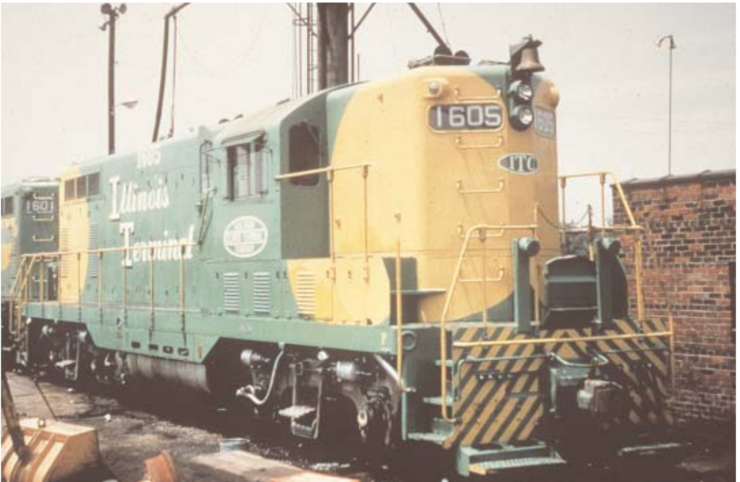
GP7 at Madison in 1965 wearing scheme 3