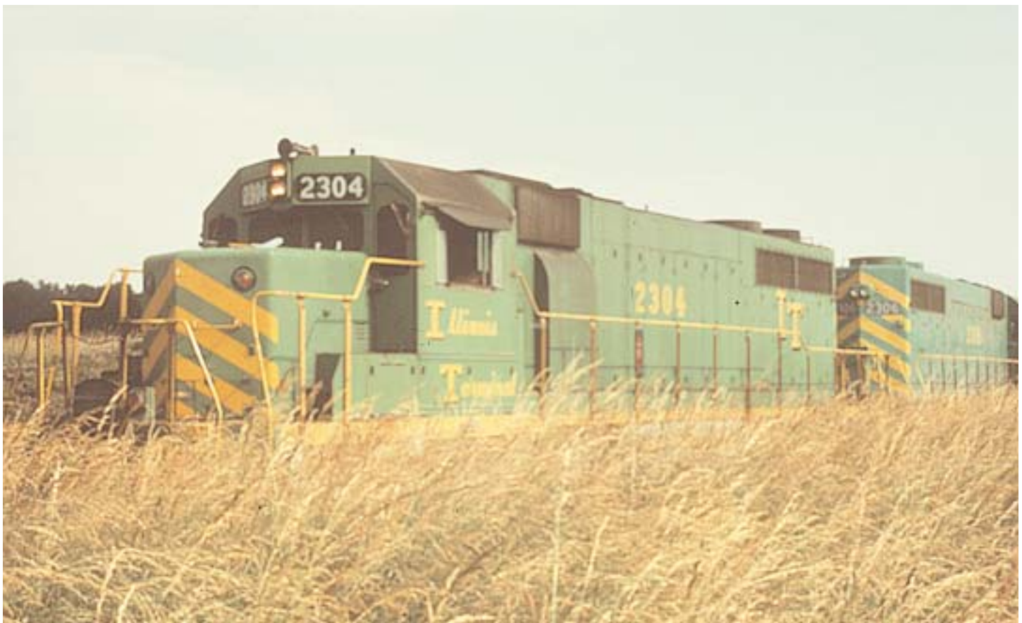
SD39 near Loveless, 1977