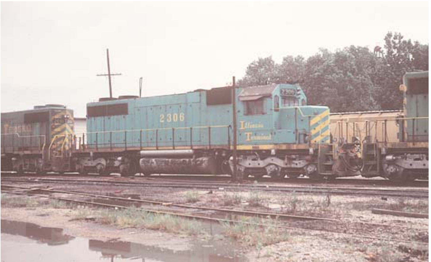
SD39 number 2306 Decatur, IL