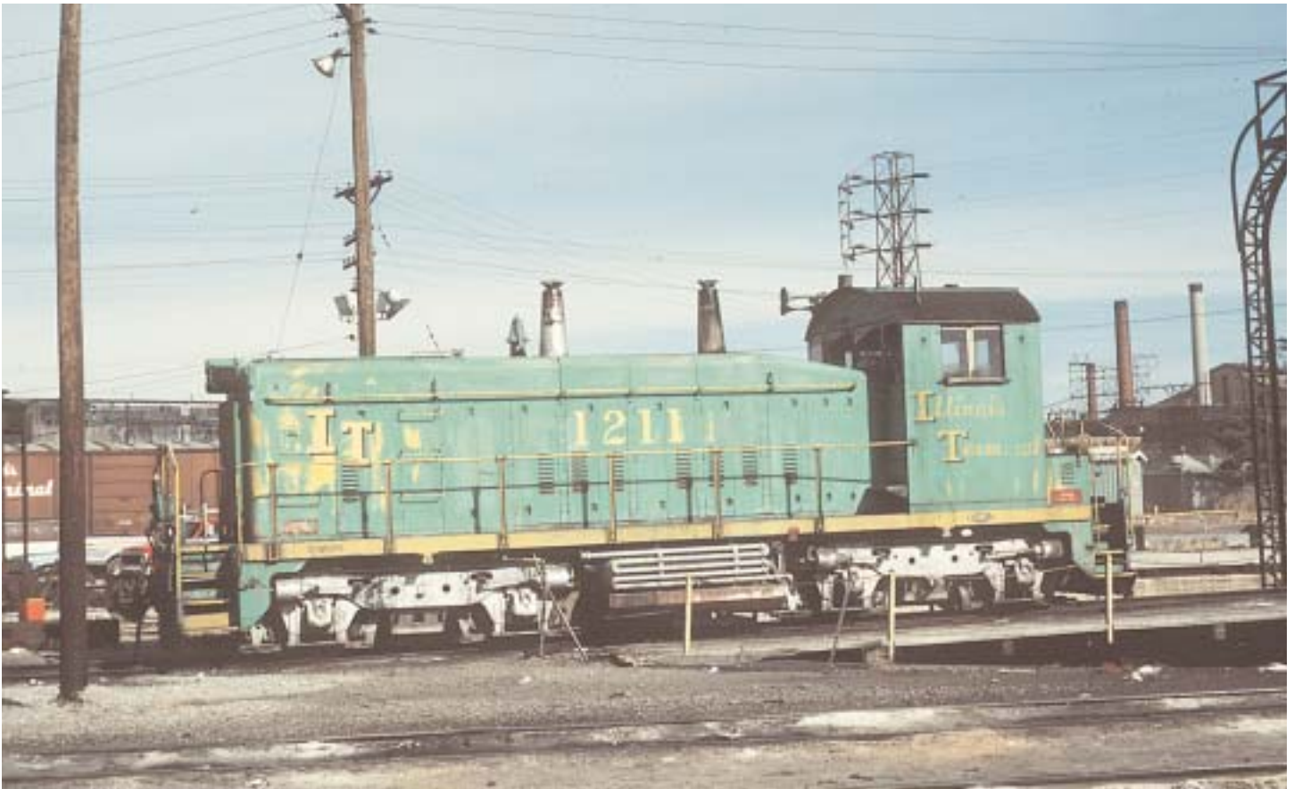
SW1200 at Federal in 1982, scheme 5