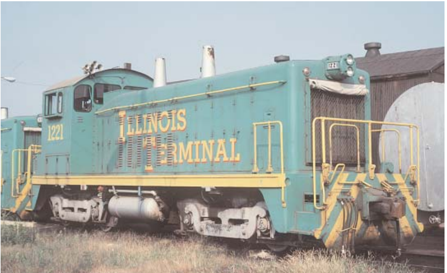
Leased unit SW1200 at Madison in August 1981