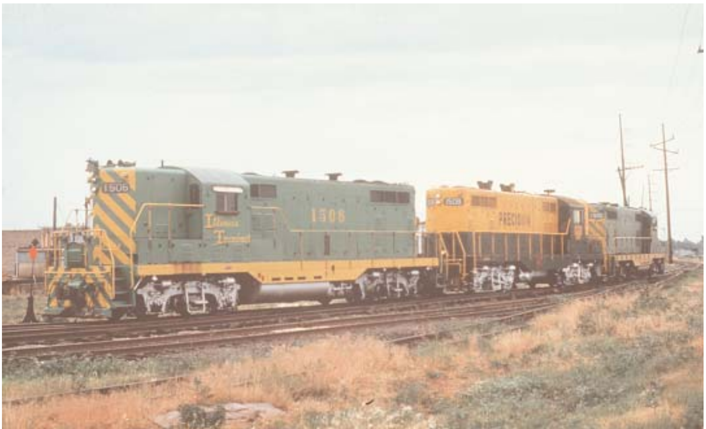
GP7 at Decatur wearing scheme 5 between 1970 and 1980