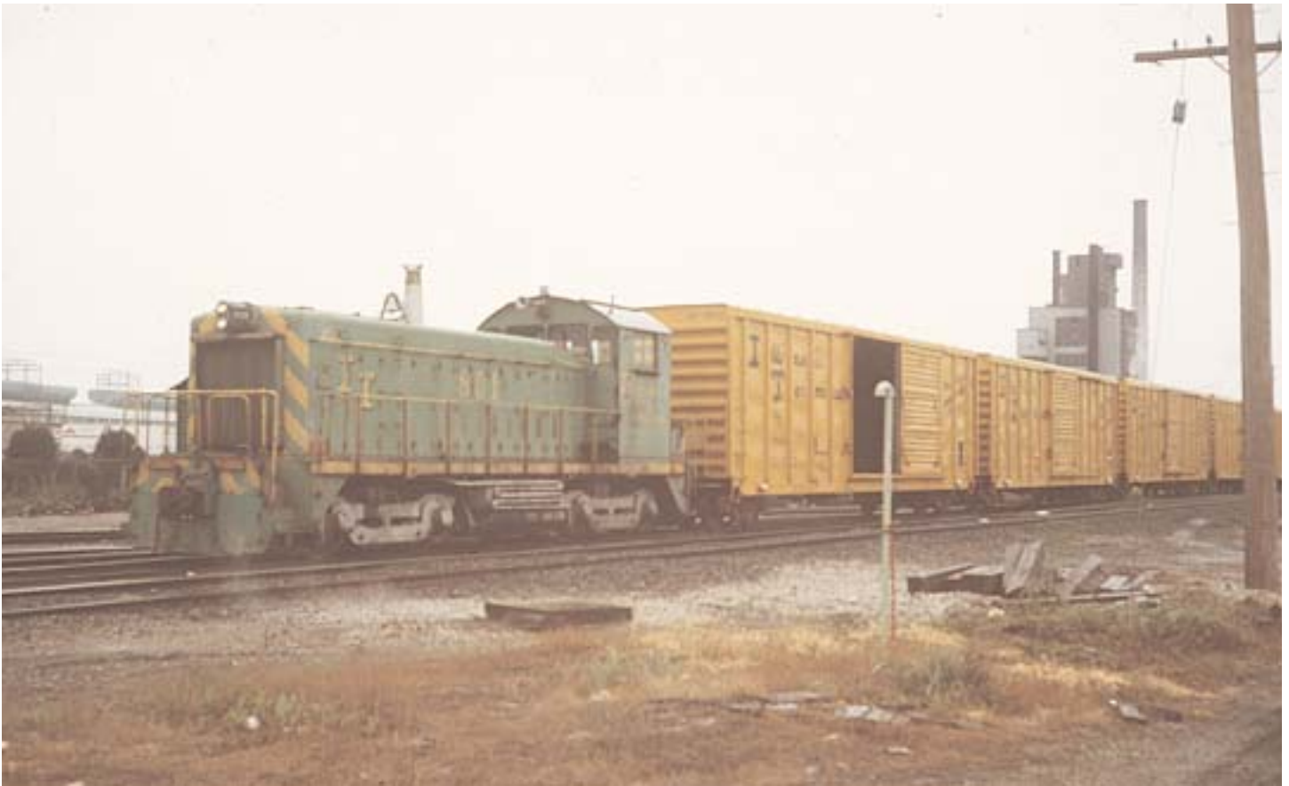
SW800 at Federal in 1973 wearing scheme 3