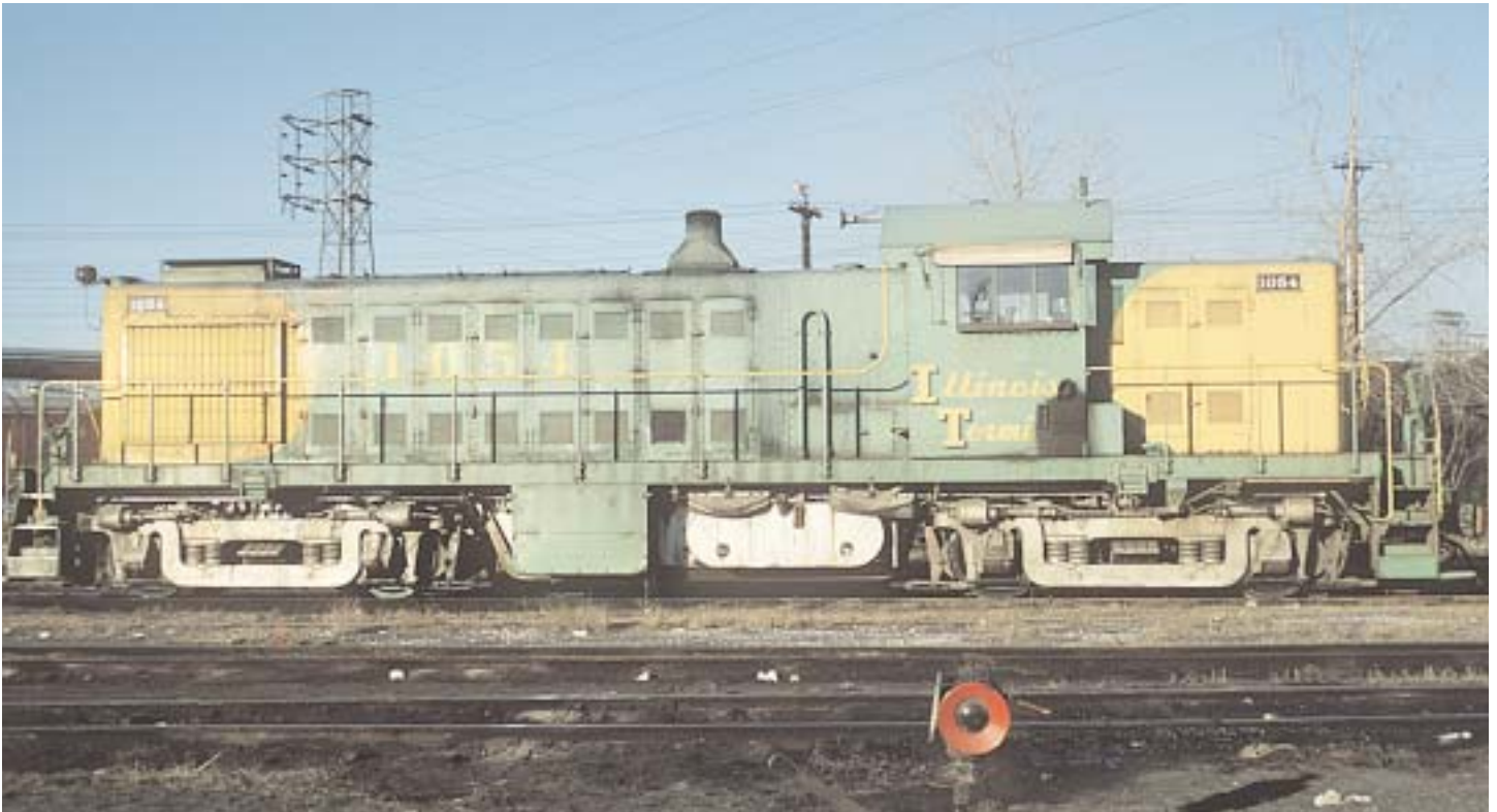
RS1 at Springfield in March 1970 wearing scheme 4