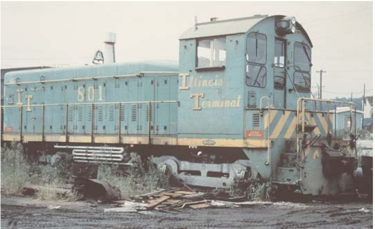
SW800 in scheme 3 at Federal