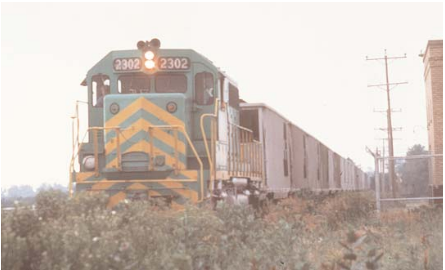
SD39 with Unit Coal at Loveless in 1977