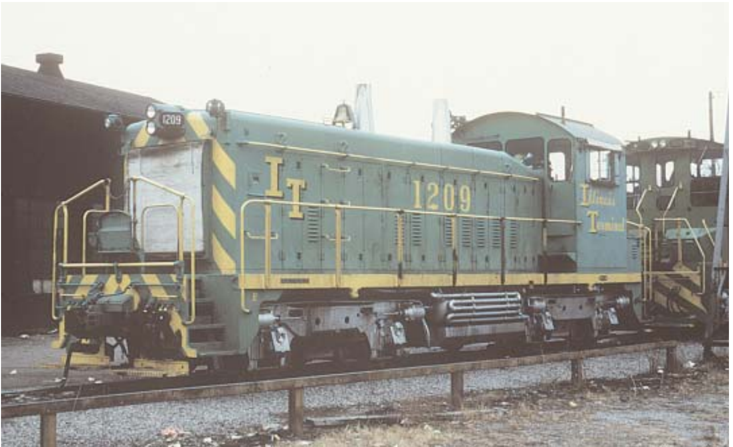
SW1200 at Lang, Madison, IL, scheme 5