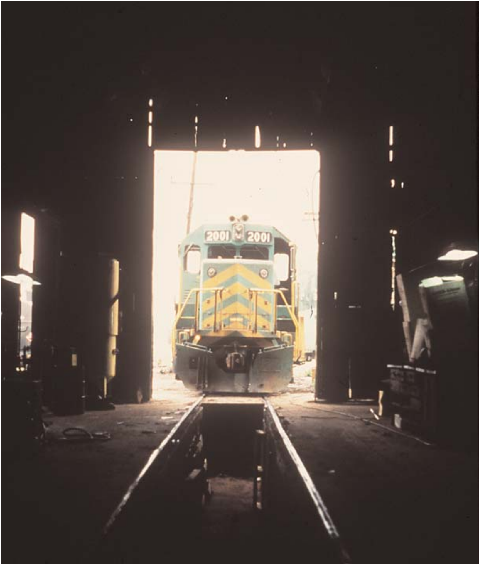
GP38-2 at East Belt Barn in 1980