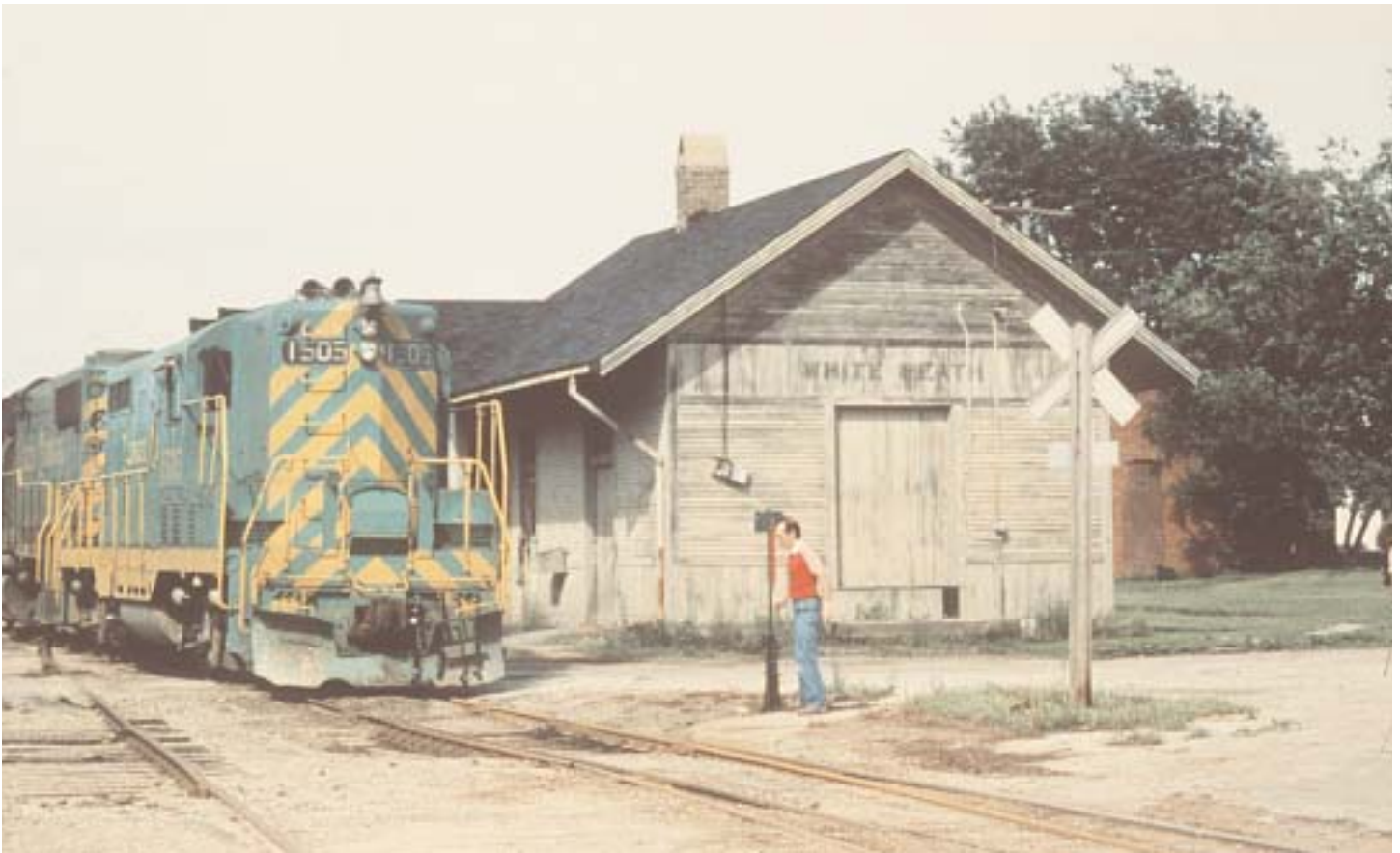
GP7 at White Heath between 1971 and 1979 wearing scheme 5