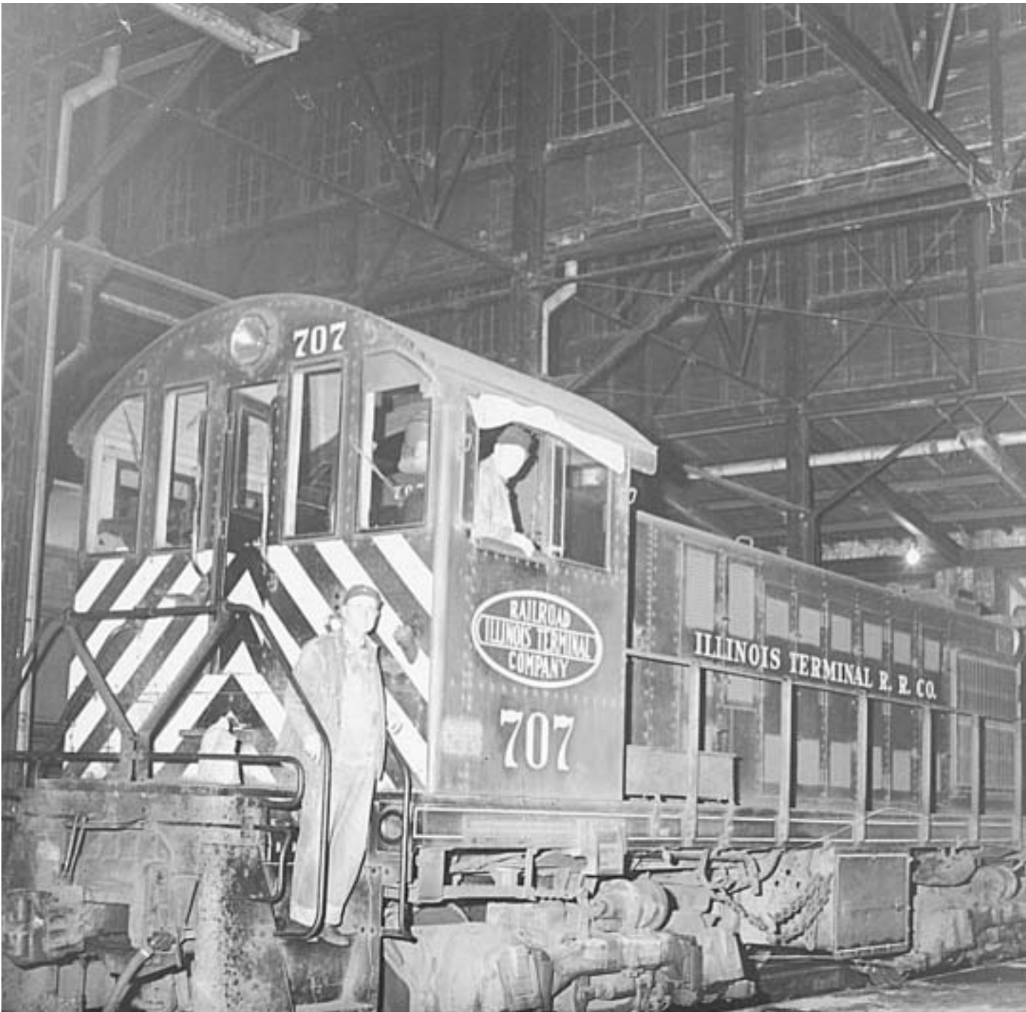
S2 at Decatur Shops in the 1950s, scheme 1