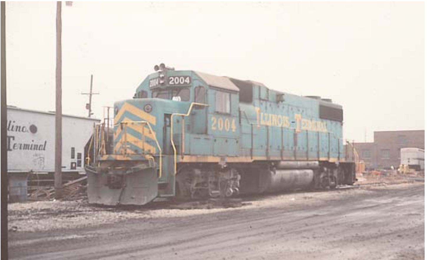
GP38-2 at Decatur