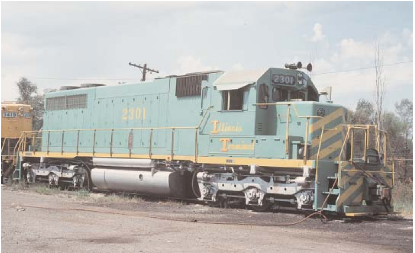
SD39 number 2301 at Madison in August 1978