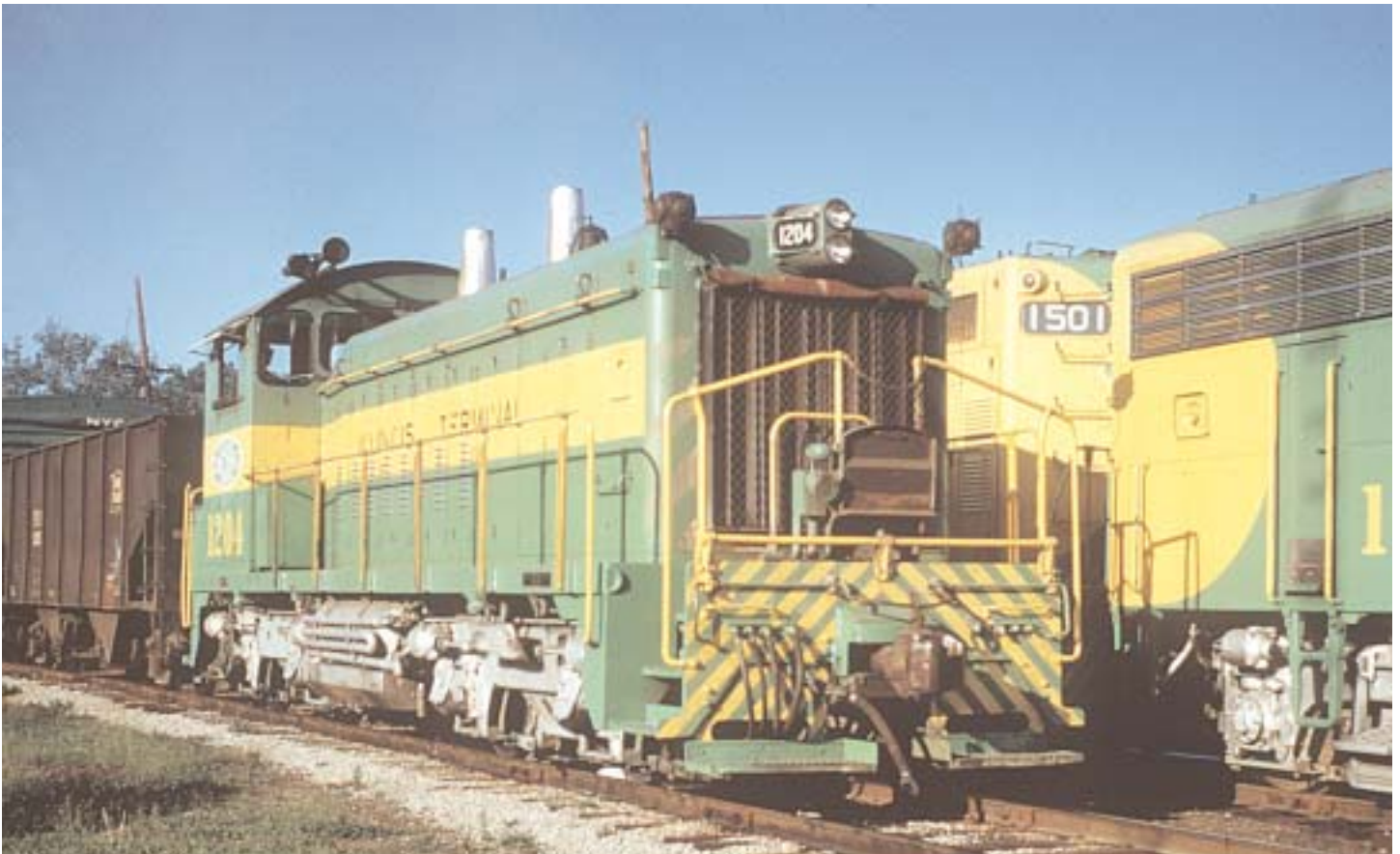
SW1200 at East Belt, Springfield, IL in 1968