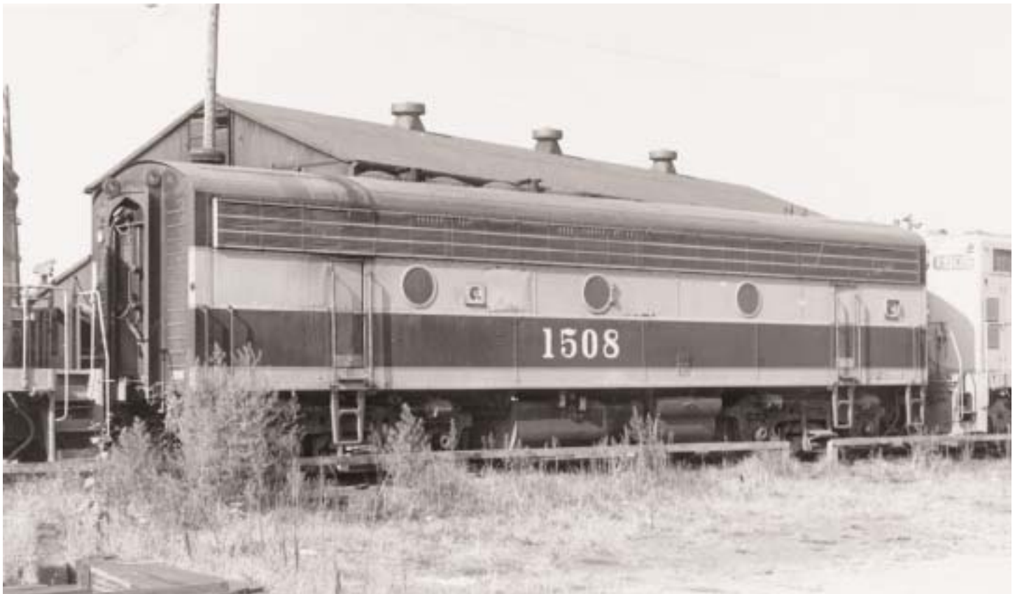
F7B number 1508 at Madison in August 1967