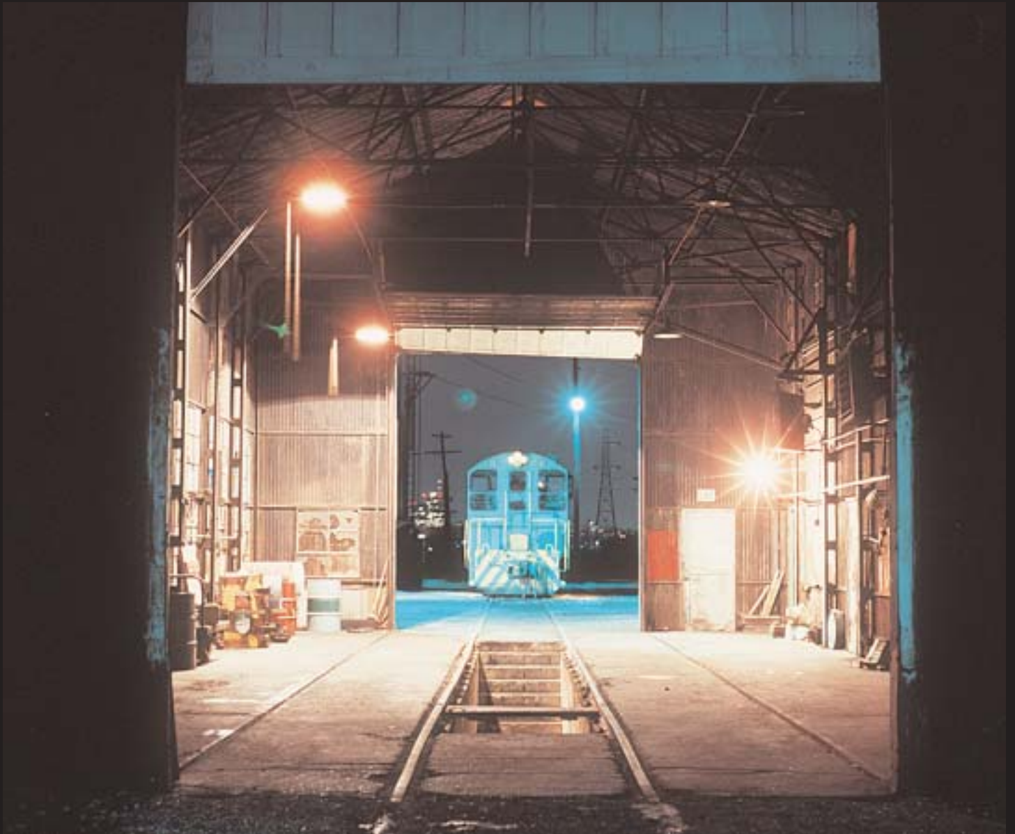
Leased unit SW1200 number 1222 at Madison in January 1982