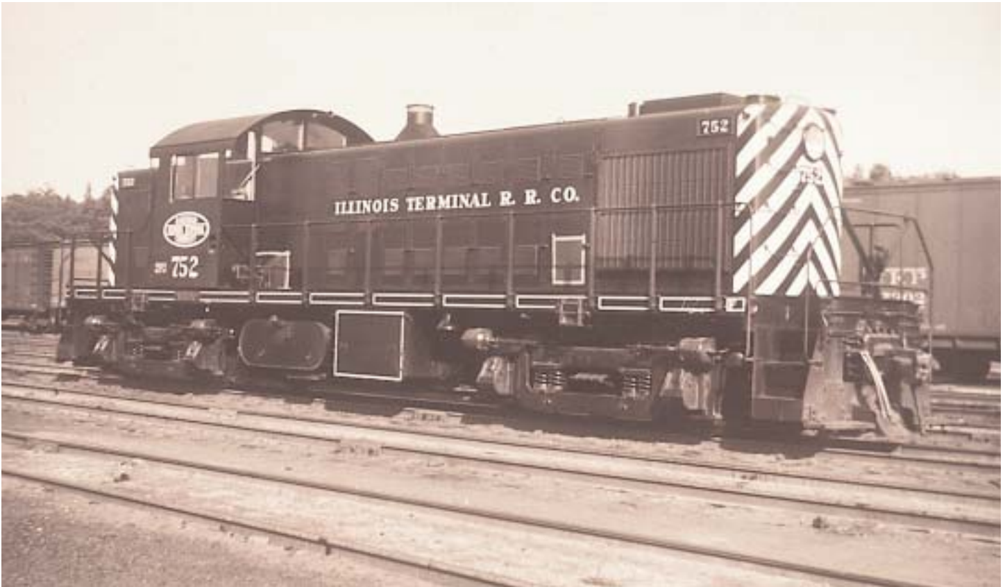
RS1 in P&PU yard, E. Peoria in scheme 1 Previous page: Short hood of RS1 number 756 at Madison.