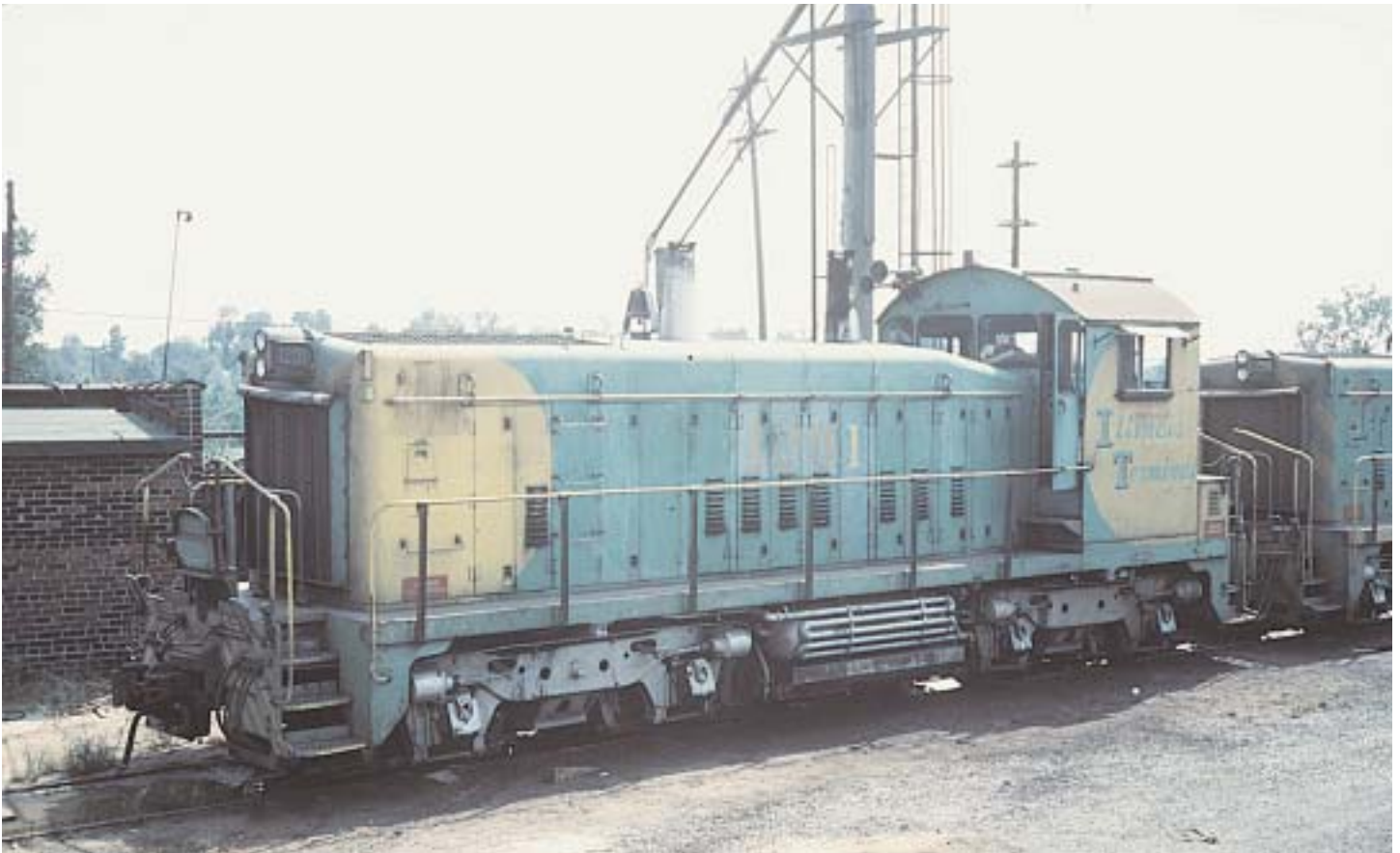
SW1200 at Lang, Madison, IL wearing scheme 4