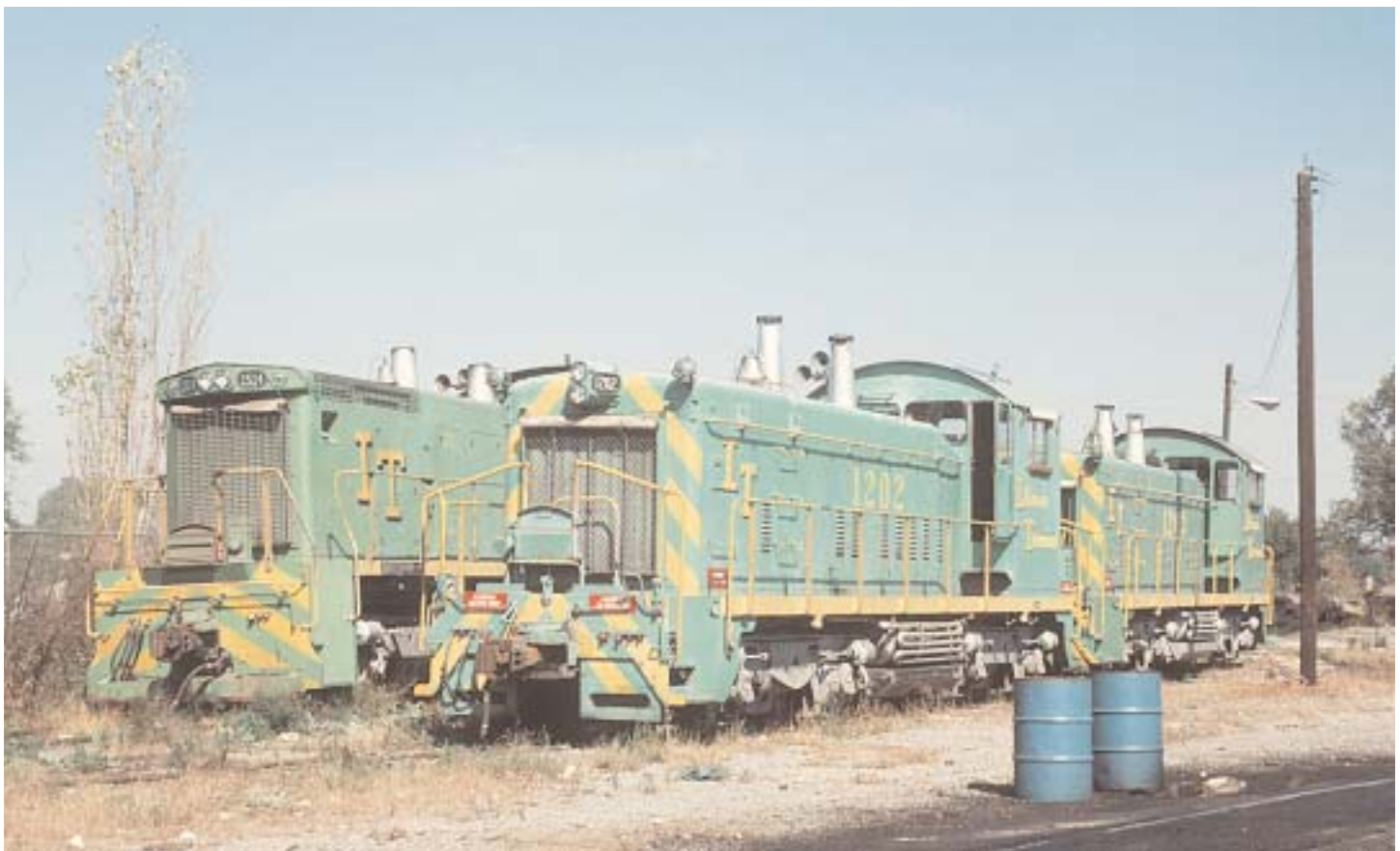
SW1200 at Madison in October 1976 wearing scheme 5