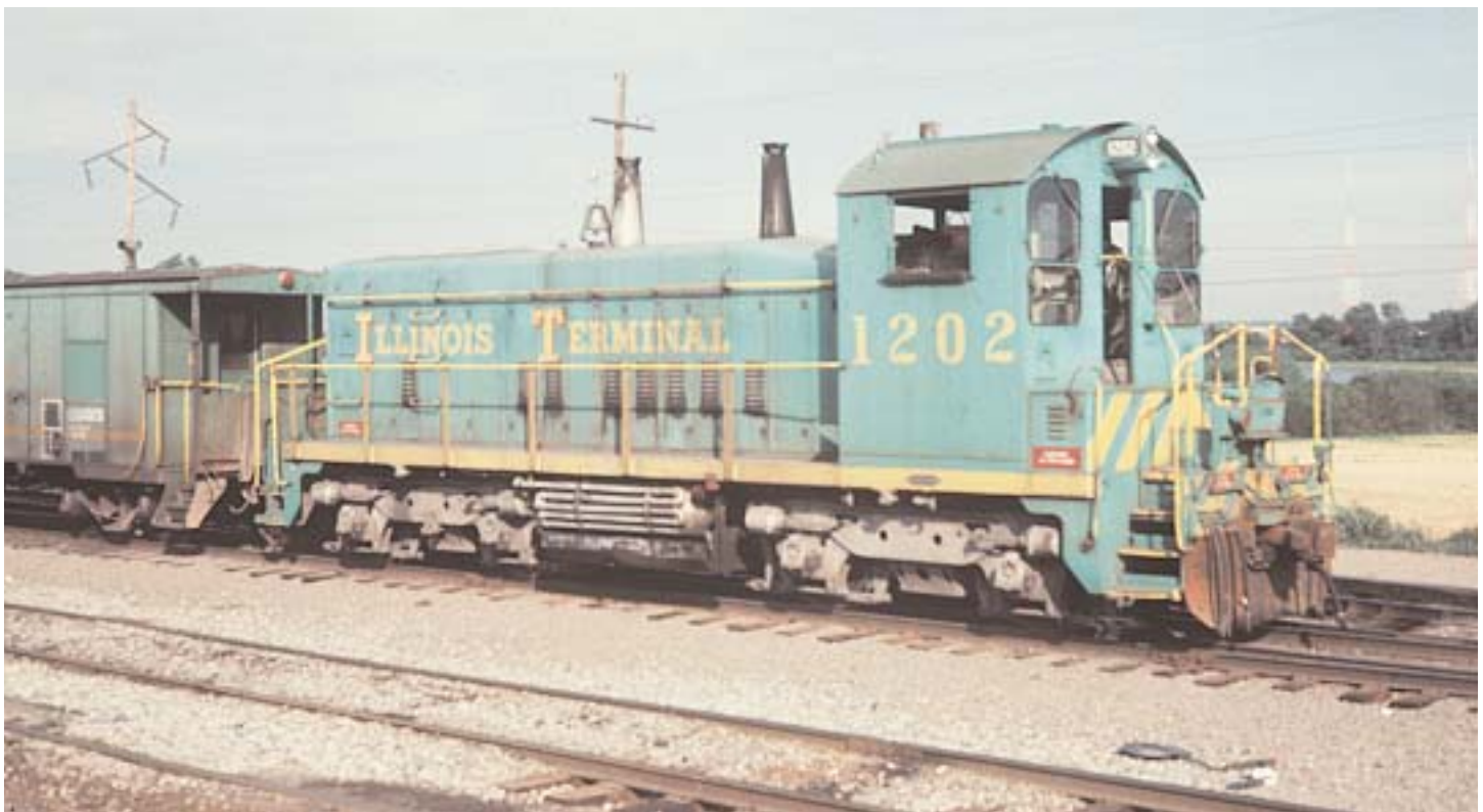
SW1200 at Madison wearing scheme 6