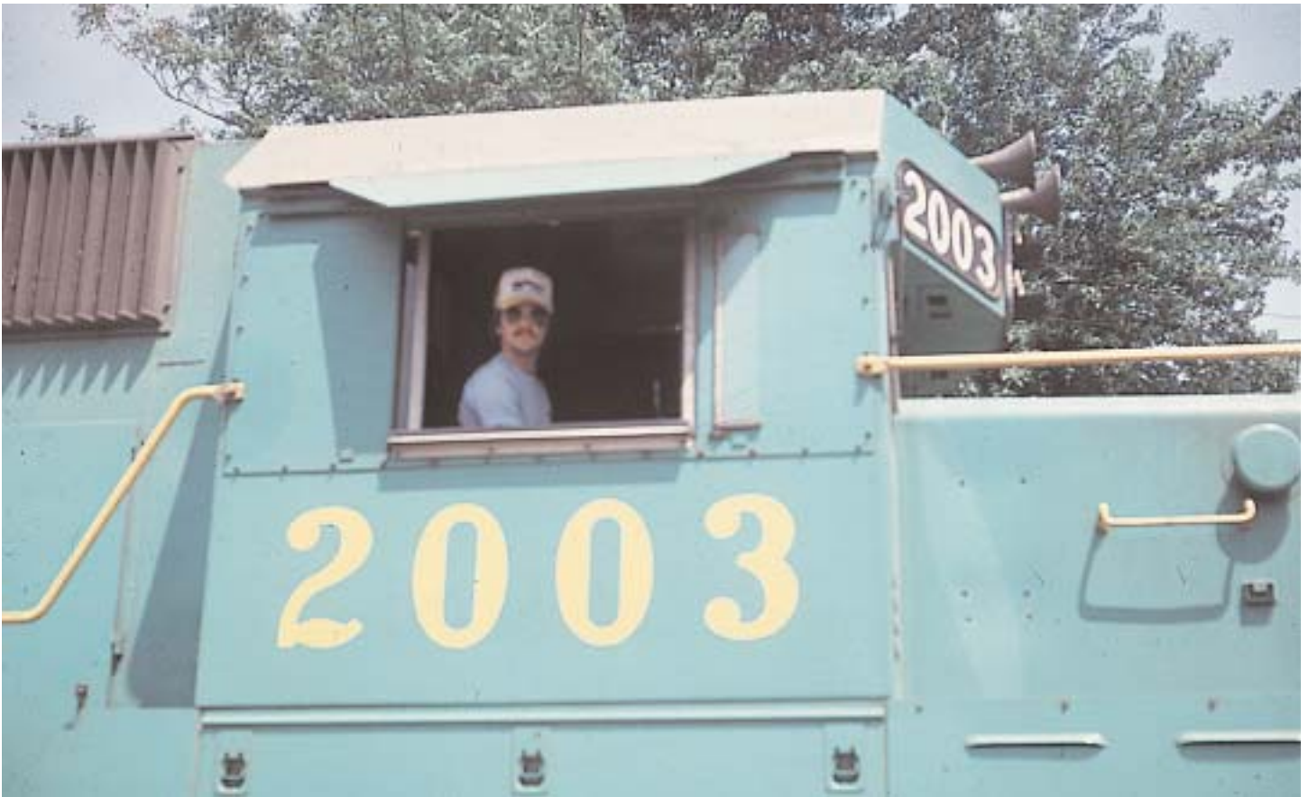
GP38-2 cab detail