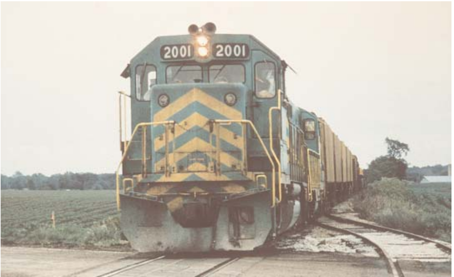
GP38-2 at Lodge