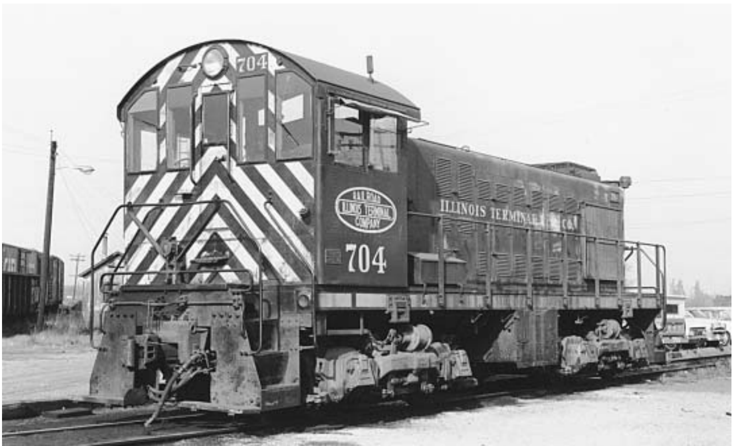
S2 at Madison in July 1965 wearing scheme 1