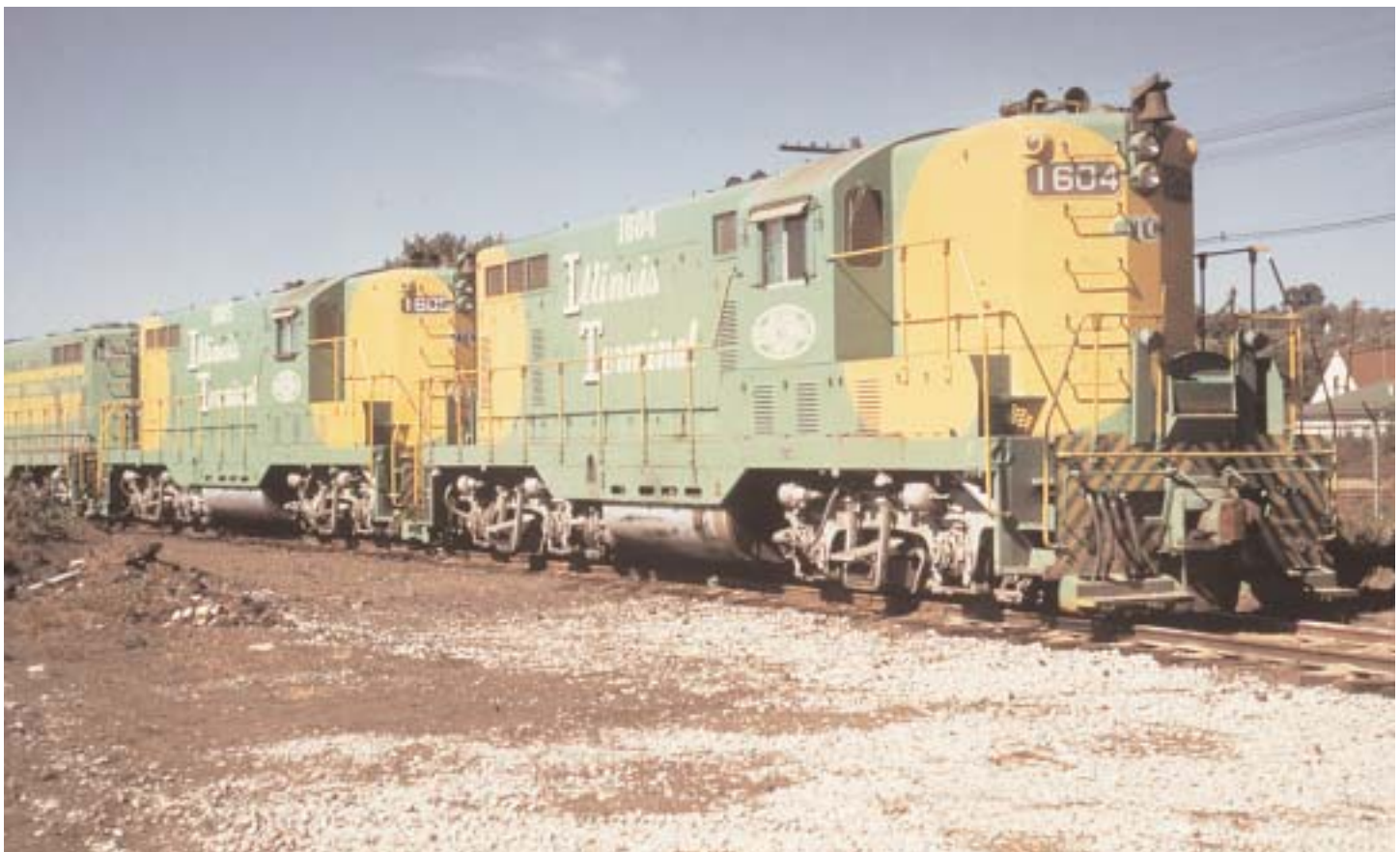
GP7 before 1971 wearing scheme 3 at E. Peoria