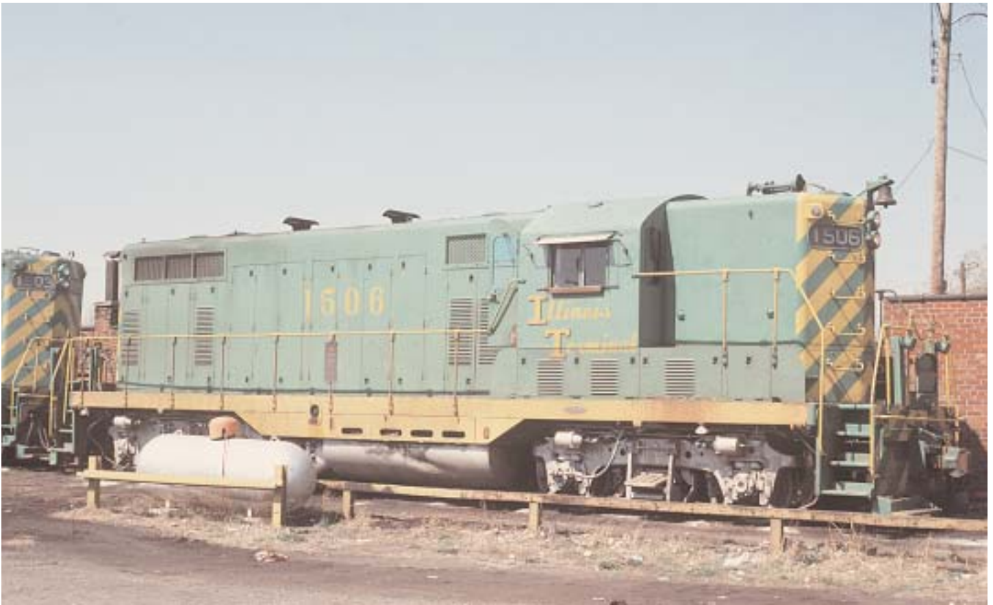
GP7 at Madison wearing scheme 5 in April 1977