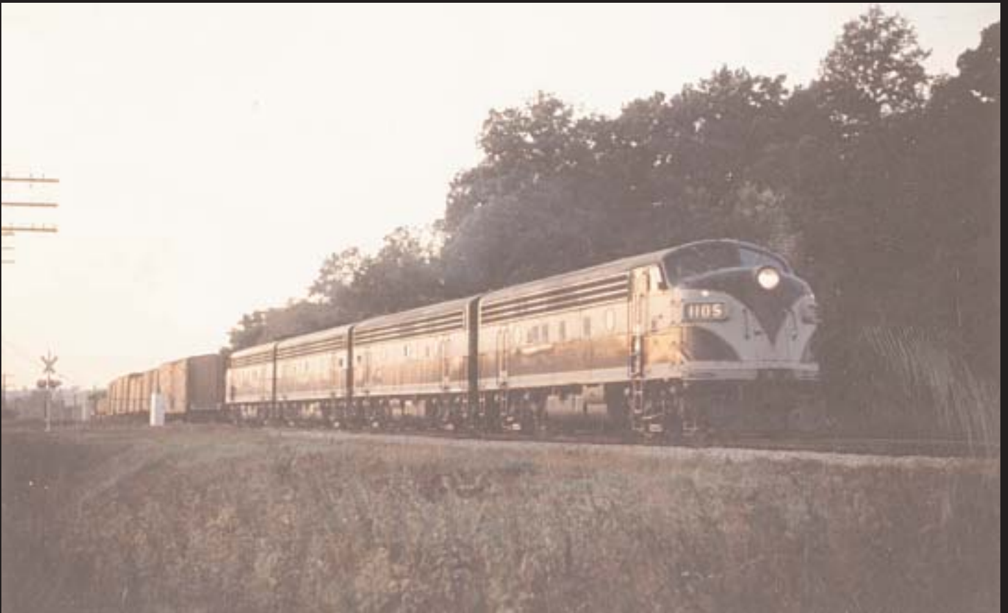
F7ABBA lead by number 201 at Farmdale, IL in 1966