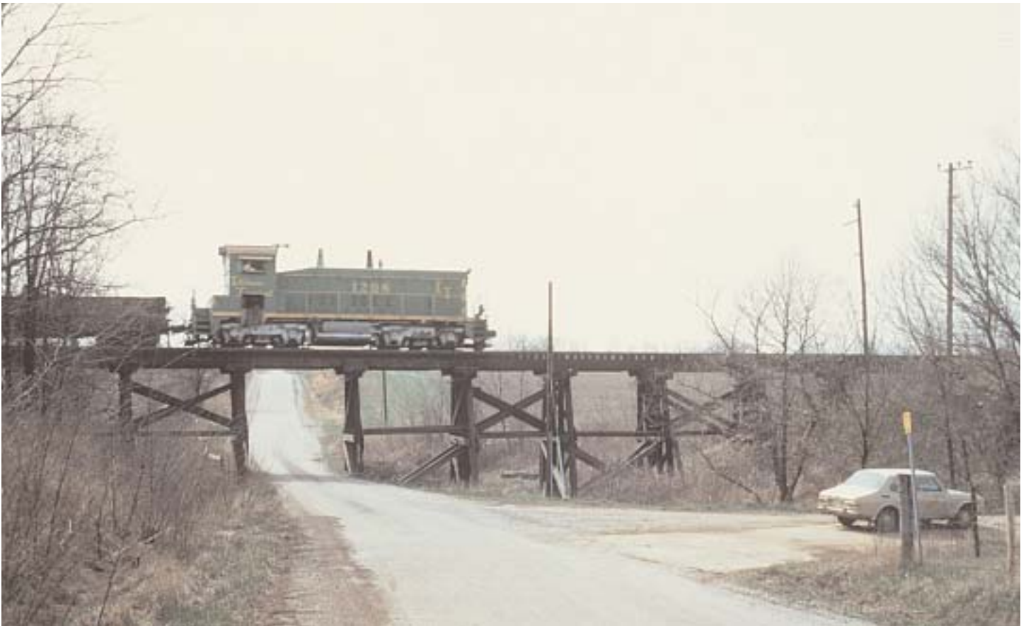
SW1200 at Honey Bend in 1979 wearing scheme 5