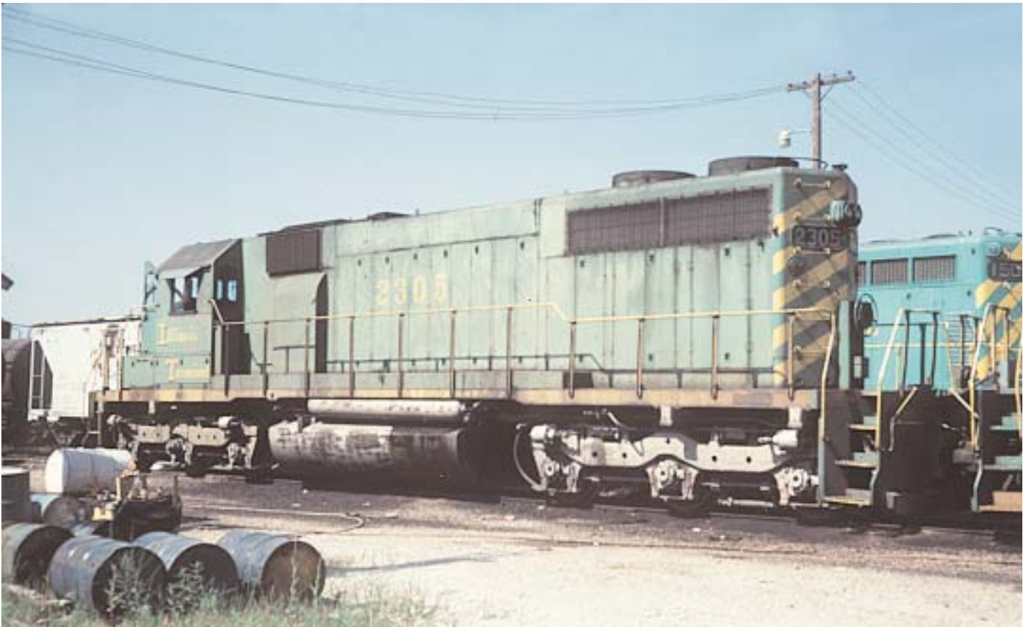
SD39 and GP7 at Decatur