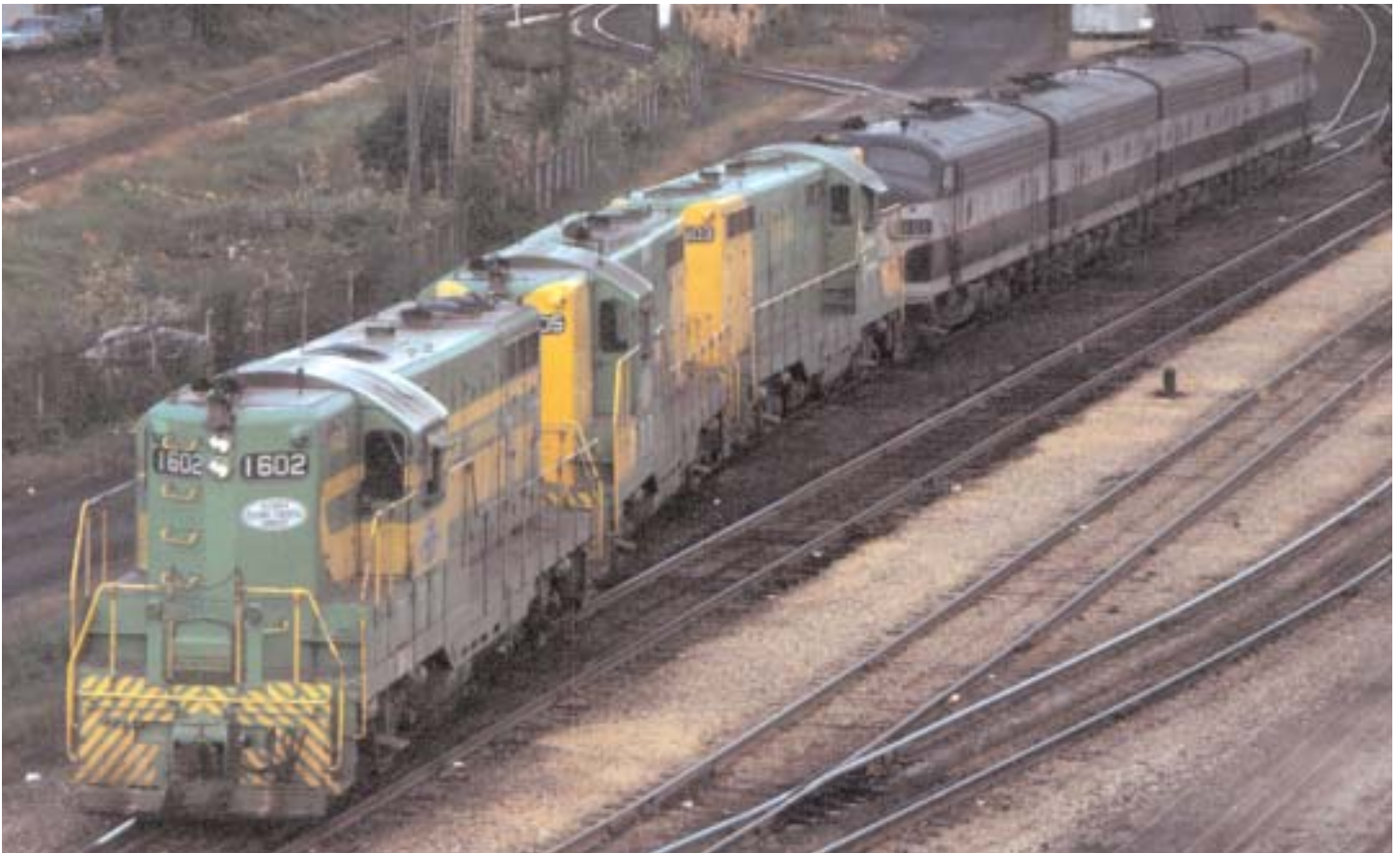
GP7 with all four F7A and B units before repainting of the 1507 Previous page: F7B number 1159 at Madison, IL