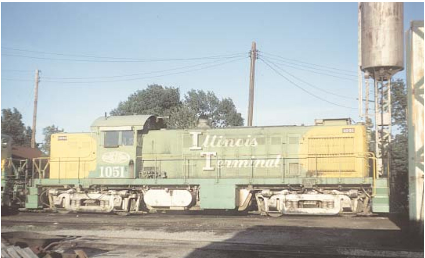
RS1 East Belt Barn in June 1968 wearing scheme 3