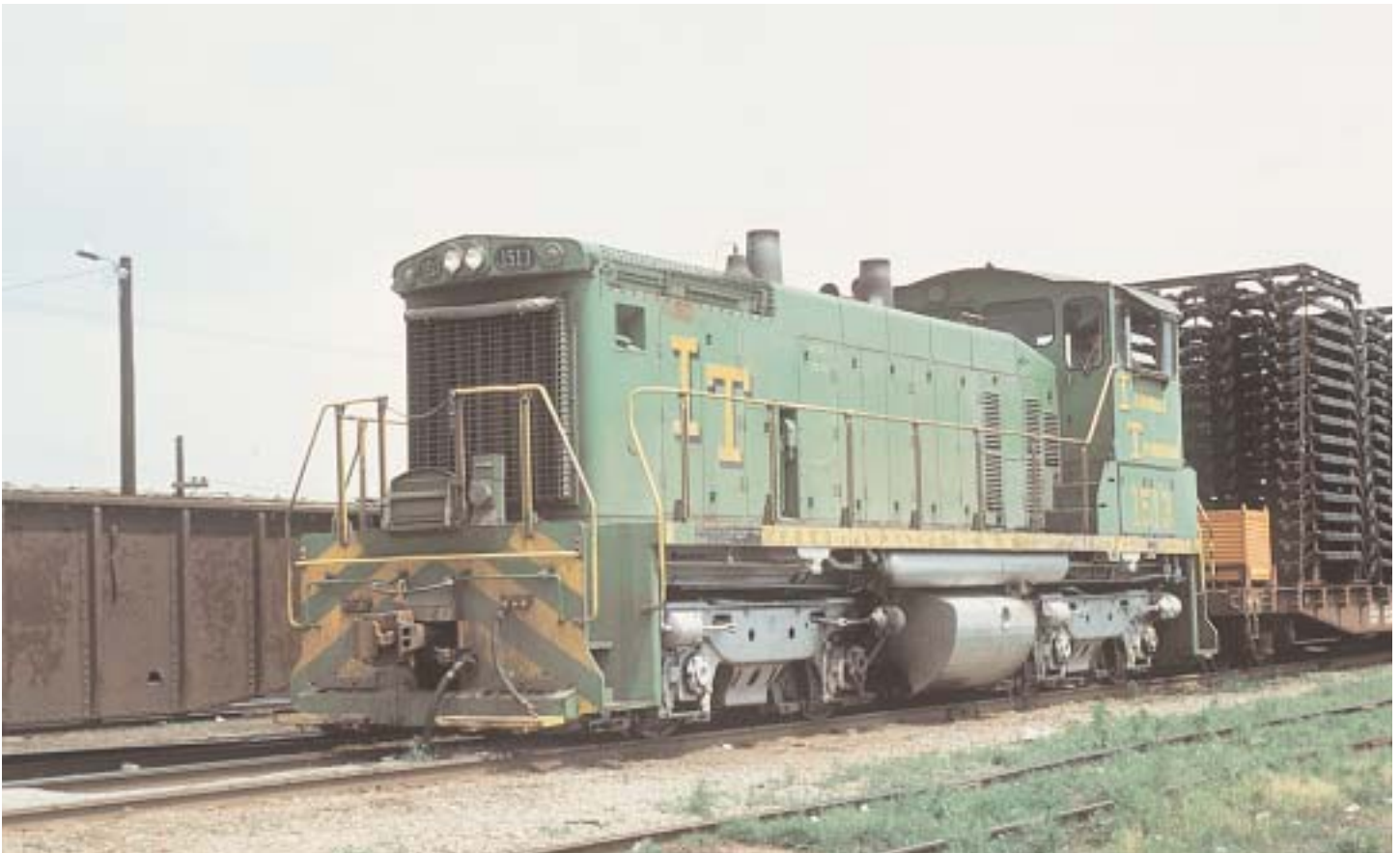
SW1500 at Madison in May 1975 wearing scheme 1