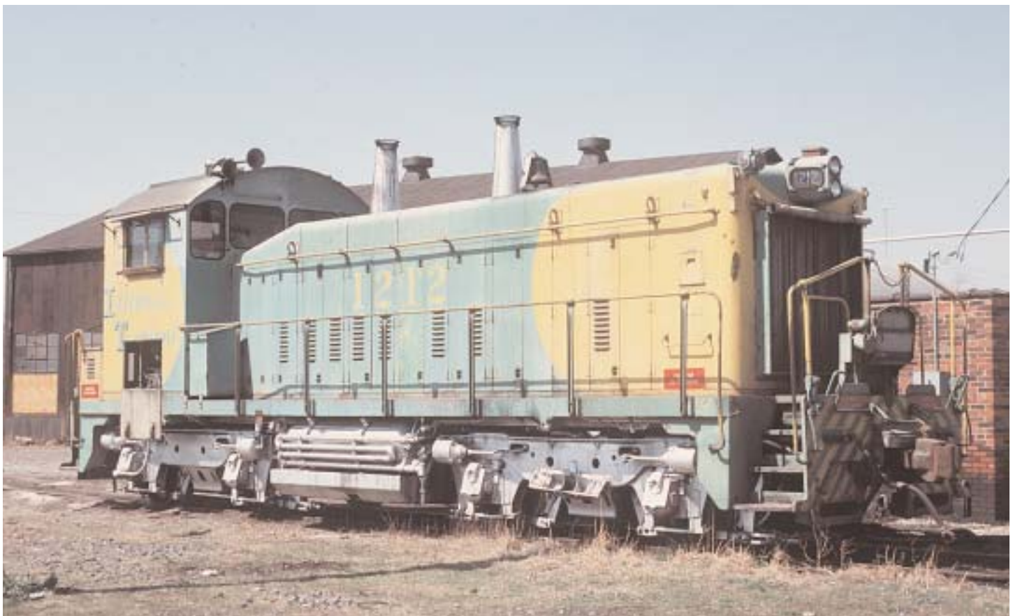
SW1200 at Madison in April 1977, scheme 4