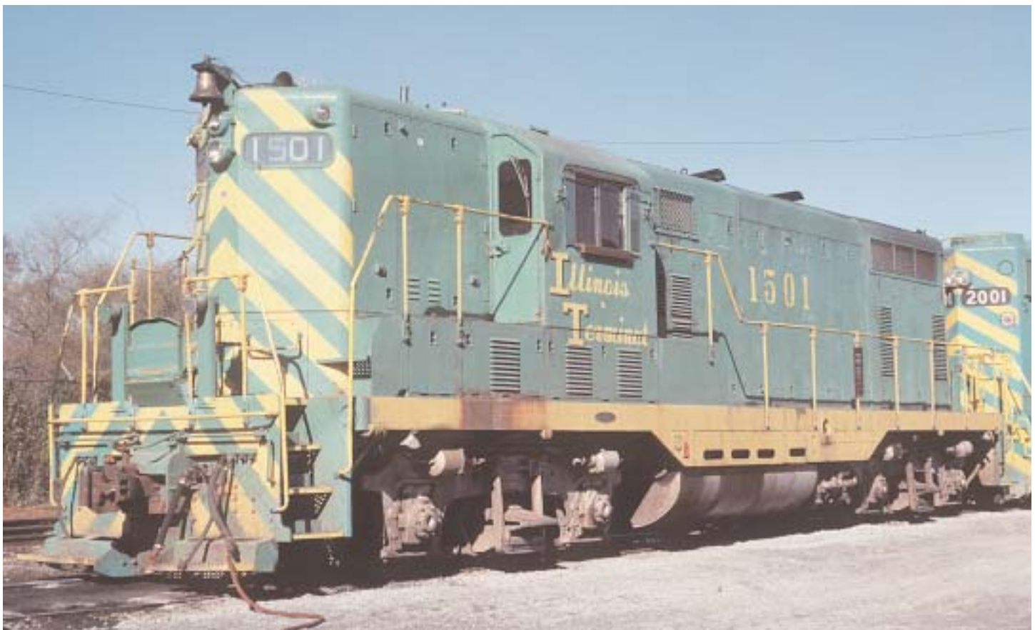
GP7 at Madison in March 1979 wearing scheme 5