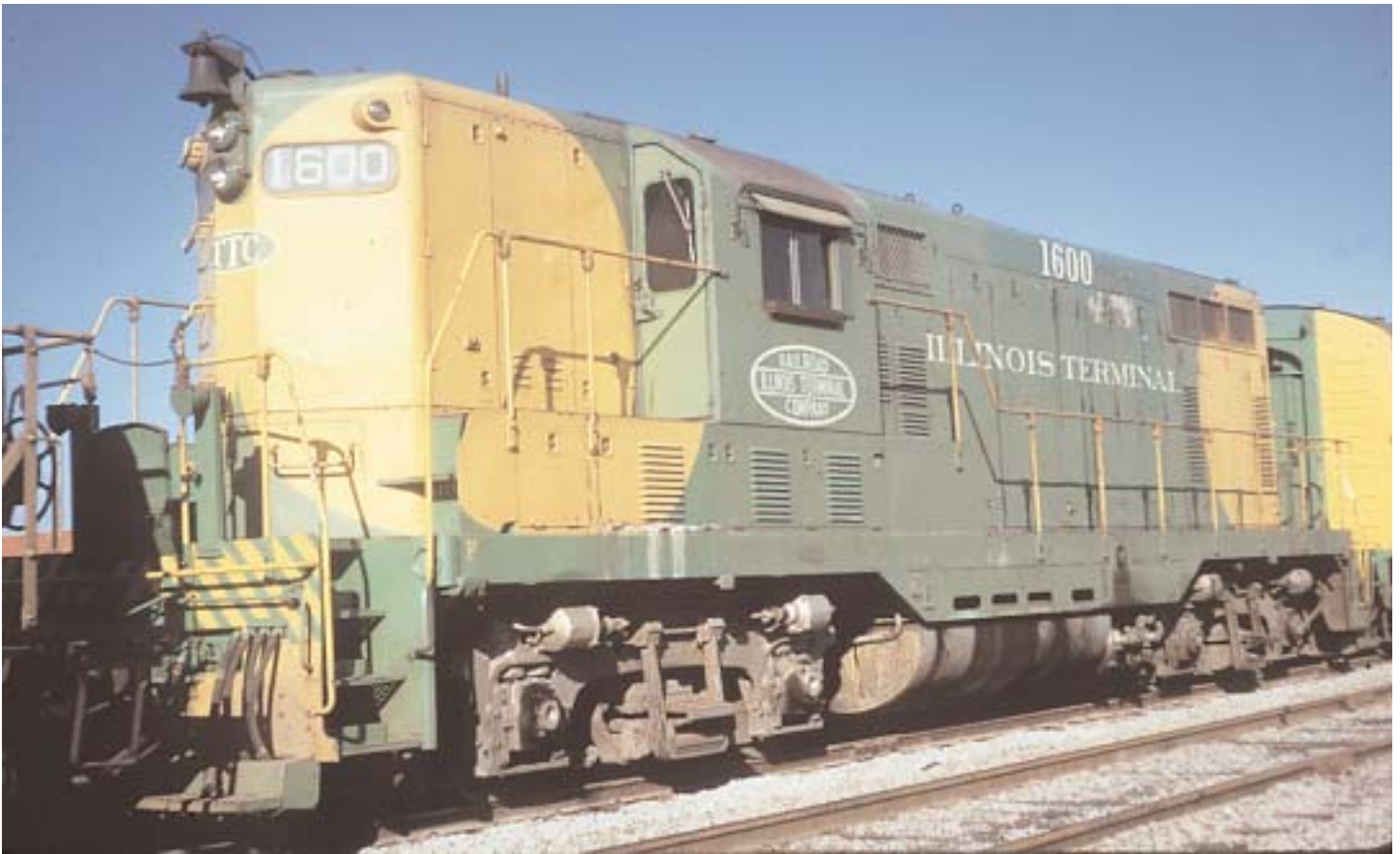
GP7 in East Peoria in 1968 wearing scheme 2 Previous page: GP7 steps at East Belt Barn, Springfield, IL