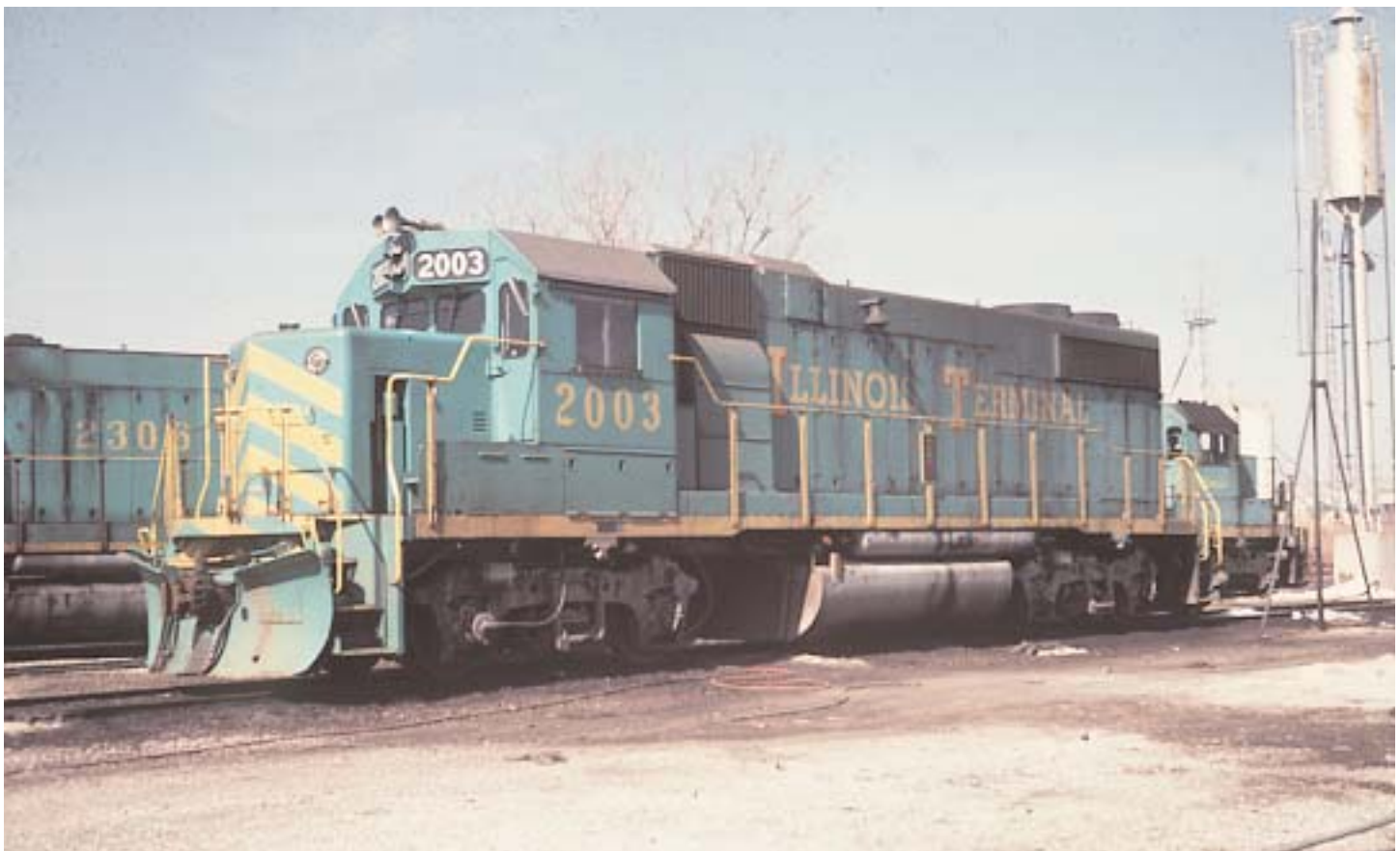
GP38-2 at Decatur