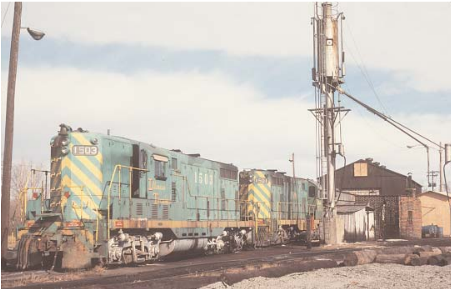
GP7 at Madison wearing scheme 5 in January 1980