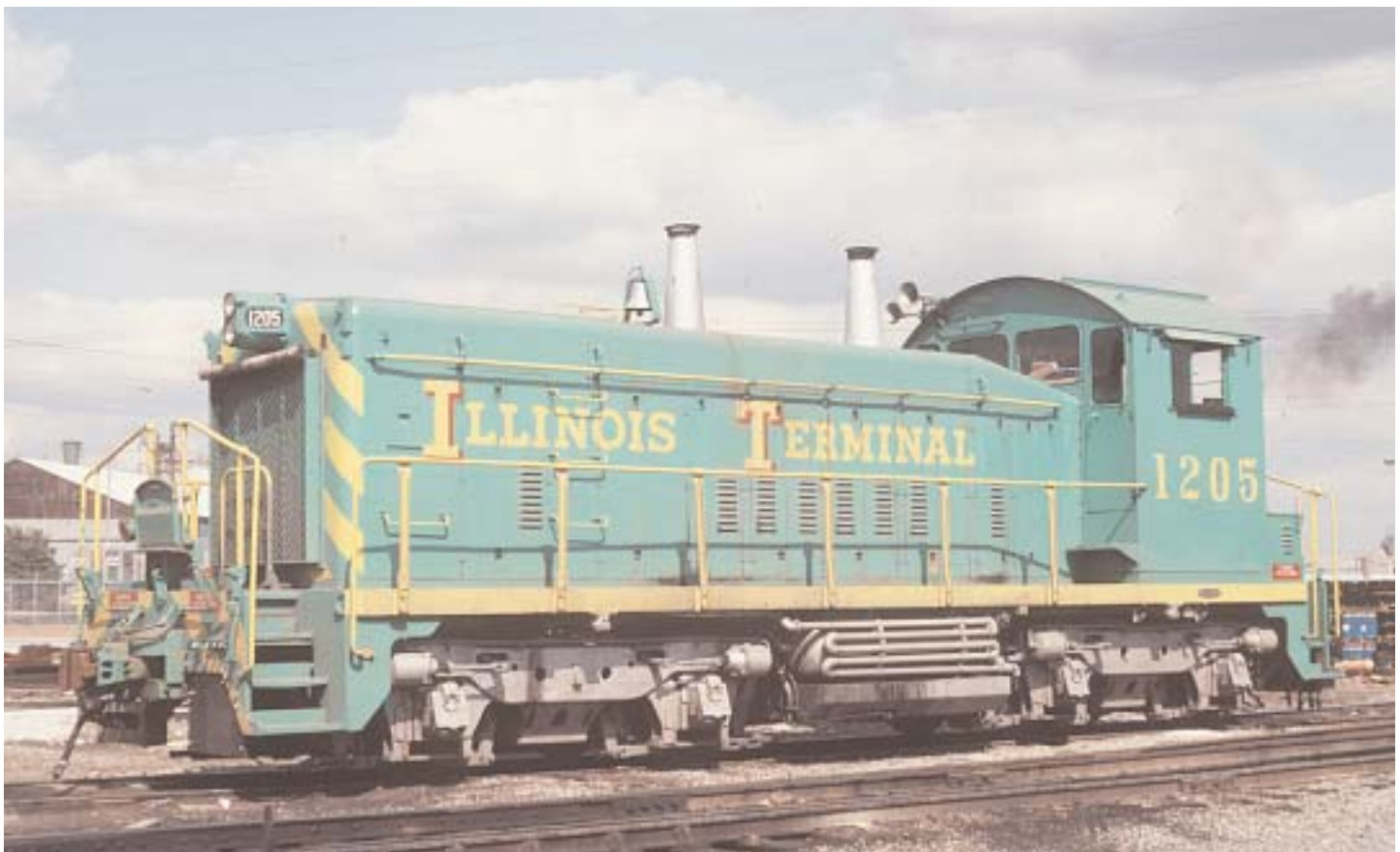
SW1200 at Federal in April 1979 wearing scheme 6