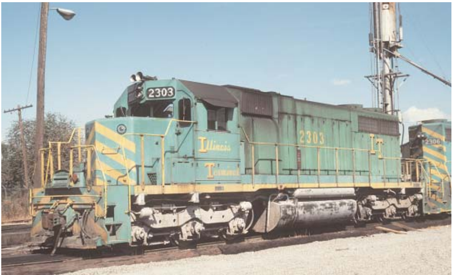
SD39 at Madison in October 1978