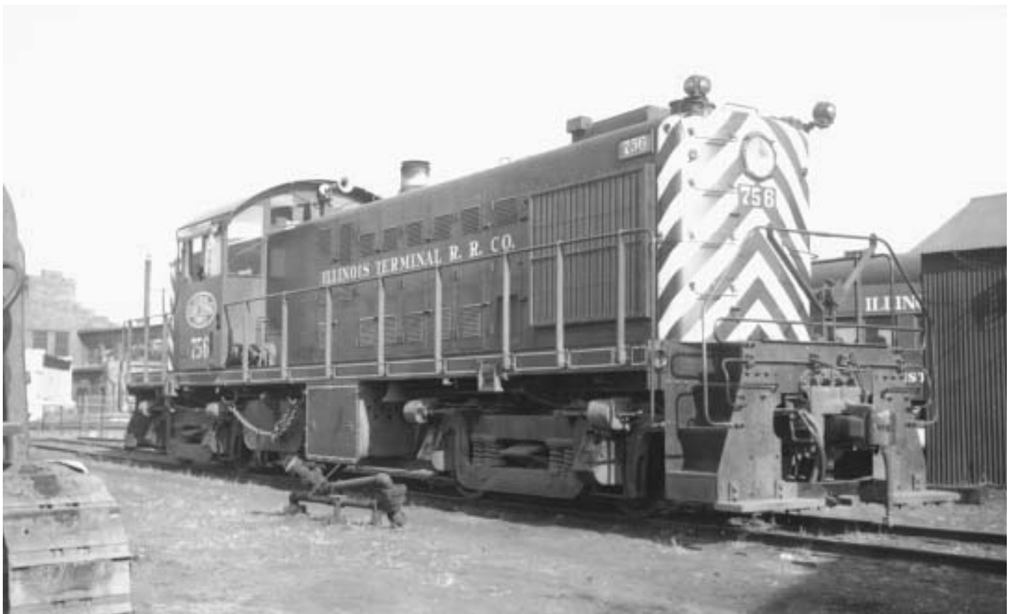
RS1 at Federal wearing scheme 1