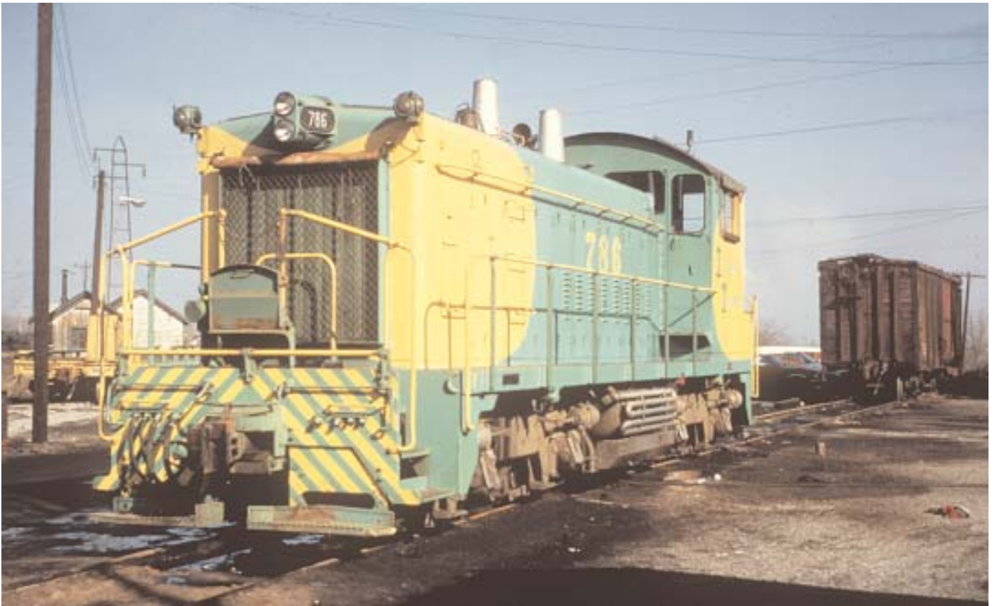
SW1200 at Madison in 1968, scheme 4