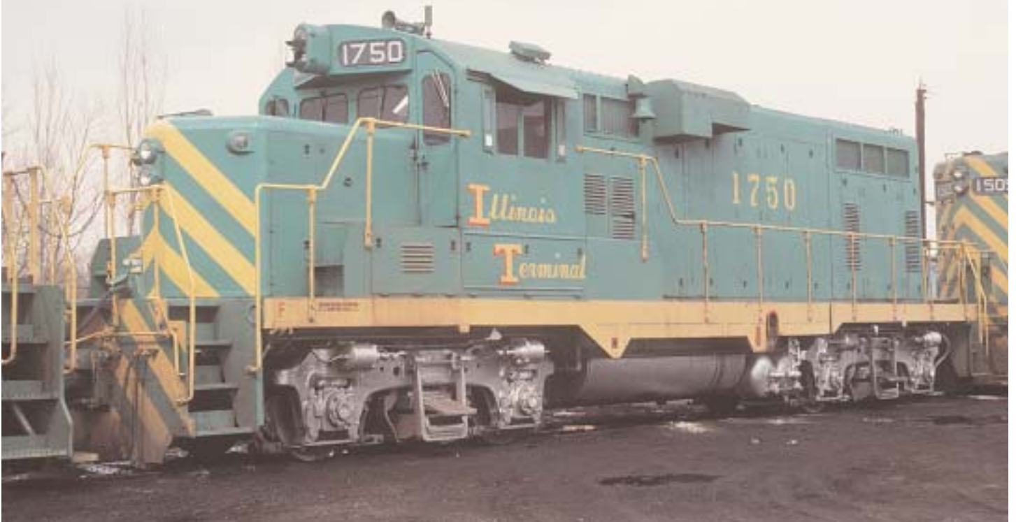
GP10 at Madison in February 1977 on lease from Precision National