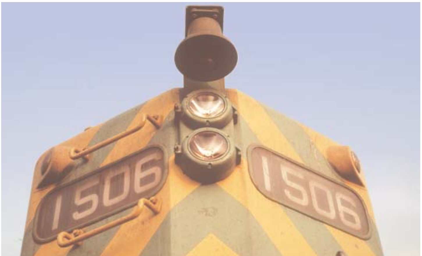
GP7 nose wearing scheme 5 or 6