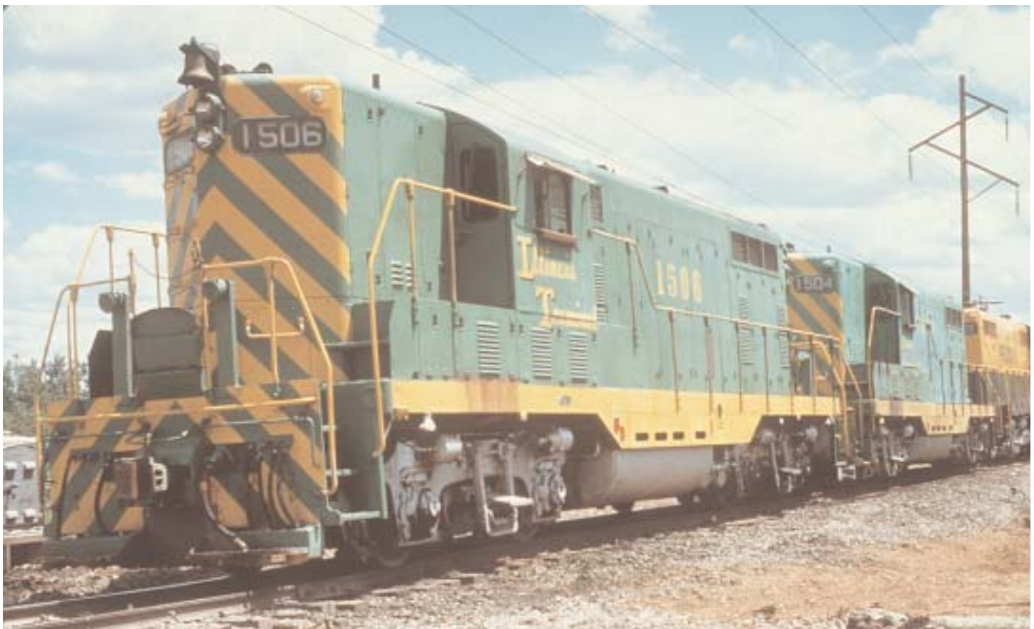
GP7 at Decatur in 1976 wearing scheme 5