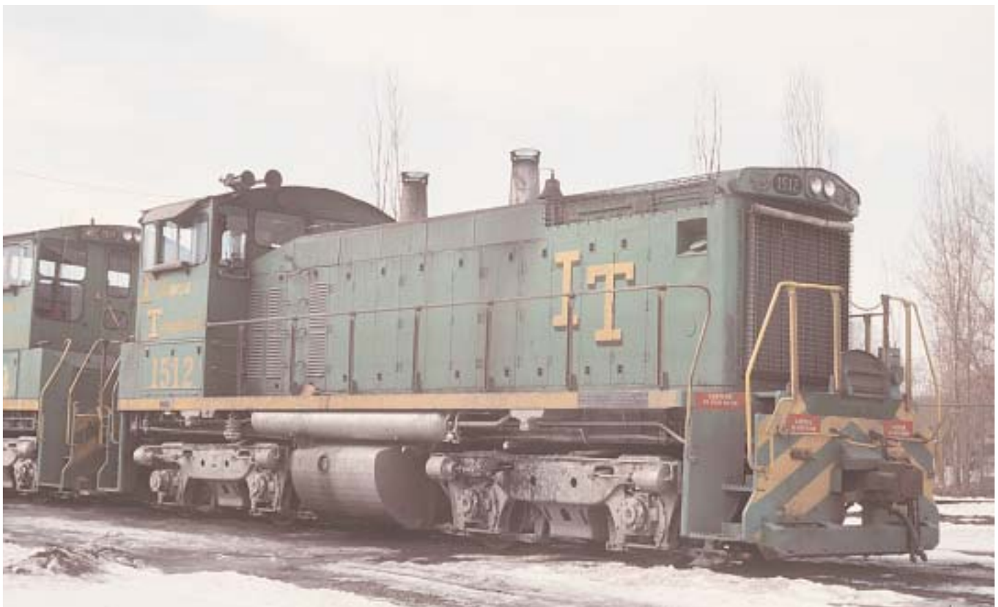
SW1500 at Madison in February 1977 wearing scheme 1