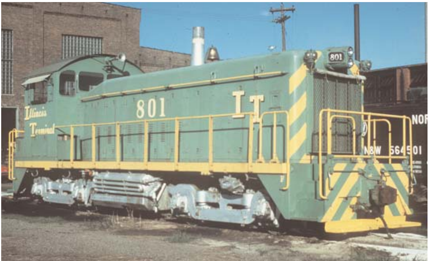
SW800 in scheme 3 at Federal in 1973