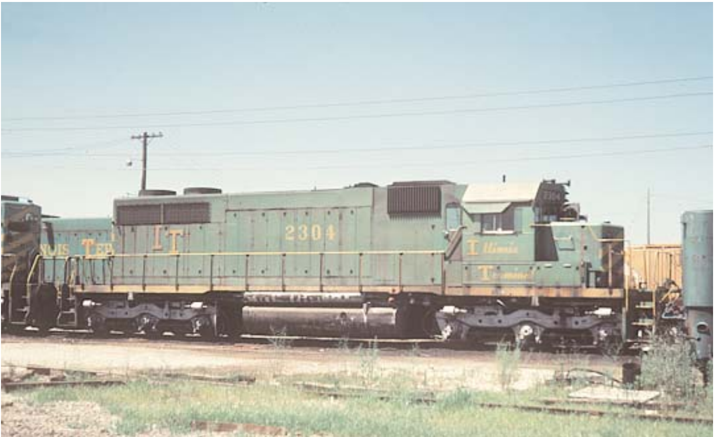
SD39 in Decatur