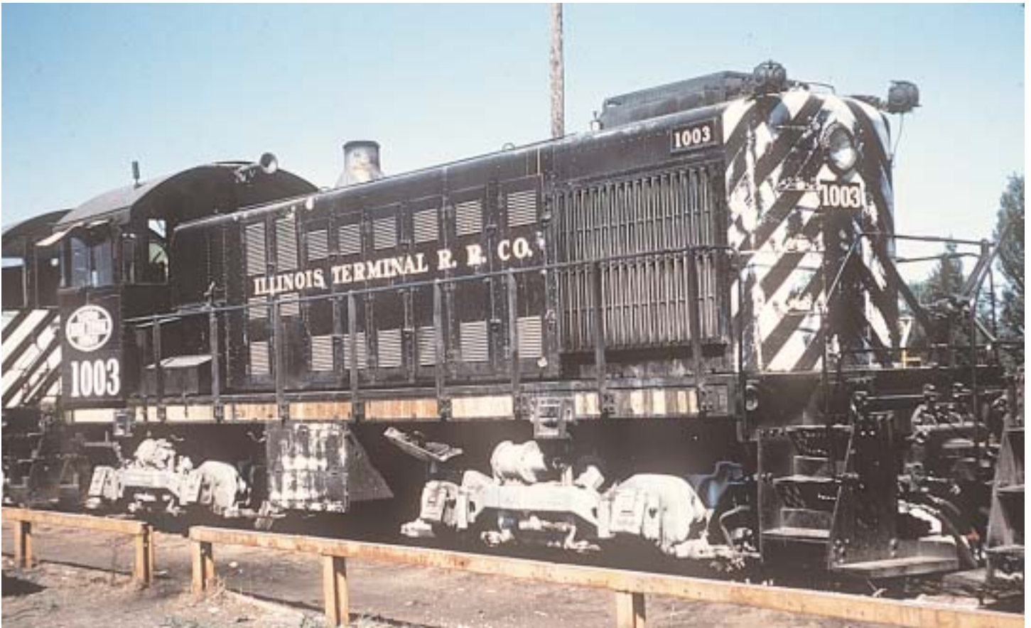
S2 at Madison in June of 1968 wearing scheme 1