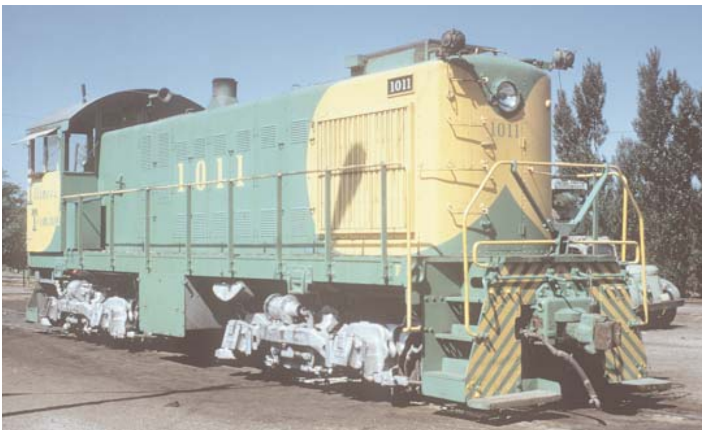
S2 at Lang, Madison, IL in 1968, scheme 3