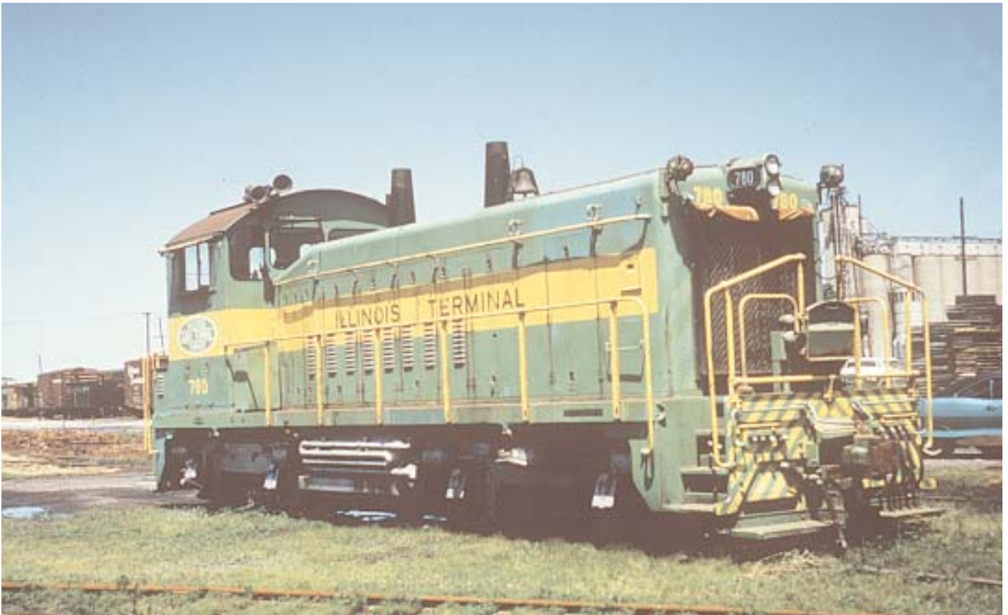
SW1200 at Decatur in 1967, scheme 2