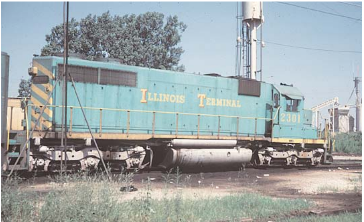
SD39 2301 at Decatur, IL Previous page: SD39 number 2302 at Loveless with unit coal train