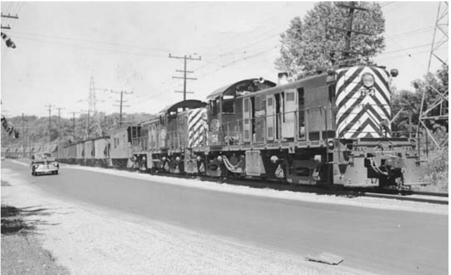
RS1 at E. Peoria along Bloomington Road in the 1950s, scheme 1