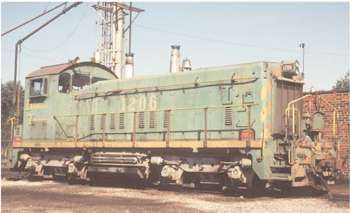
SW1200 at Madison in May 1980 wearing scheme 5