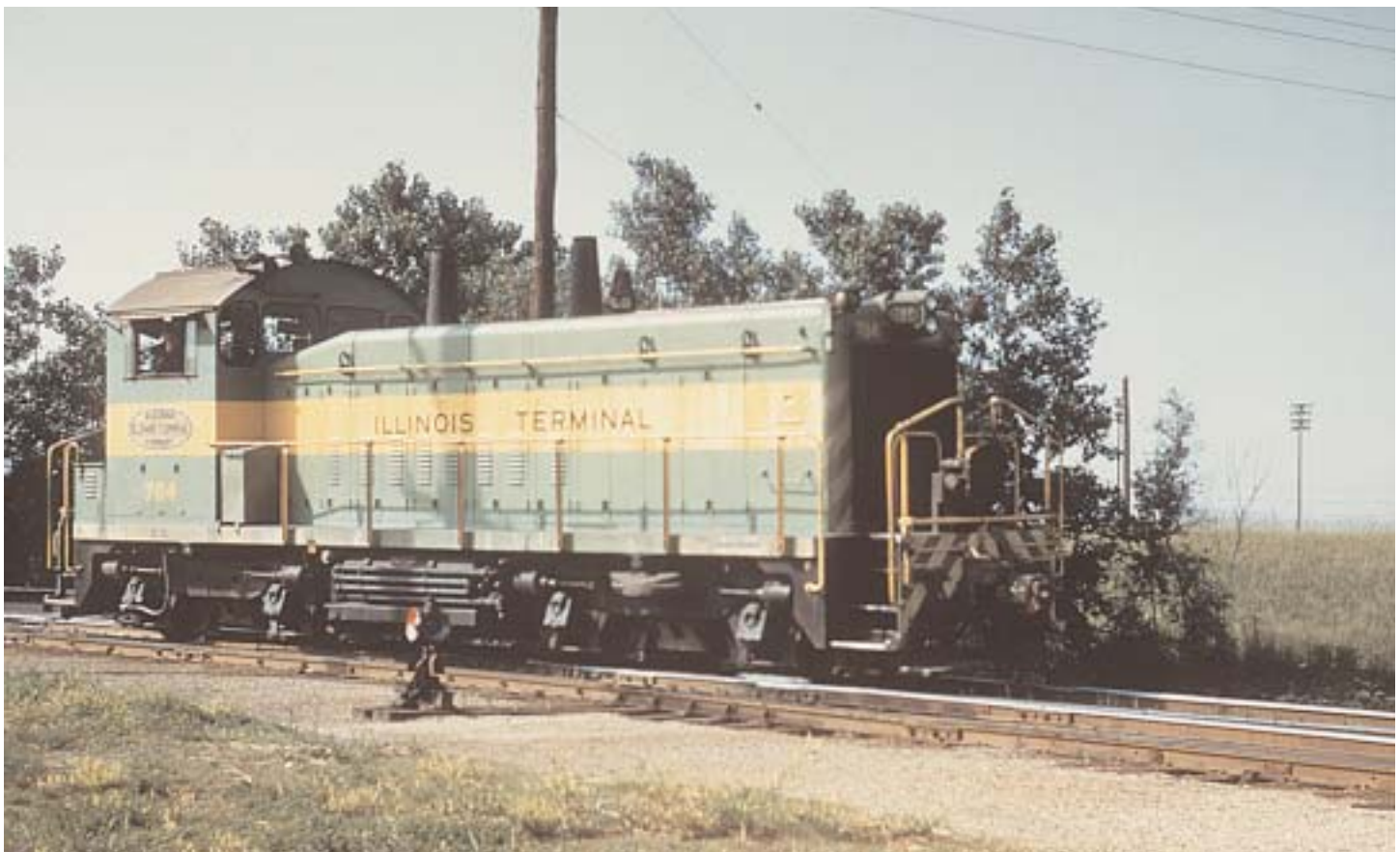
SW1200 at McKinley, Madison, IL in 1961, scheme 1