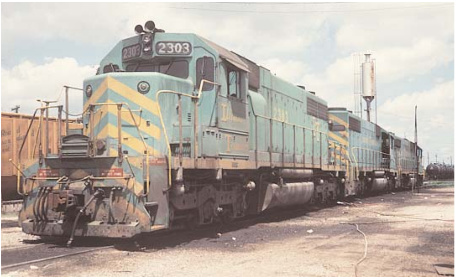
SD39 at Decatur RIP