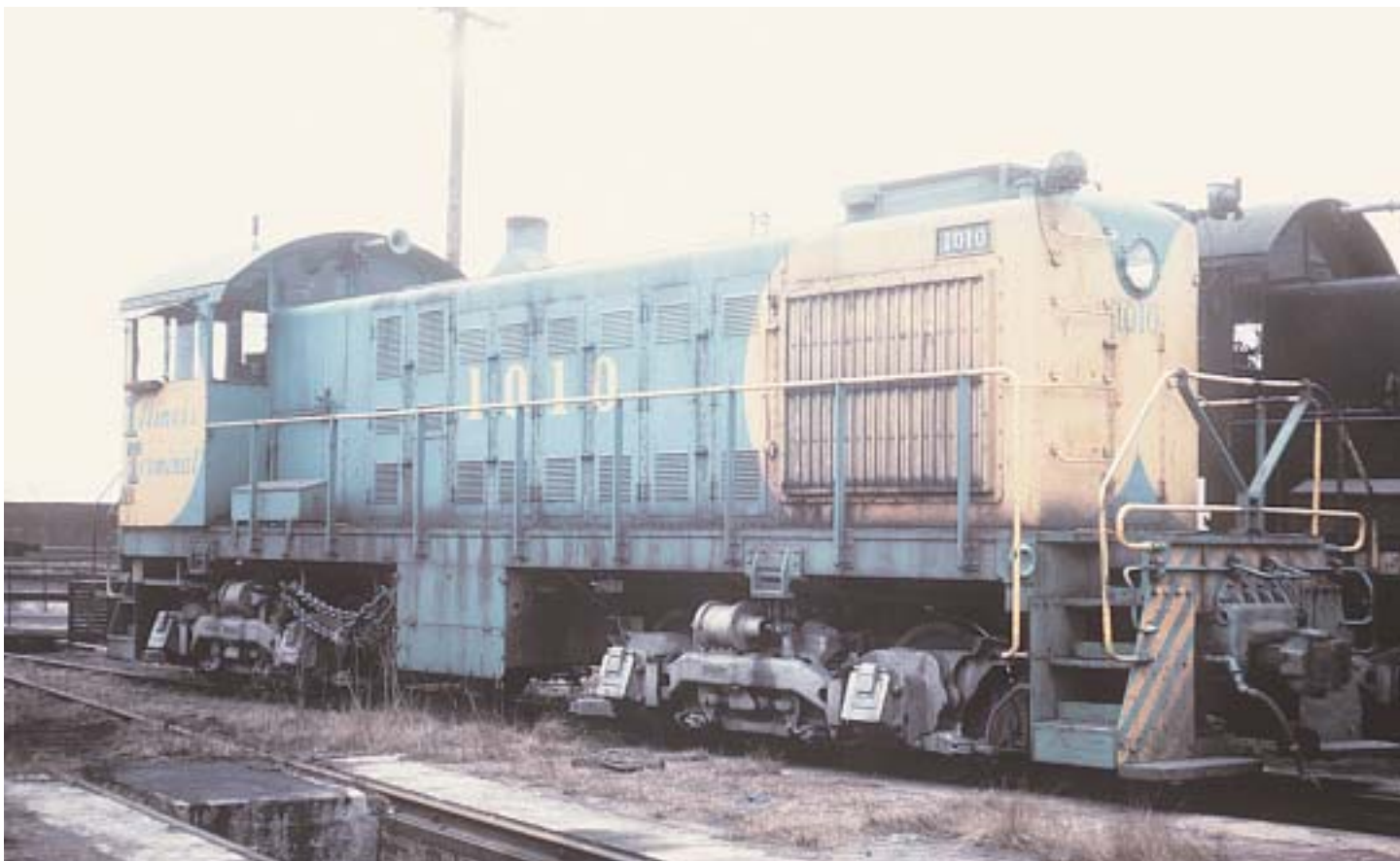
S2 at Federal in 1969, scheme 3