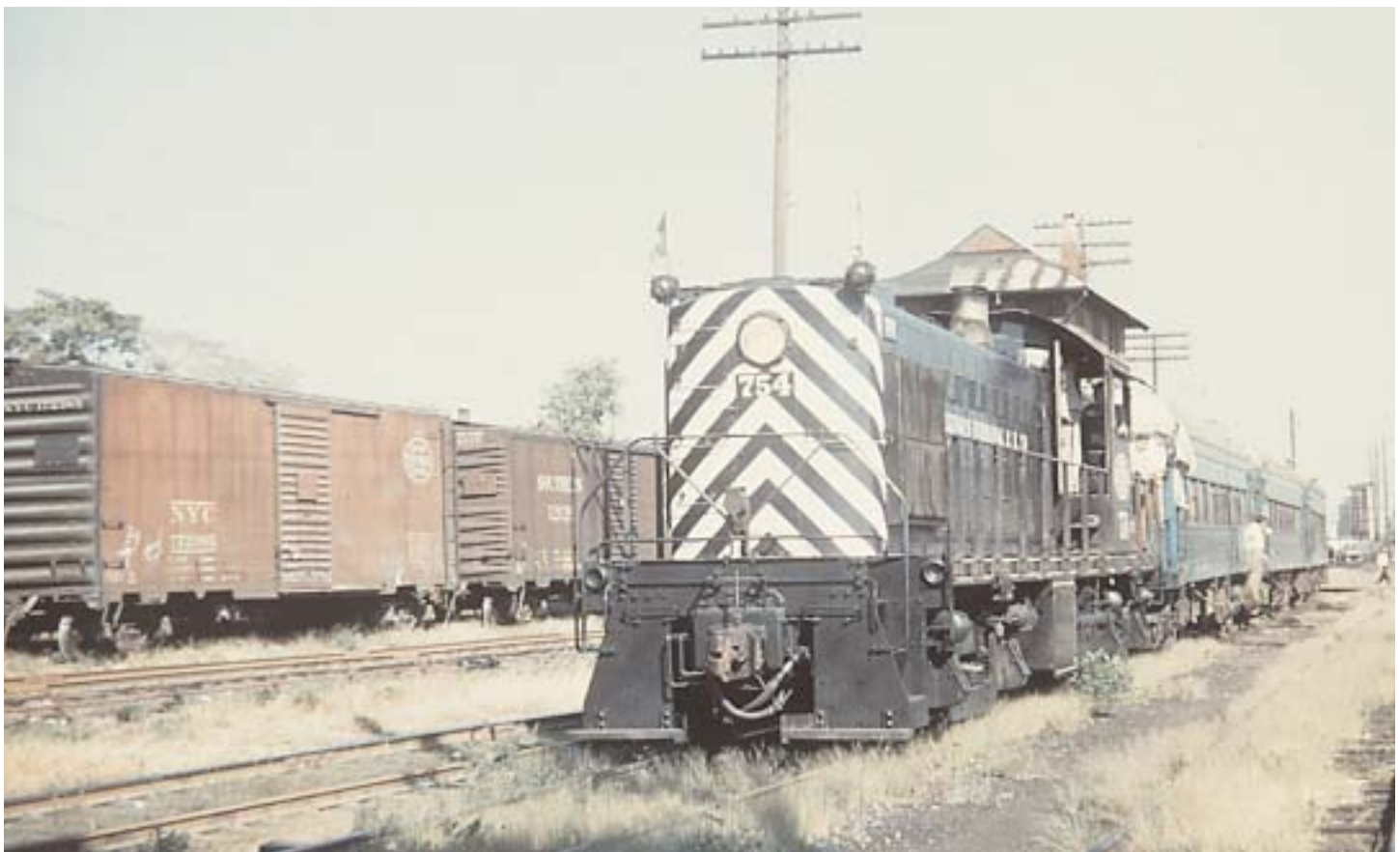
RS1 at Henry Street Tower, Alton, IL in scheme 1