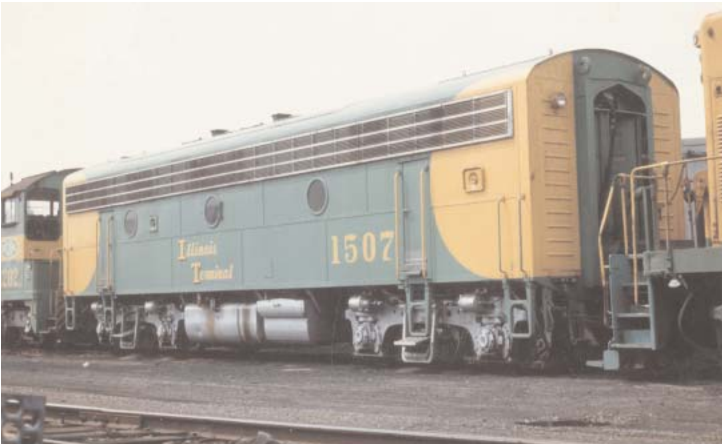
F7B number 1507 at TP&W yard in East Peoria in the spring 1968