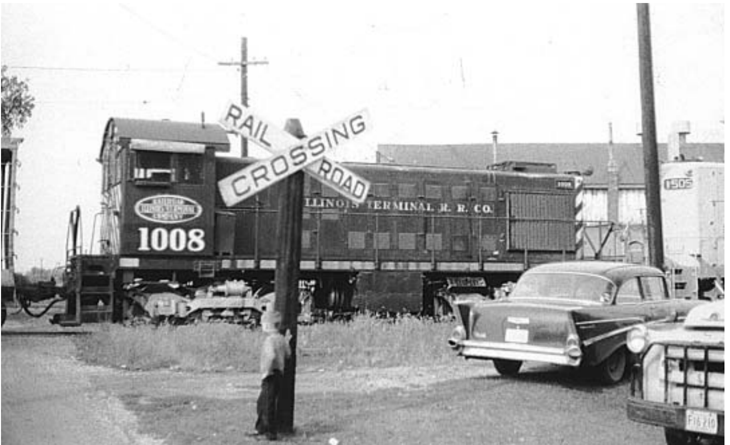
S2 at East Belt yard in September 1969 wearing scheme 1