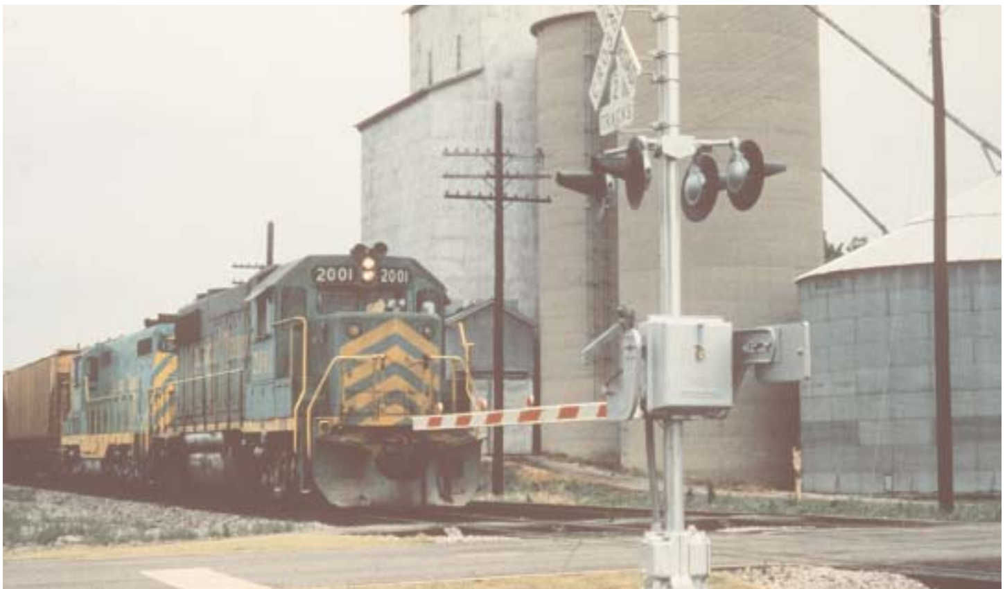
GP38-2 at Lodge grade crossing previous page: GP38-2 at Lodge bridge on ICRR