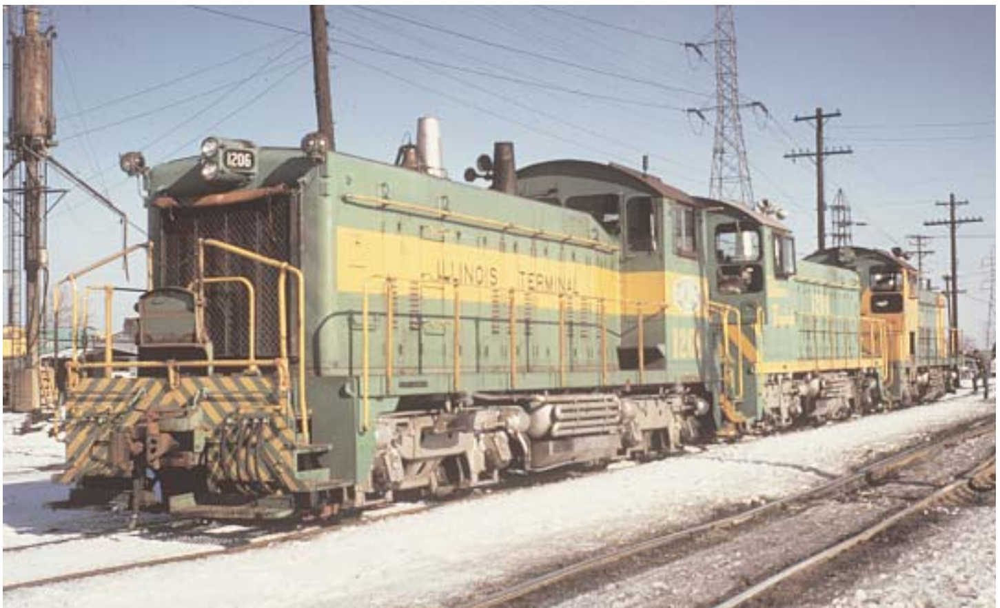
SW1200 at Lang, Madison, IL 1970