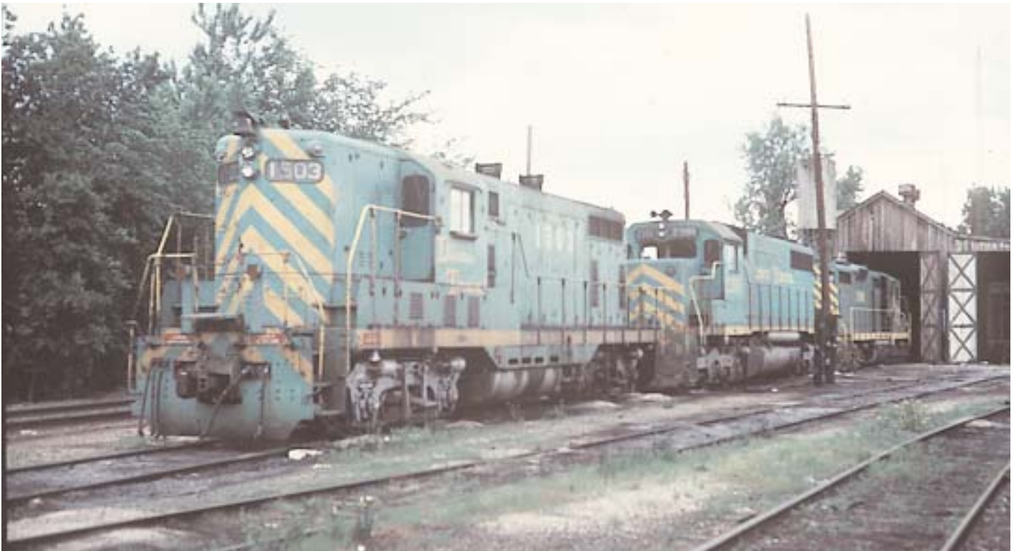
GP7 at East Belt wearing scheme 5 before 1981