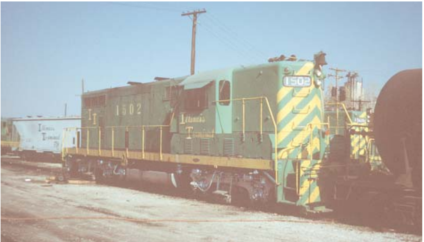
GP7 in Decatur before 1980 wearing scheme 5