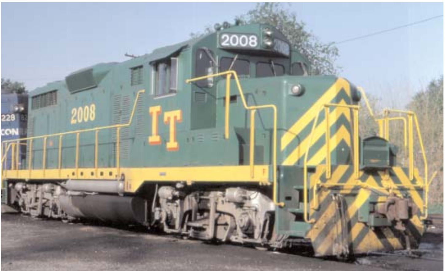
GP20 is ex-UPRR number 712 and was numbered 2008 by N&W