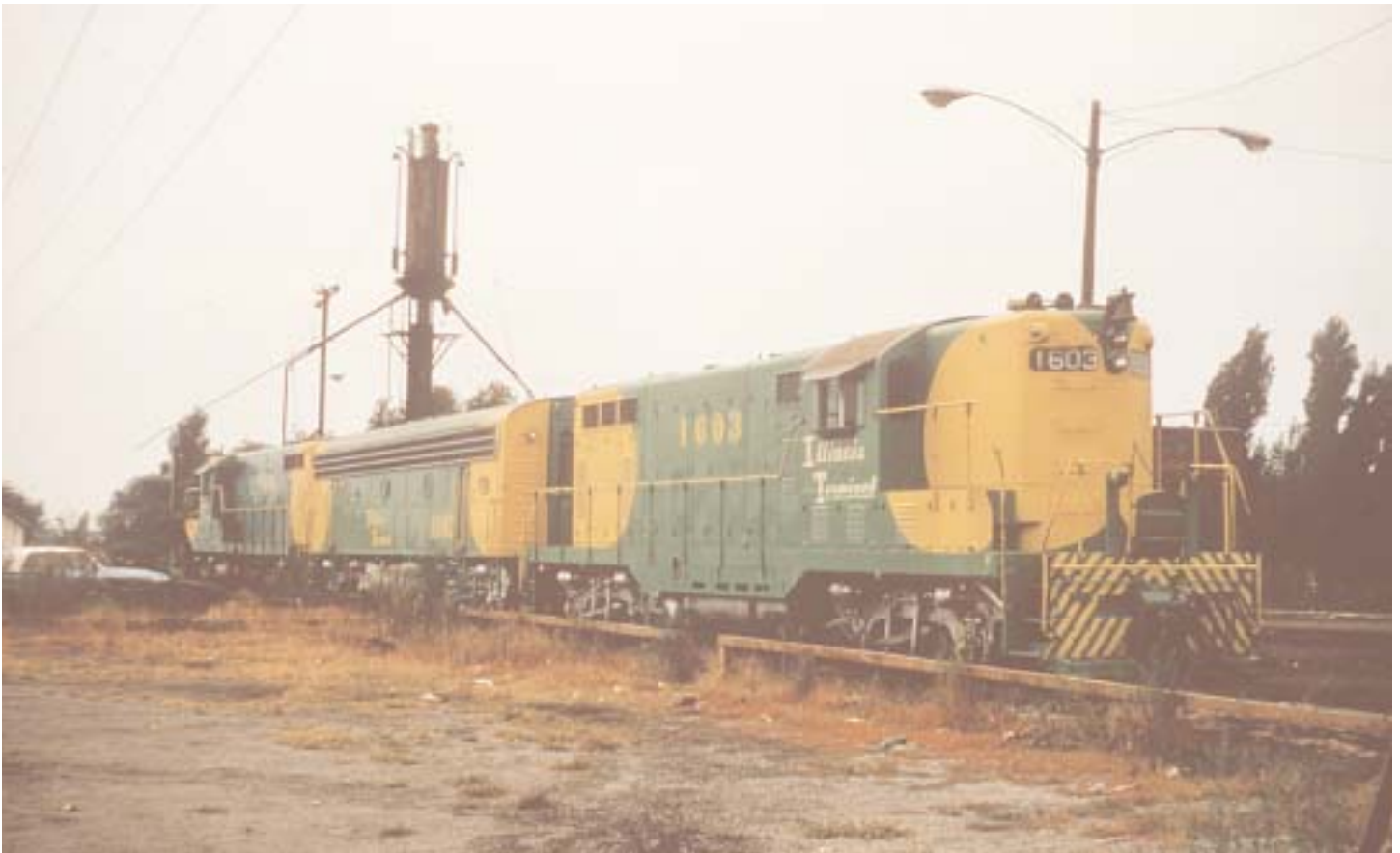
GP7 in Madison, IL wearing scheme 4