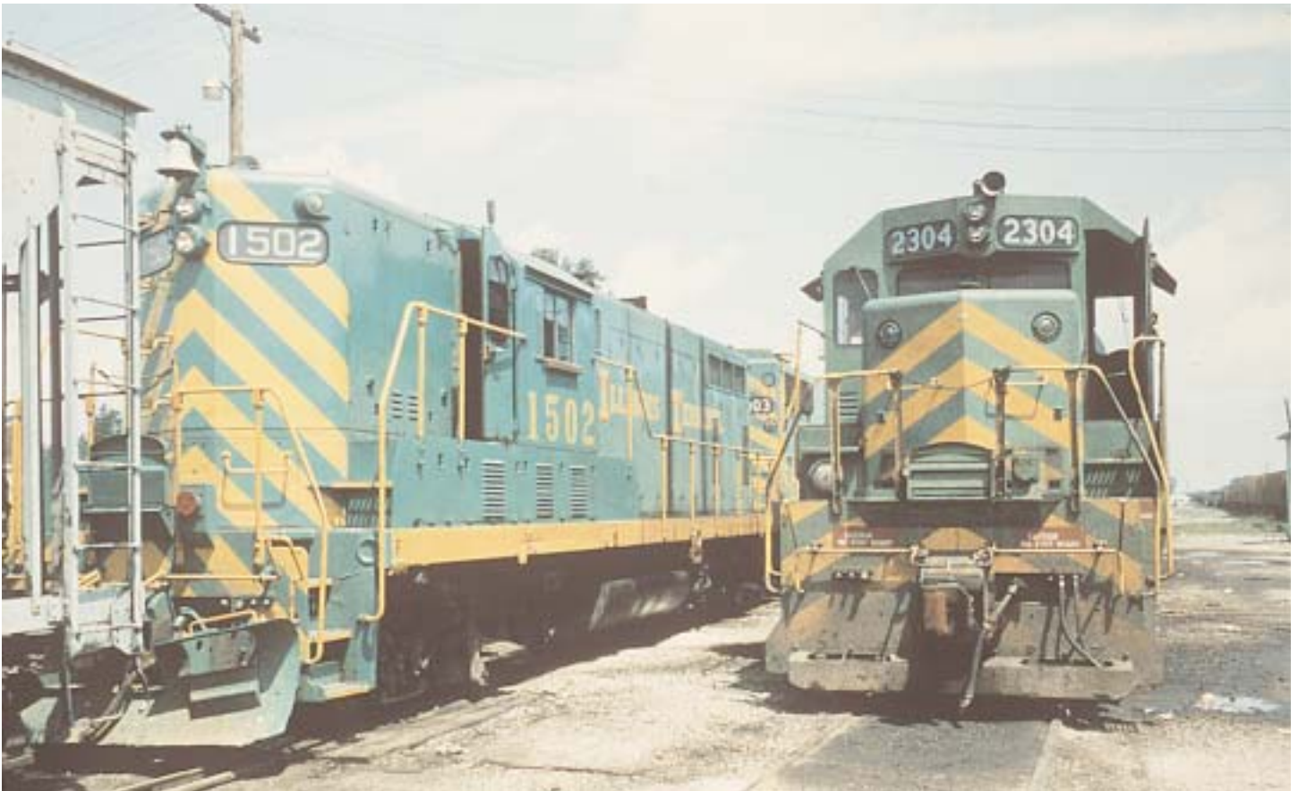
GP7 and SD39 between 1980 and 1981 wearing scheme 6, Decatur RIP Previous page: GP7 crossing GM&O at Minier.