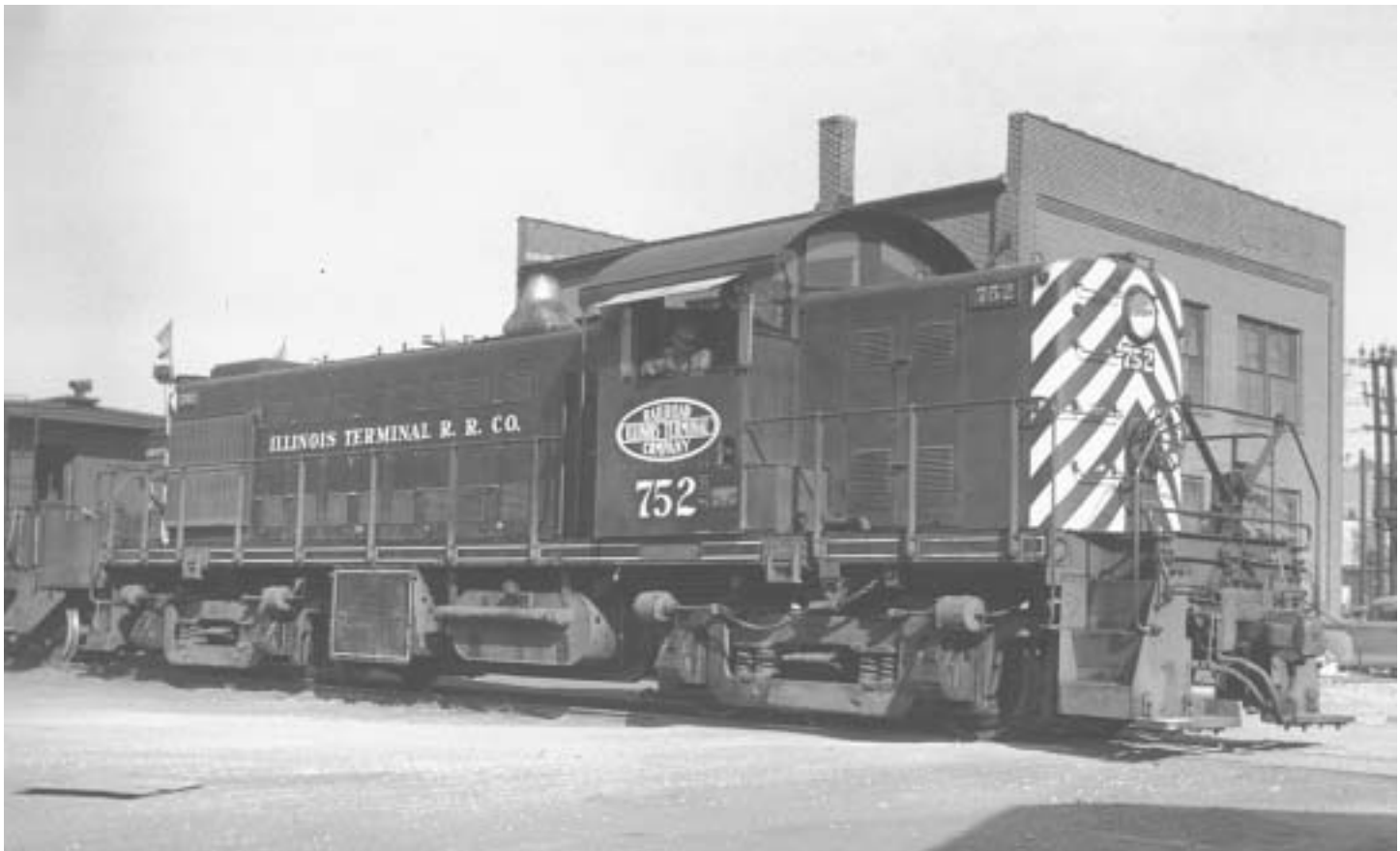
RS1 at Alton in scheme 1