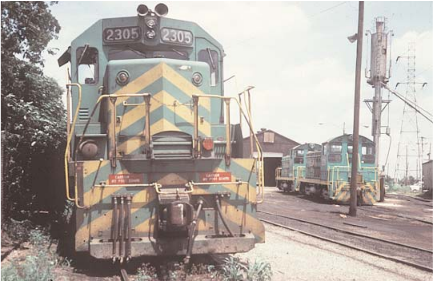
SD39 at Lang, Madison, IL