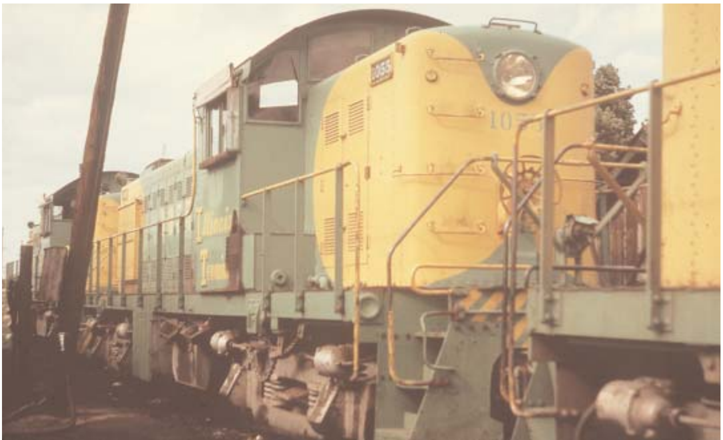
RS1 at Springfield in 1968 wearing scheme 4