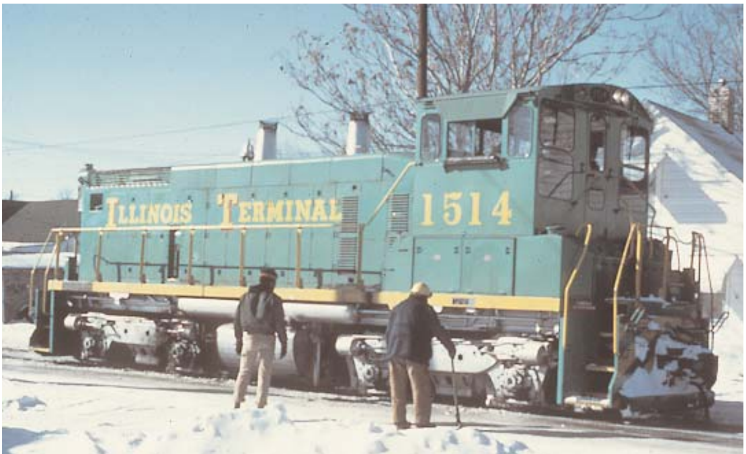
SW1500 at Carlinville in 1978 in scheme 2