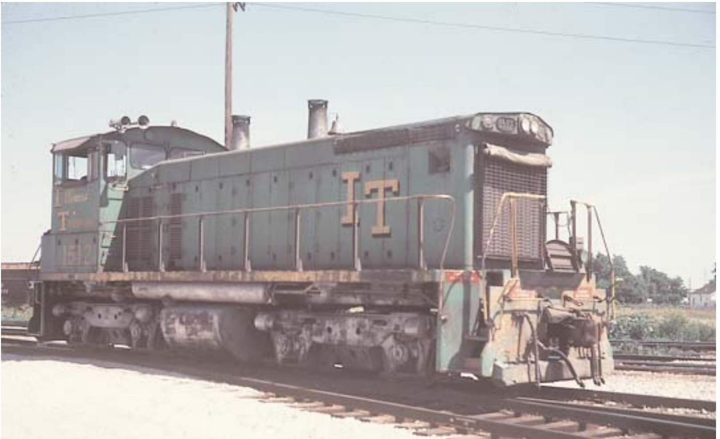
SW1500 at Decatur wearing scheme 1