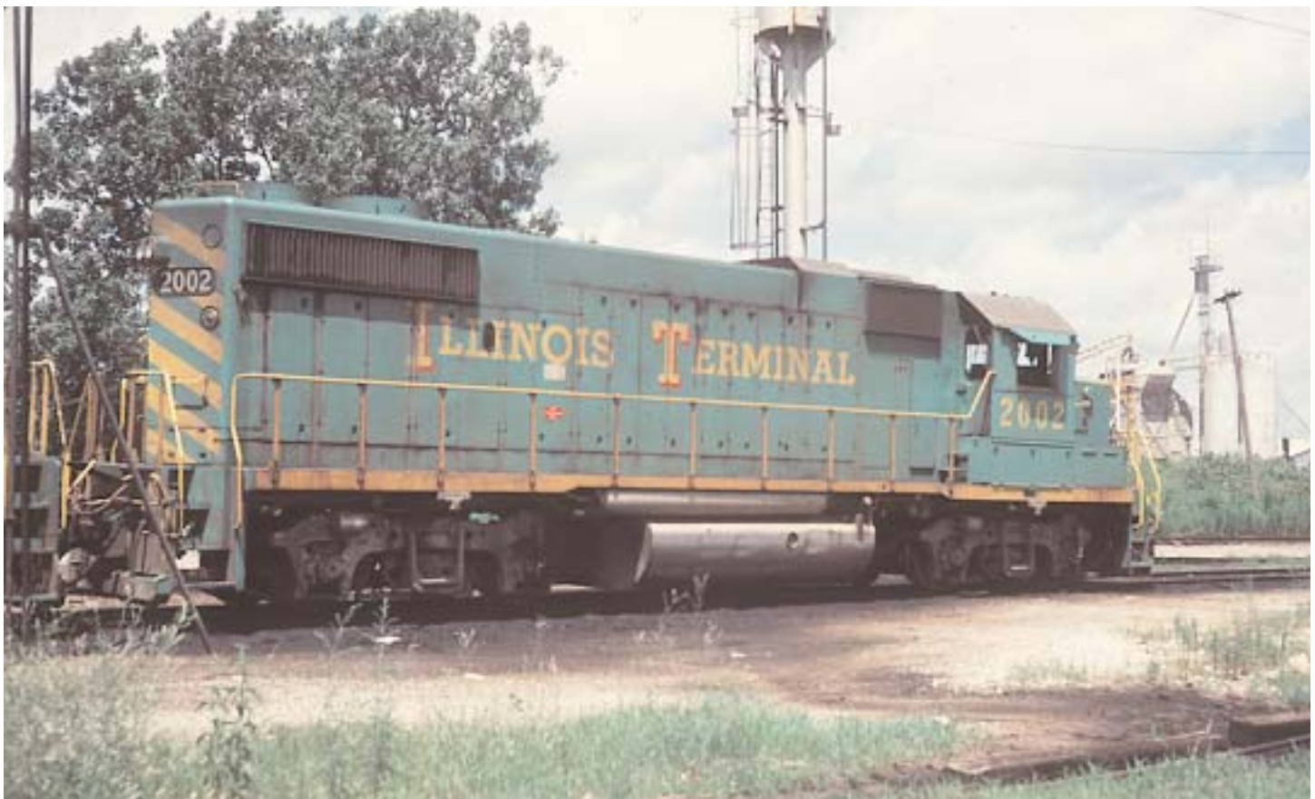
GP38-2 in Decatur