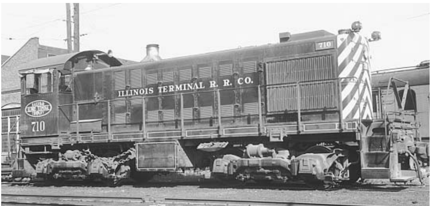
S2 at Decatur in September 1952 wearing scheme 1