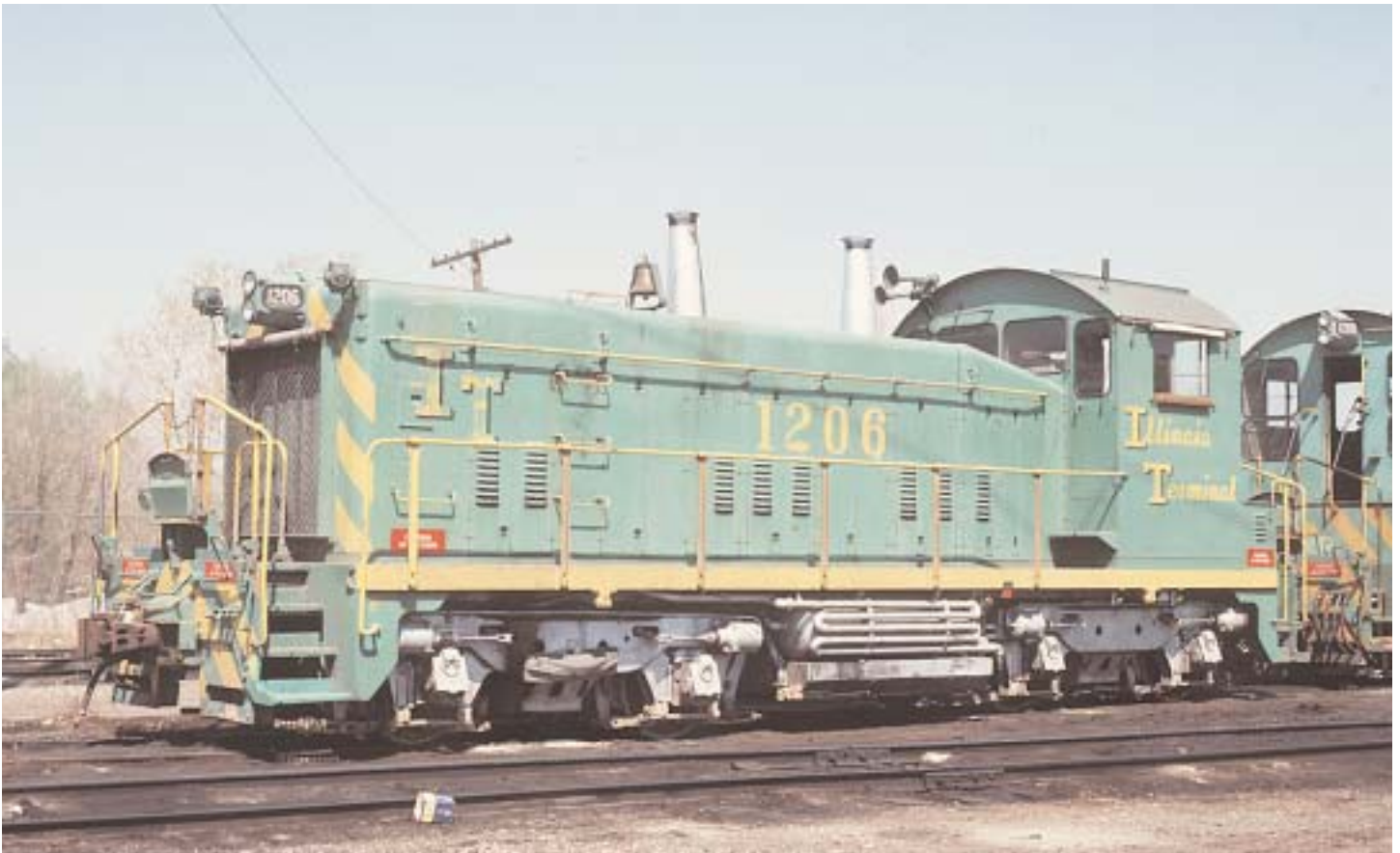
SW1200 at Madison in April 1977 wearing scheme 5