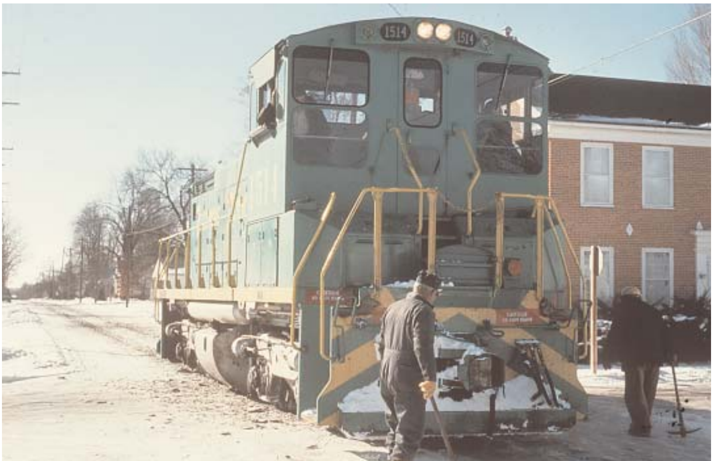
SW1500 at Carlinville in 1978 in scheme 2