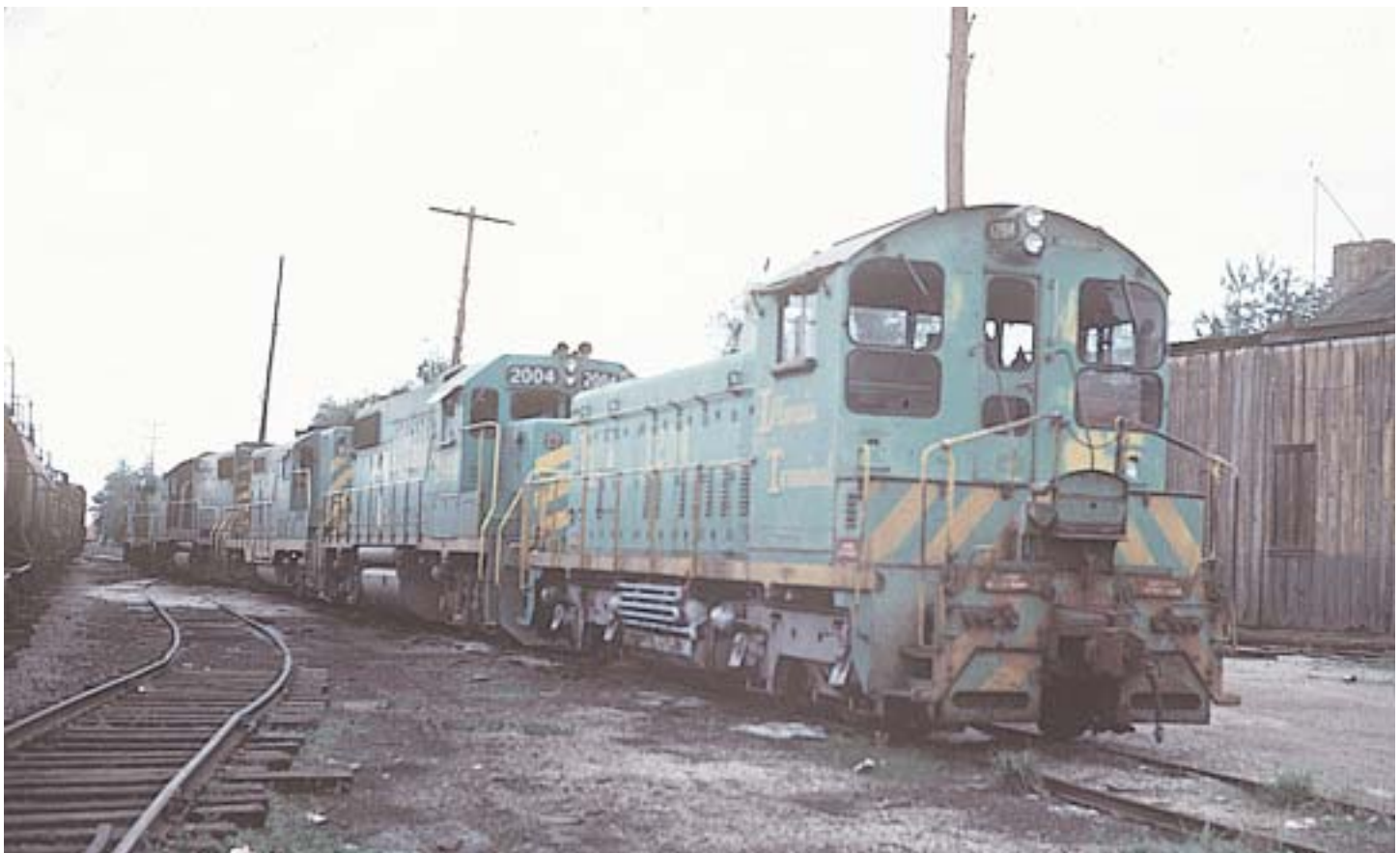
SW1200 at East Belt wearing scheme 5