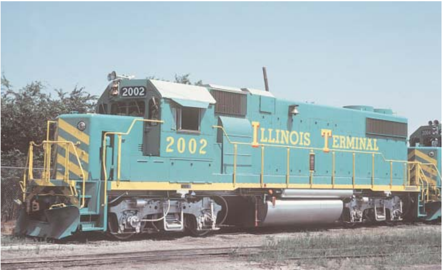
GP38-2 at Madison in July 1977