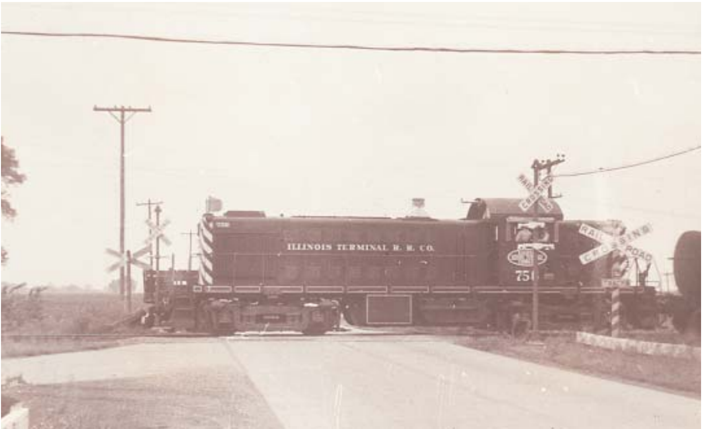
RS1 at Troy Road wearing scheme 1