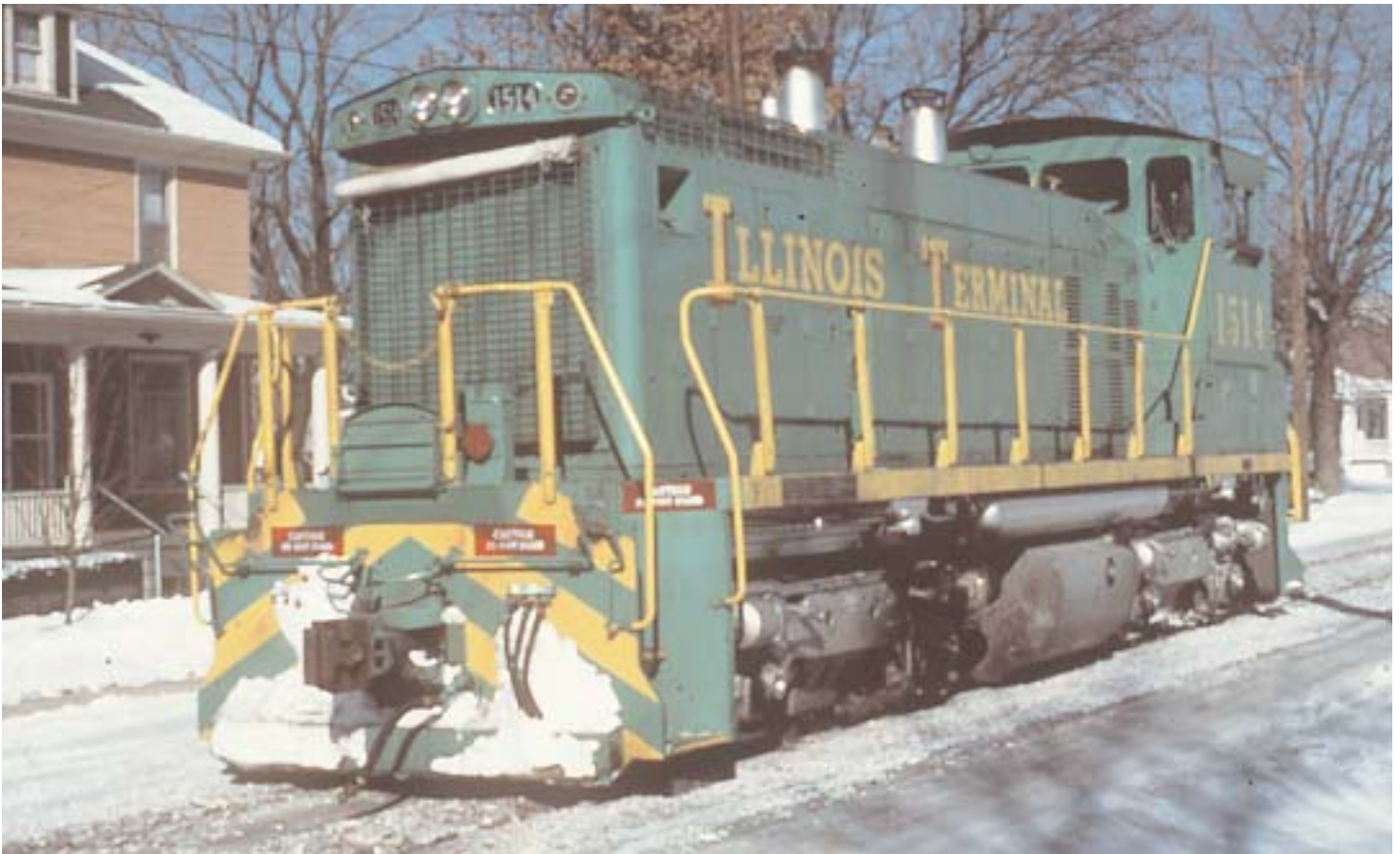
SW1500 at Carlinville in 1978 in scheme 2