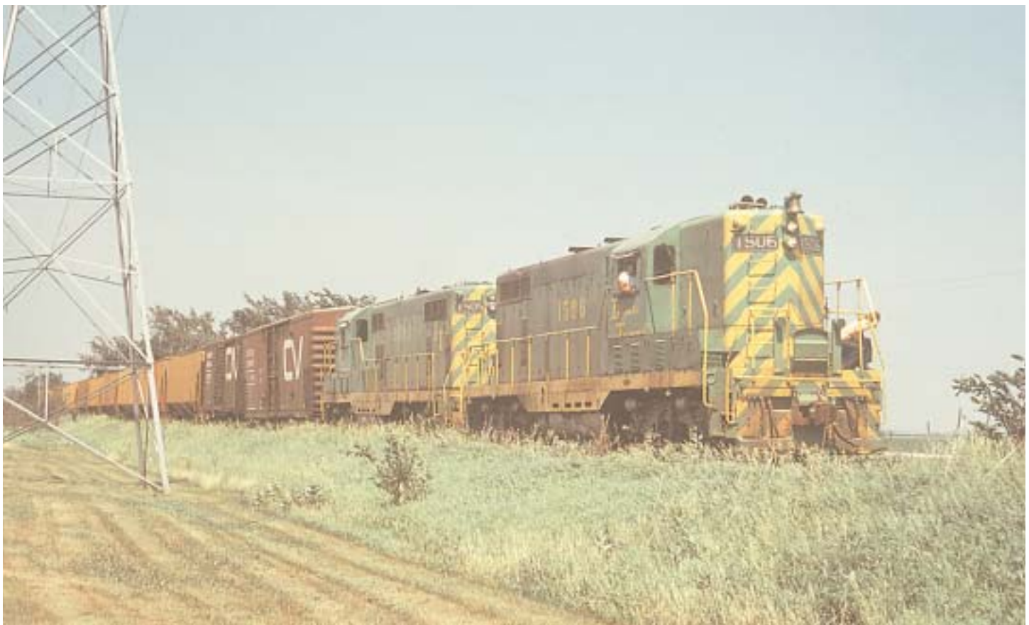
GP7 at Argenta-Oreana on ICRR in June 1978 wearing scheme 5