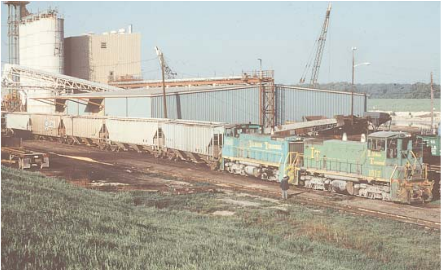
SW1500 at Granite City docks in 1981 one in each scheme