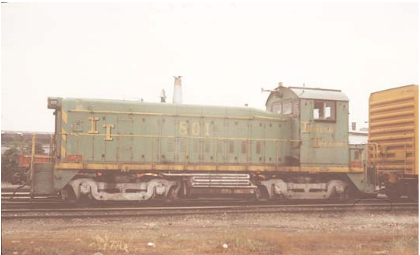
SW800 in scheme 3 at Federal in 1980