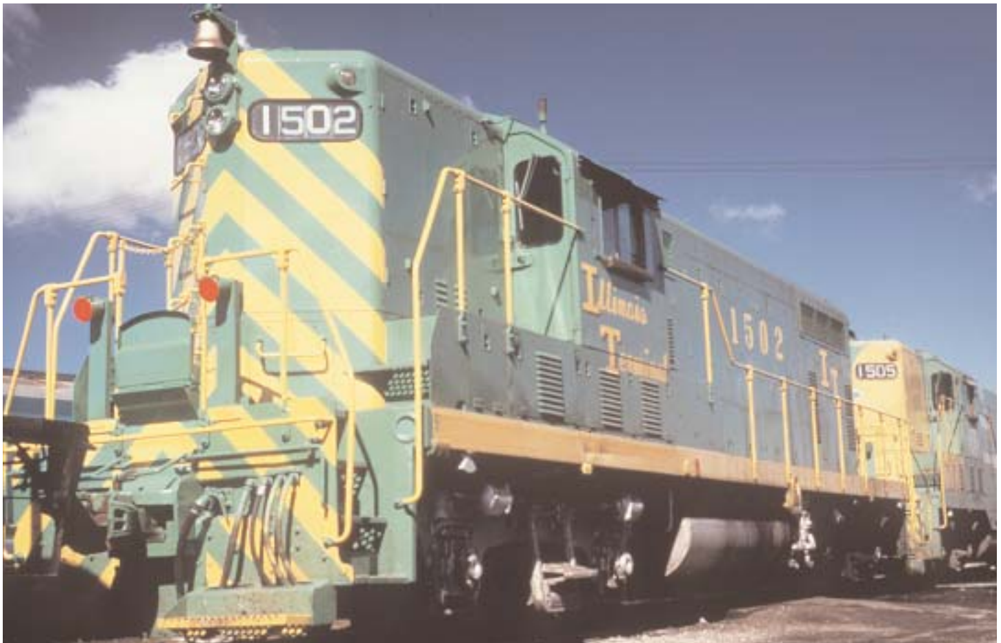
GP7 at Decatur before 1980 wearing scheme 5