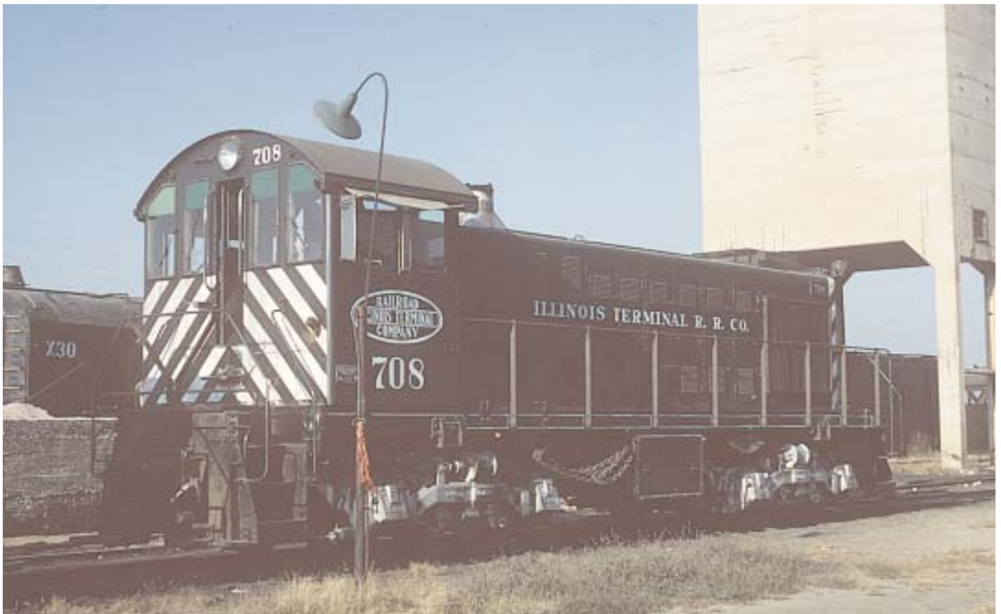
S2 at Federal, scheme 1