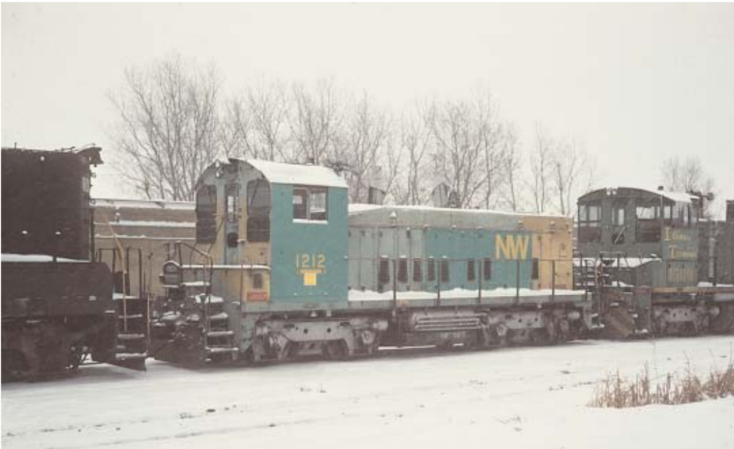
SW1200 at Decatur after N&W merger in 1982