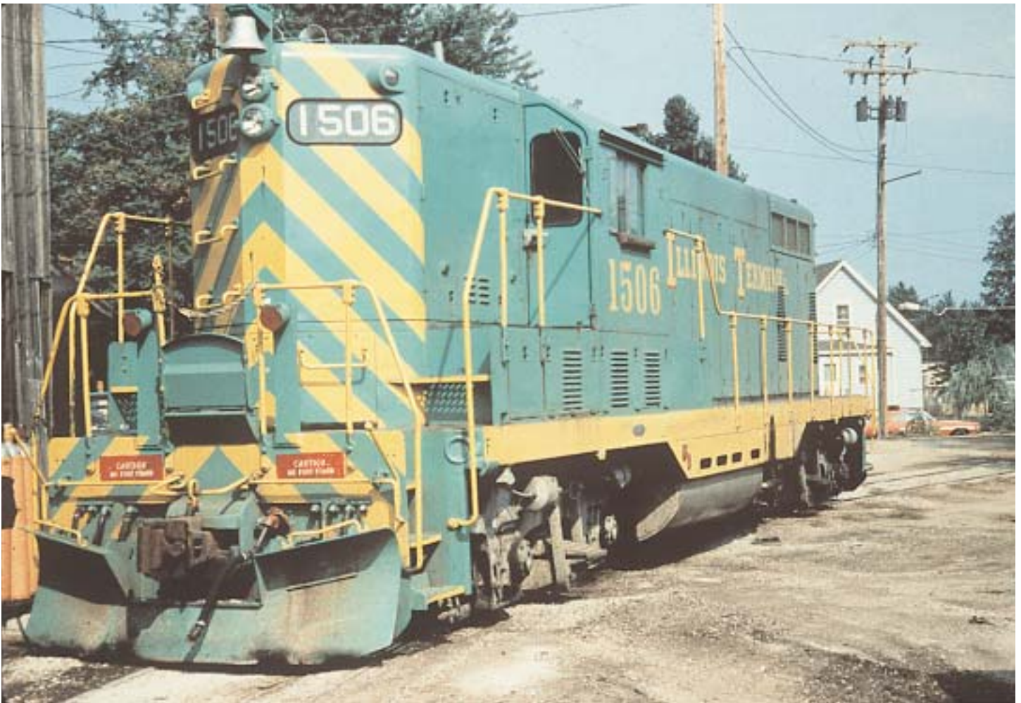
GP7 at Springfield between 1980 and 1981 wearing scheme 6