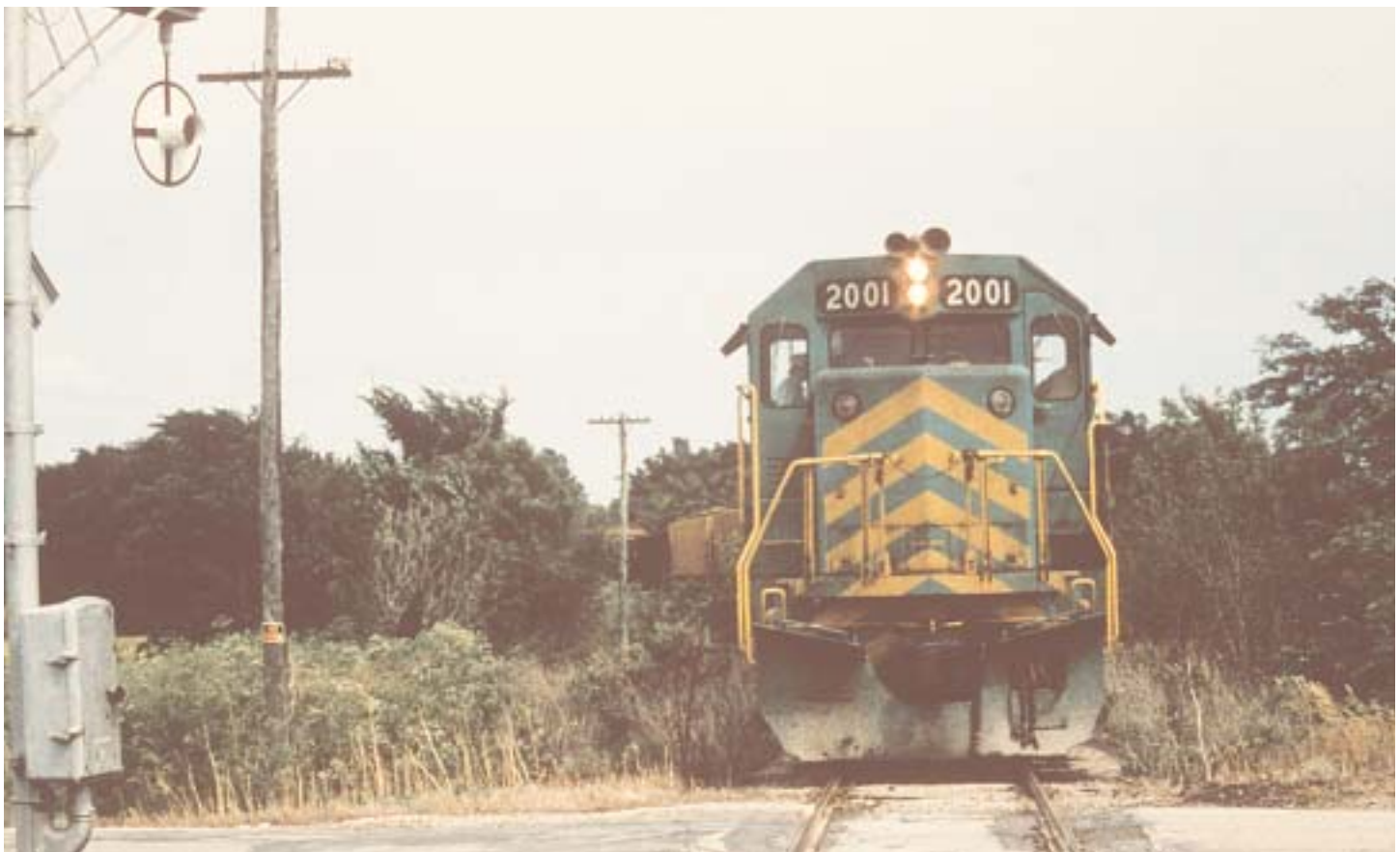
GP38-2 at White Heath on ICRR 1980