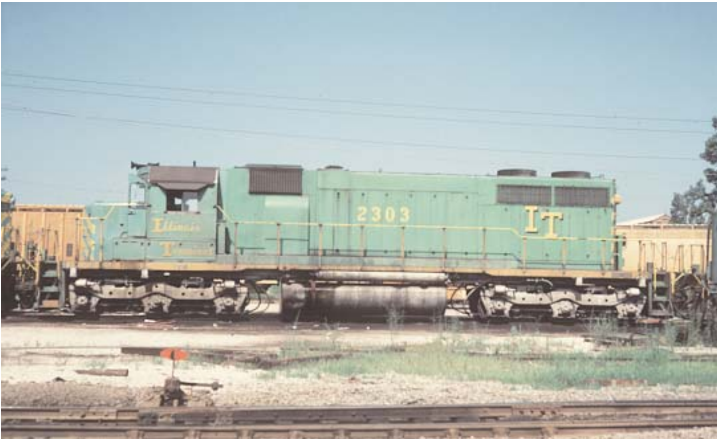
SD39 at Decatur, IL wearing scheme 1