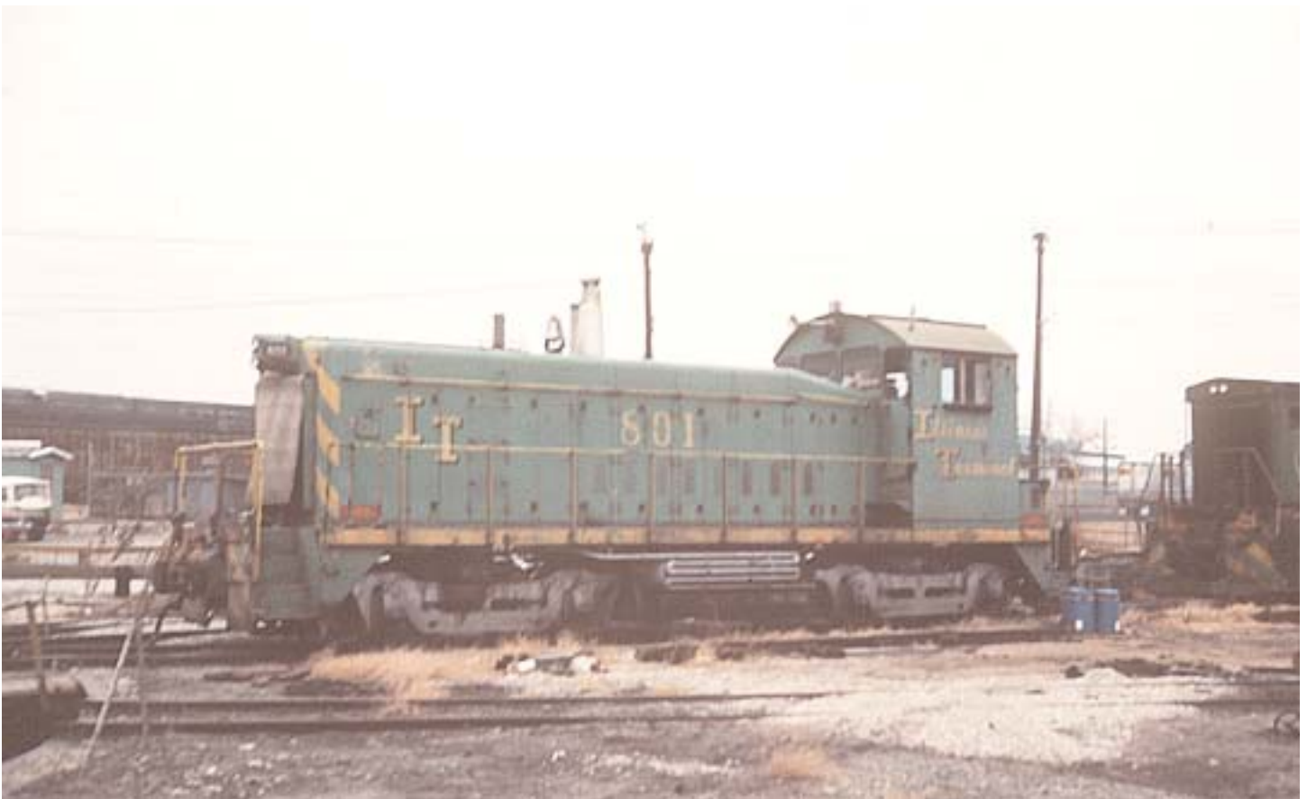
SW800 in scheme 3 at Federal in 1980