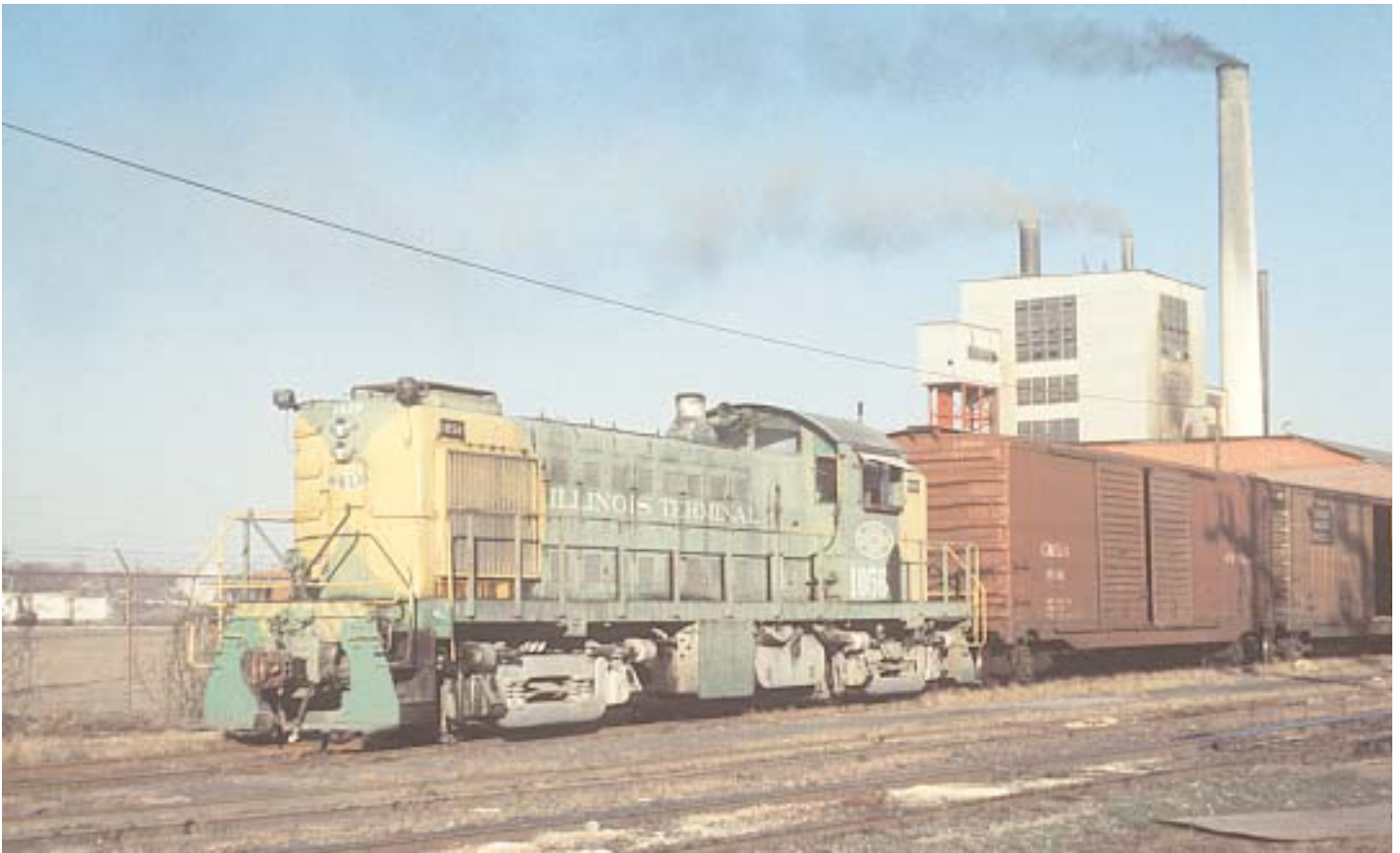
RS1 at Federal in March 1970 wearing scheme 2