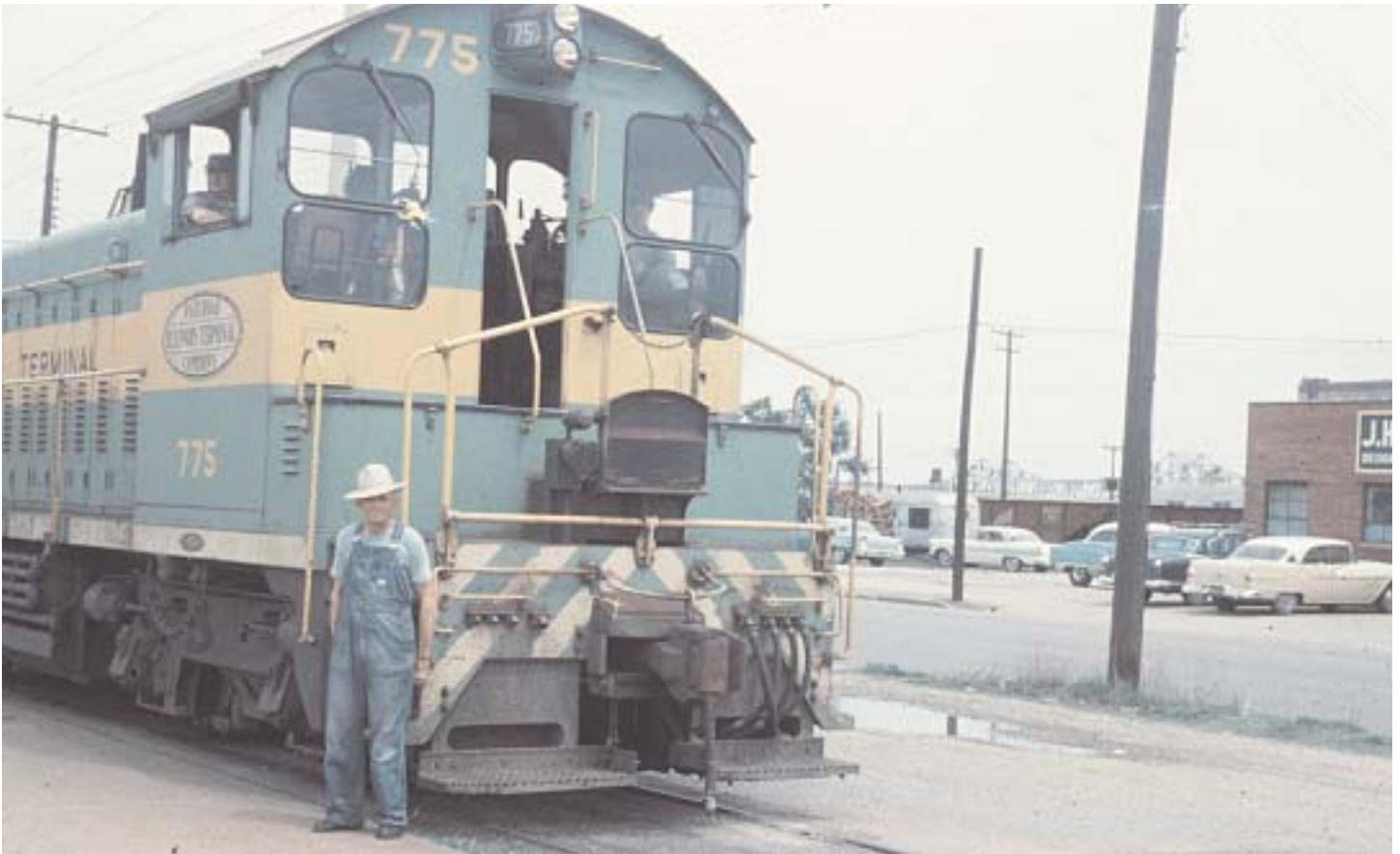
SW1200 at East Peoria in 1959, scheme 1 Previous page: SW1200 number 782 at East Peoria