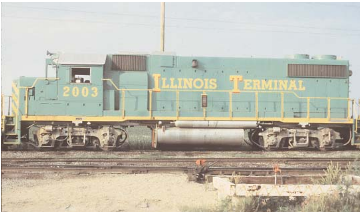
GP38-2 at Allentown Previous page: GP38-2 at Decatur