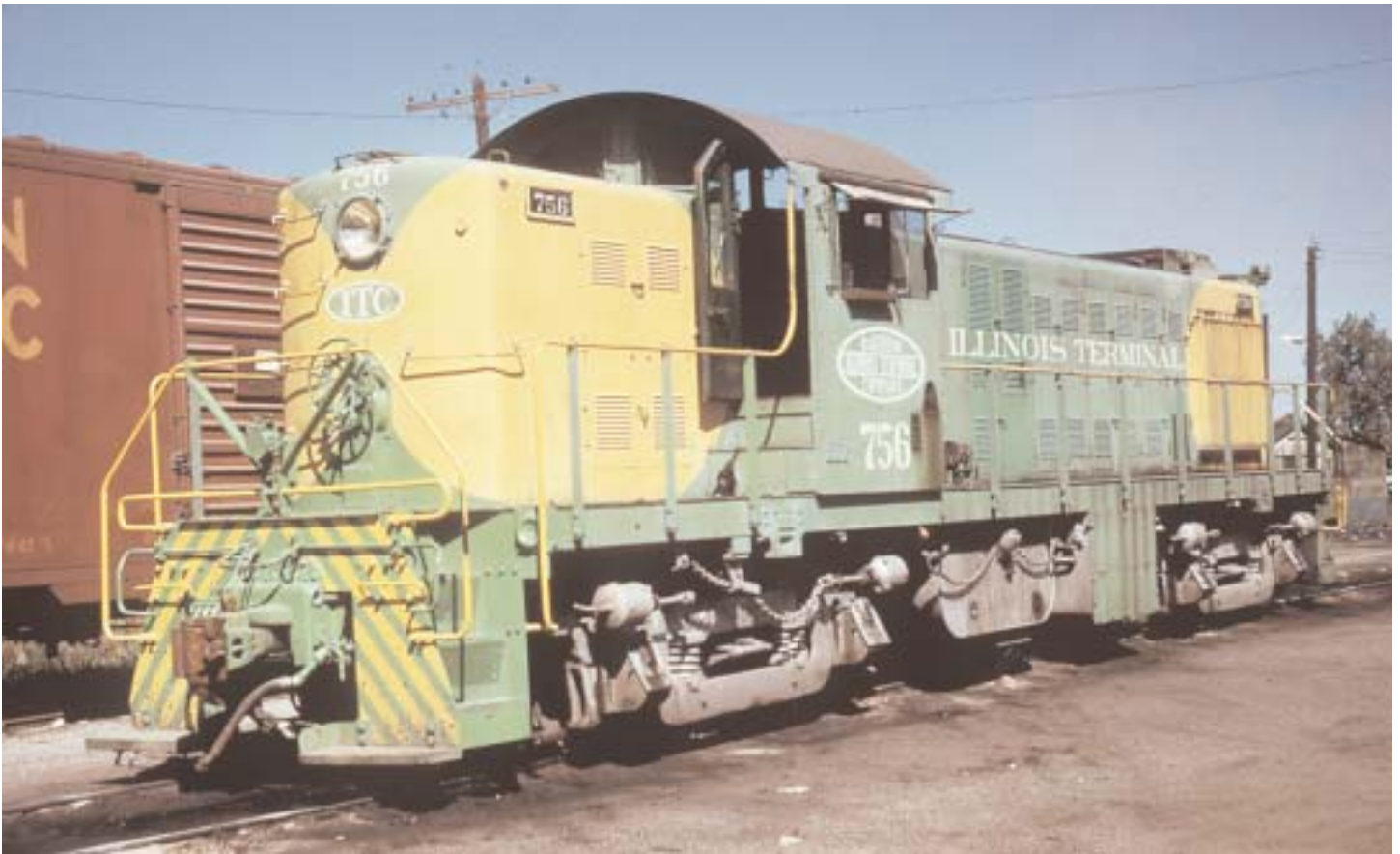
RS1 at Madison in 1965 wearing scheme 2