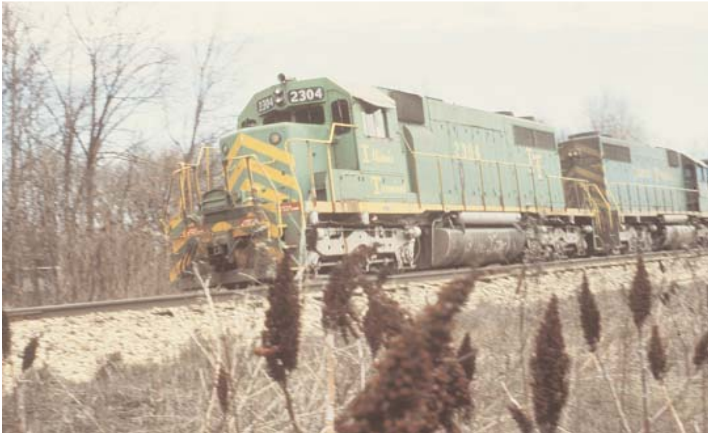
SD39 at speed