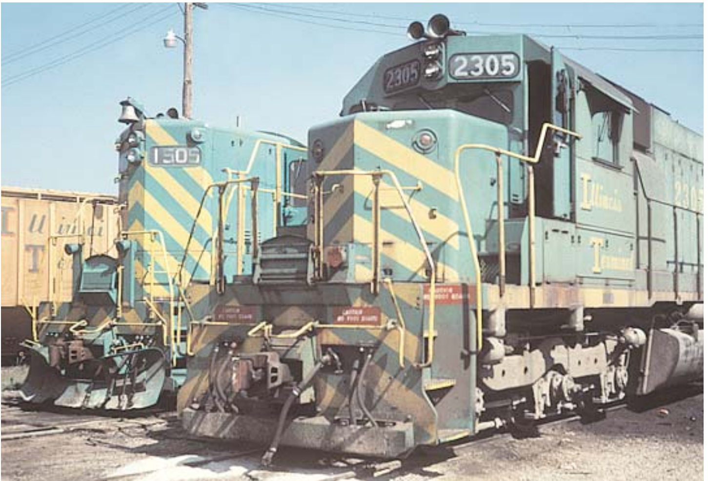
SD39 and GP7 1505 at Decatur