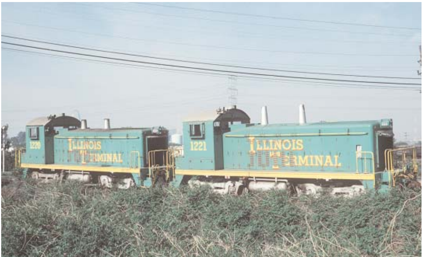
Both leased SW1200s working at National City in May 1981