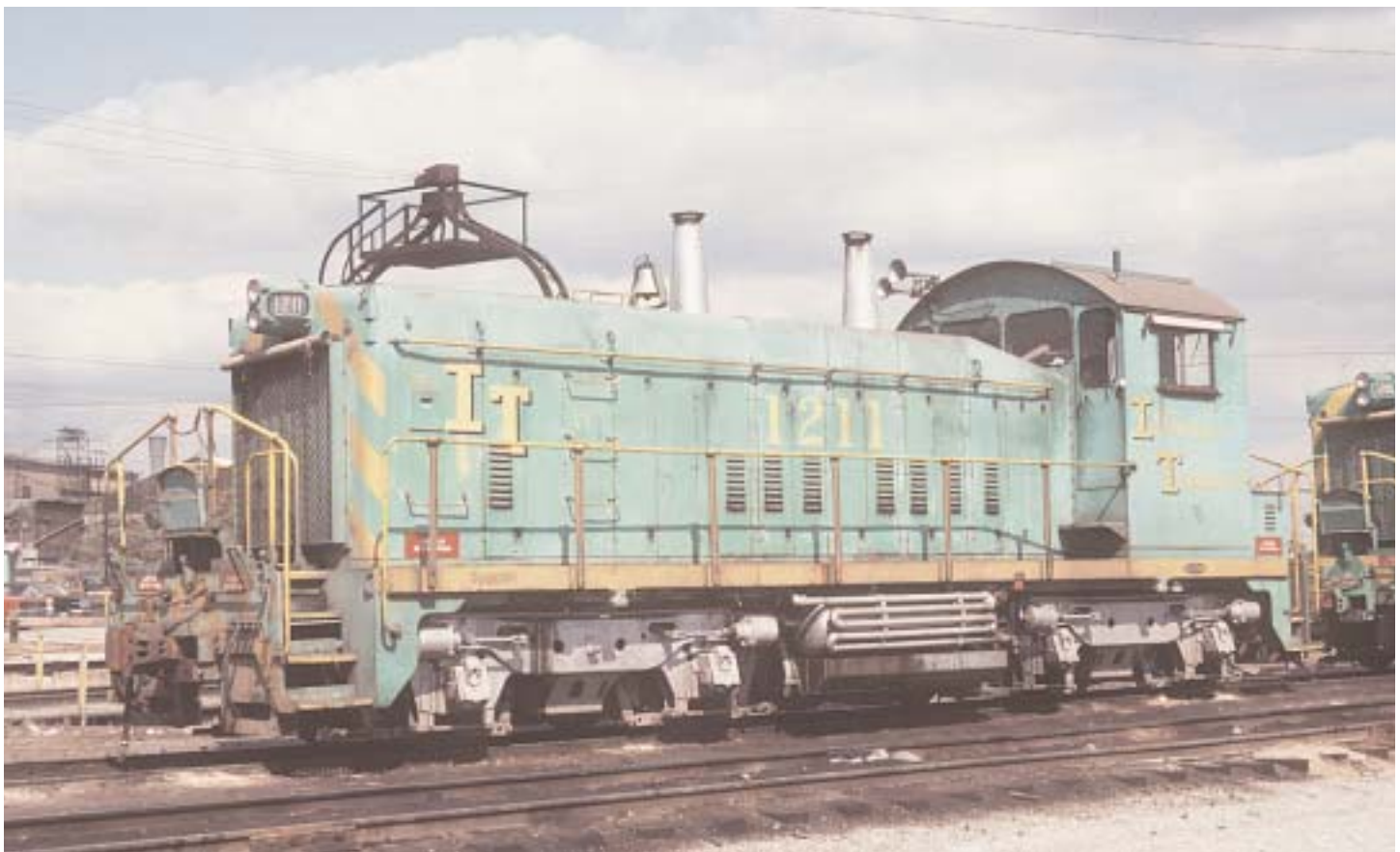
SW1200 at Federal in April 1979 wearing scheme 5