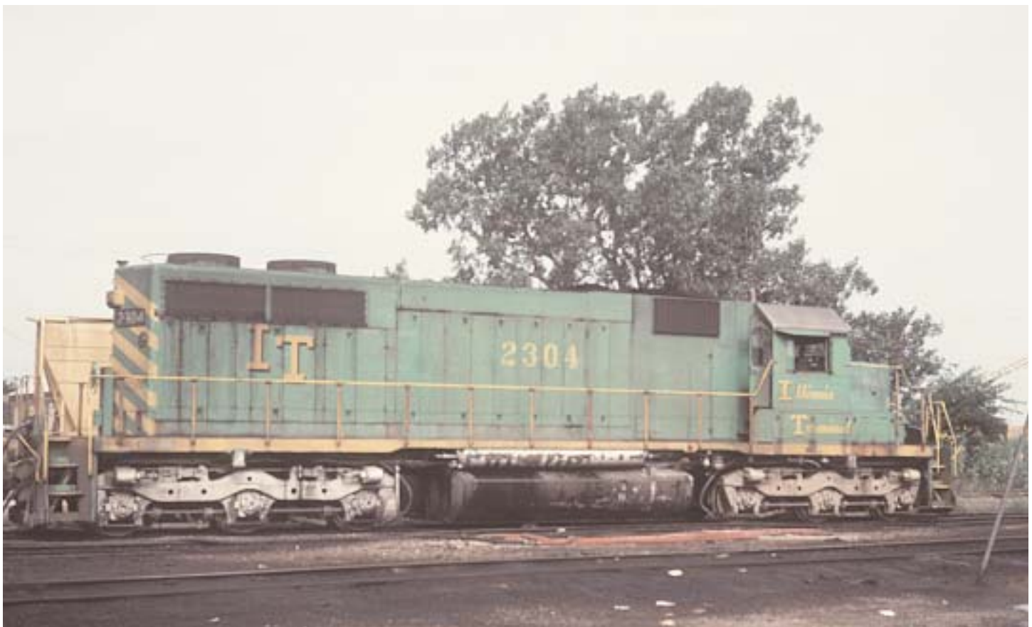
SD39 in Decatur