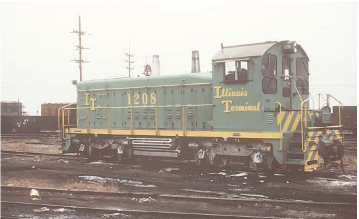
SW1200 at Federal wearing scheme 5