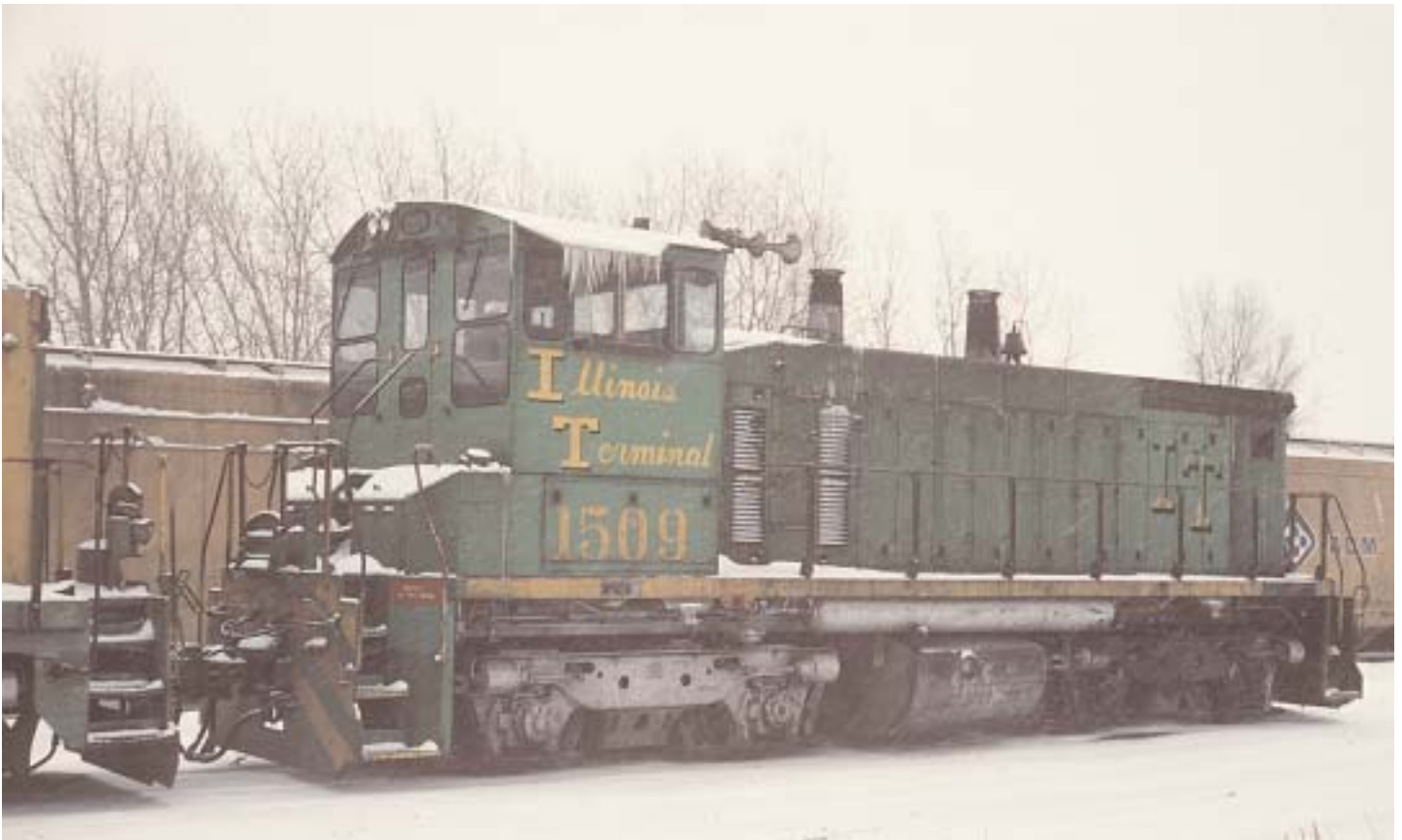
SW1500 in Decatur wearing scheme 1

Previous page: SW1500 number 1511 at East Belt also wearing scheme 1