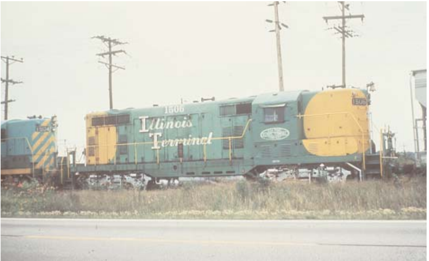
GP7 at 27th street in Decatur in 1970 wearing scheme 3