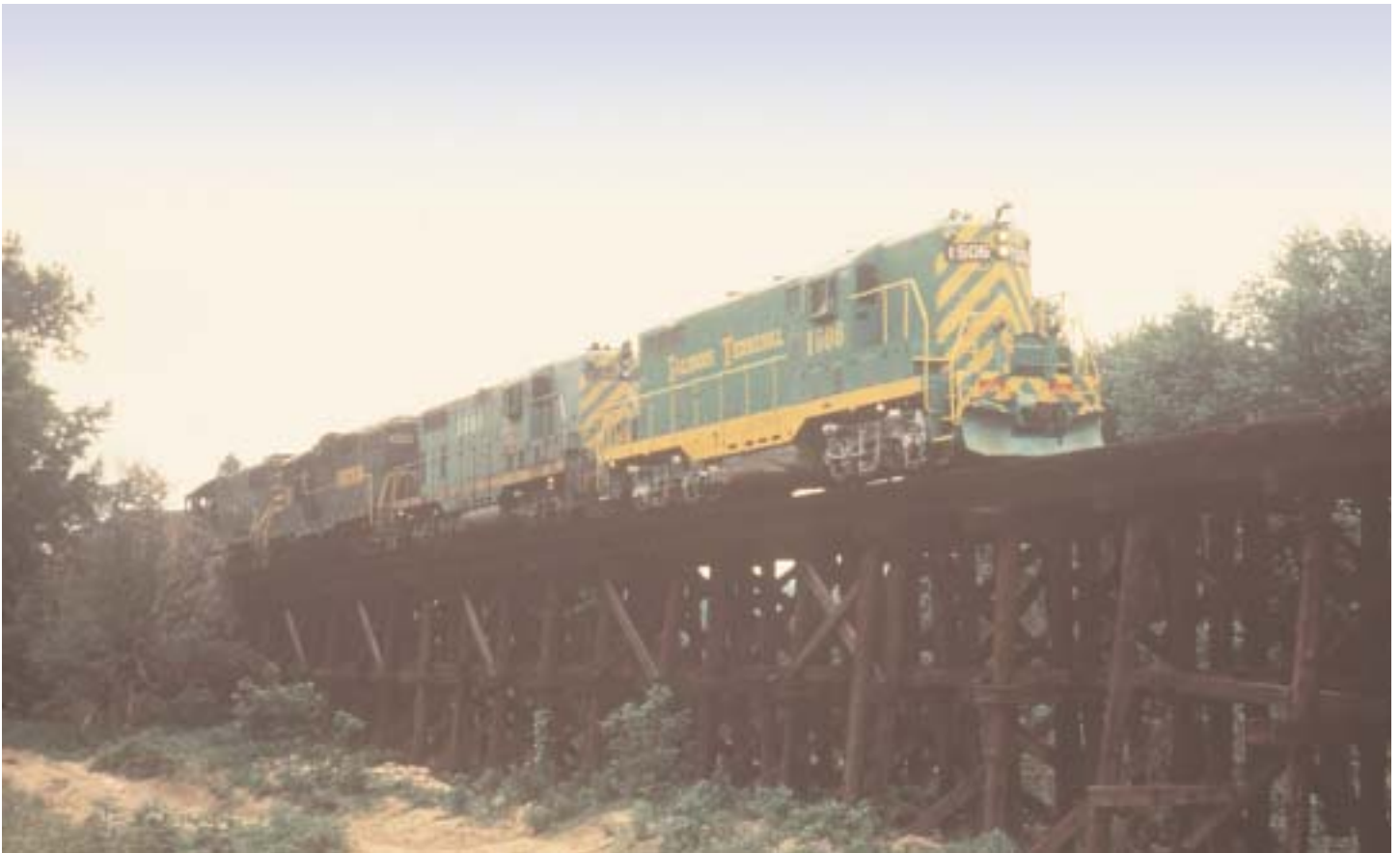
GP7 at Mackinaw River bridge wearing scheme 6