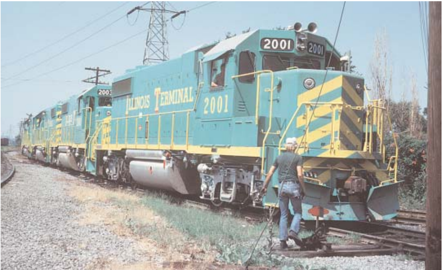
GP38-2 number 2001 at Madison in July 1977