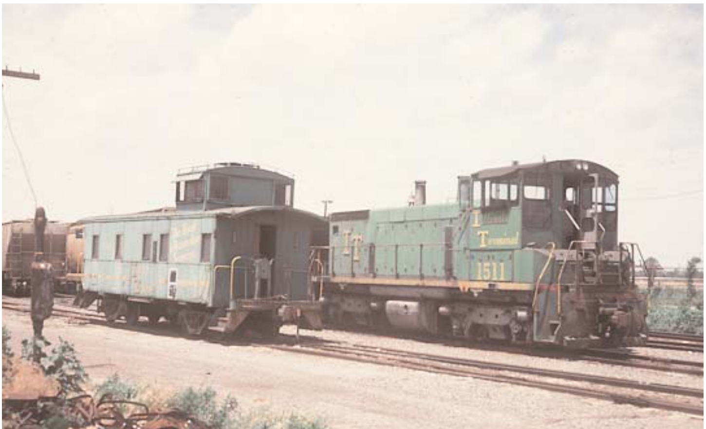
SW1500 at Granite City wearing scheme 1 with ex AT&SF caboose