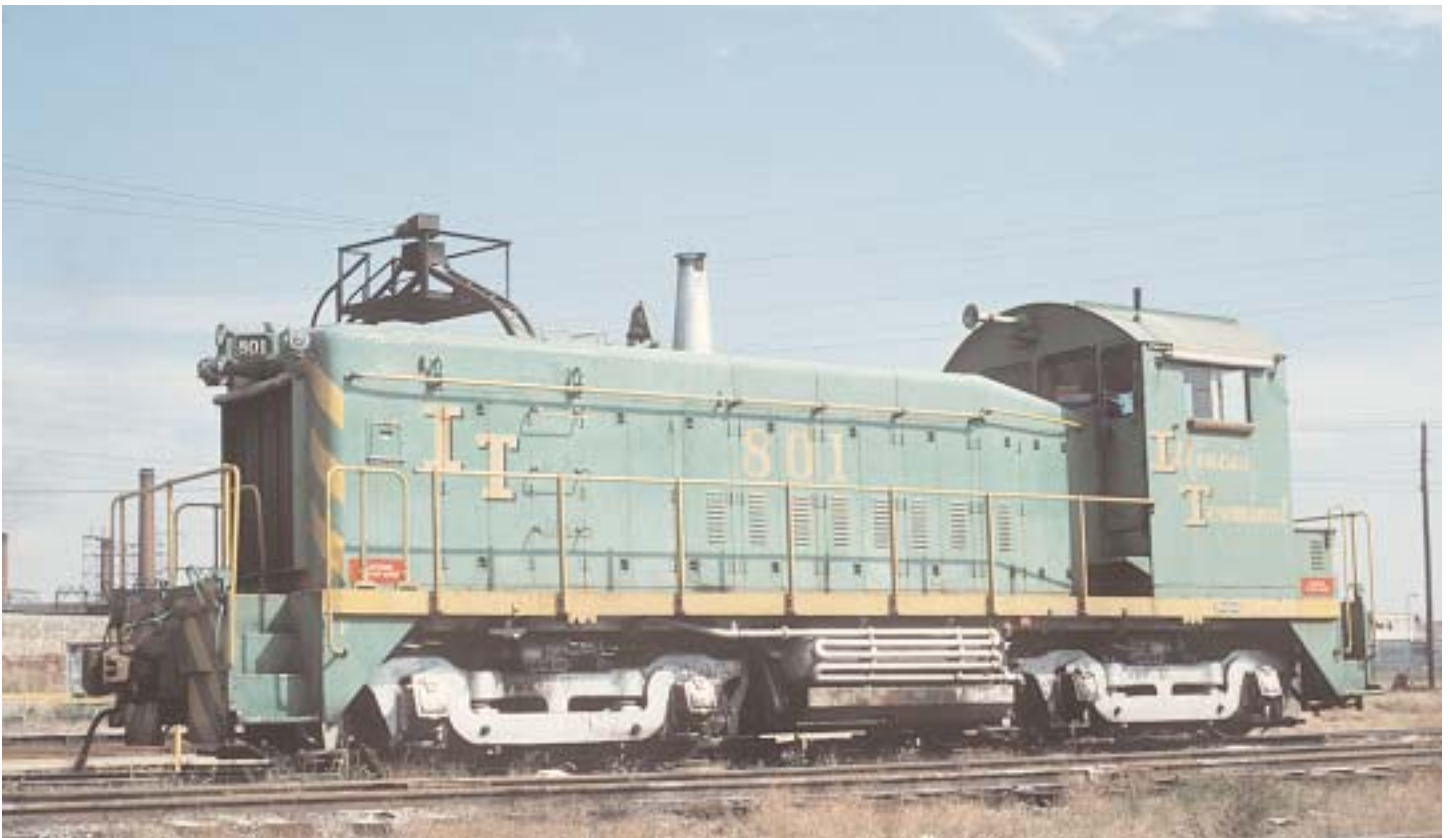
SW800 in scheme 3, at Federal, IL Previous page: SW800 in scheme 3