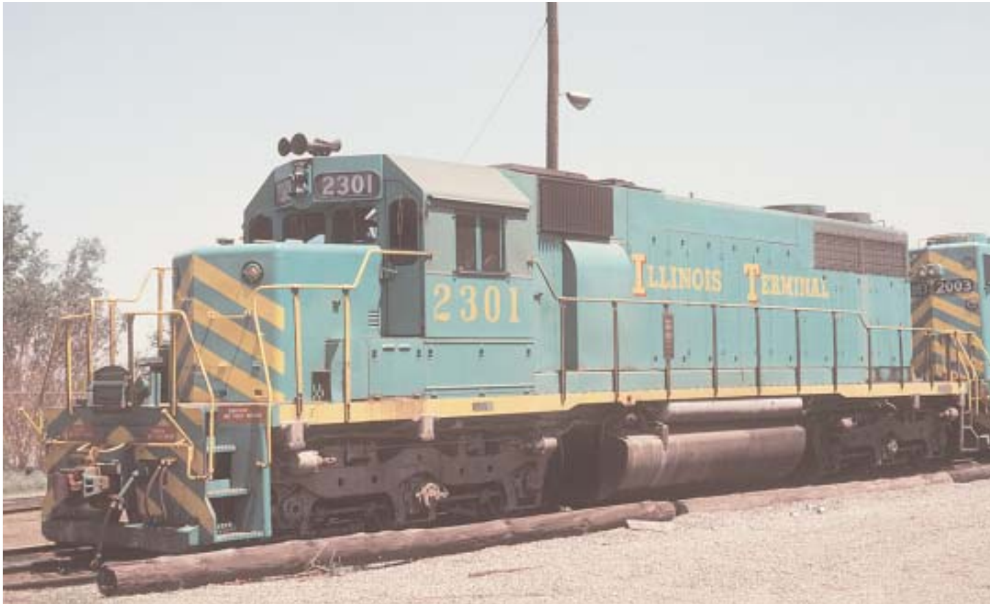
SD39 number 2301 at Madison in May 1979