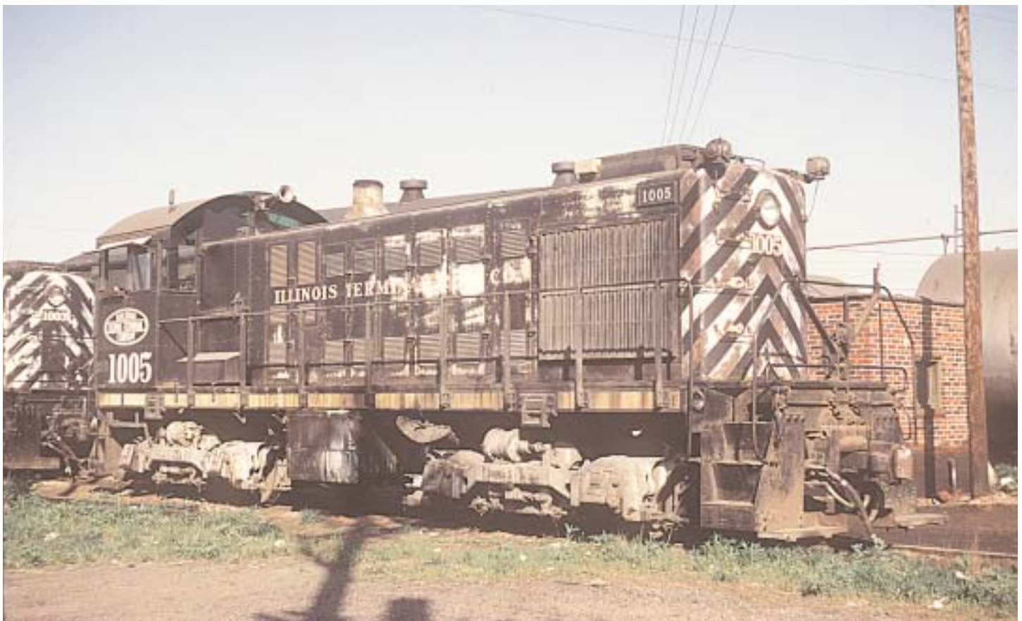
S2 at Federal in May of 1968 wearing scheme 1