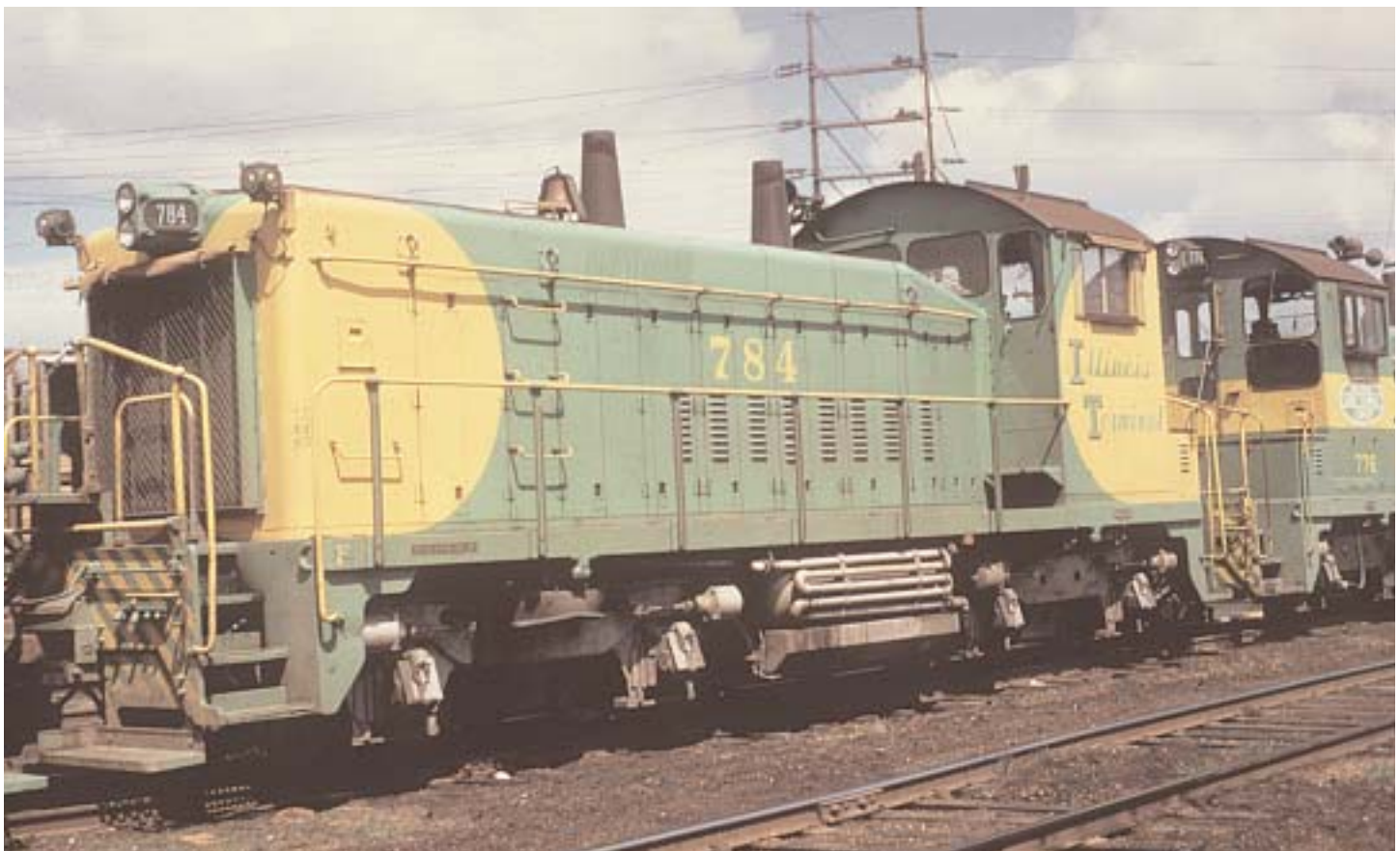
SW1200 at Decatur in 1967, scheme 4