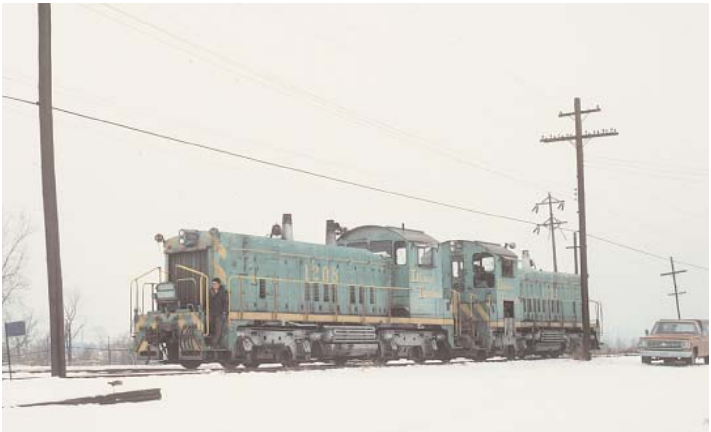
SW1200 at Madison in December 1975, both wearing scheme 5