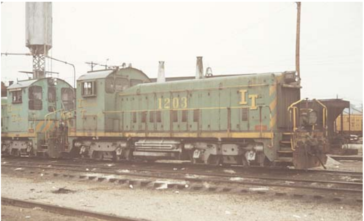
SW1200 at Federal wearing scheme 5