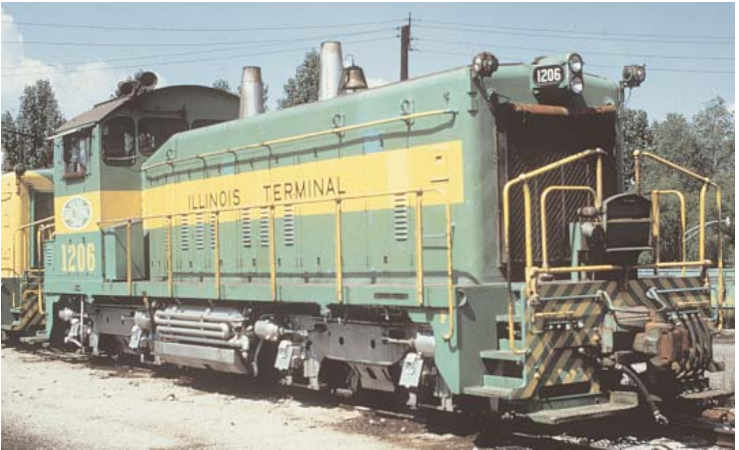
SW1200 at Madison in 1969, scheme 2