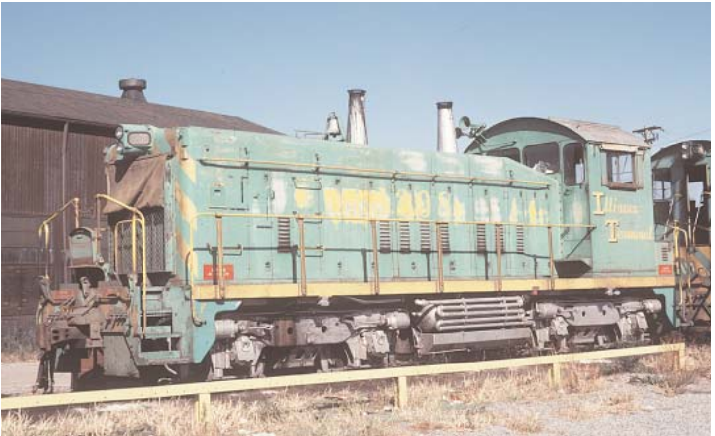
SW1200 at Madison in November 1979 wearing scheme 5