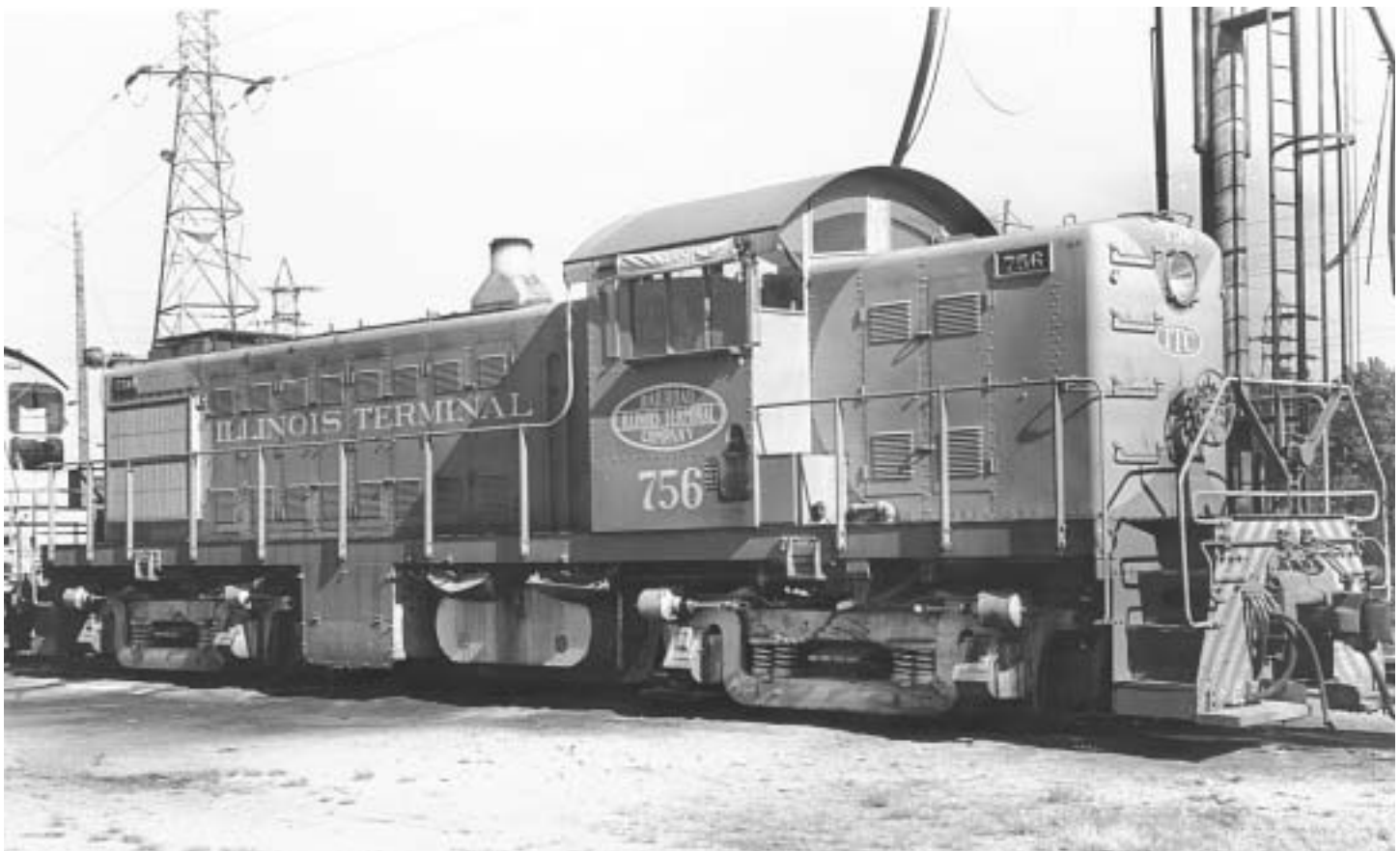
RS1 at wearing scheme 2