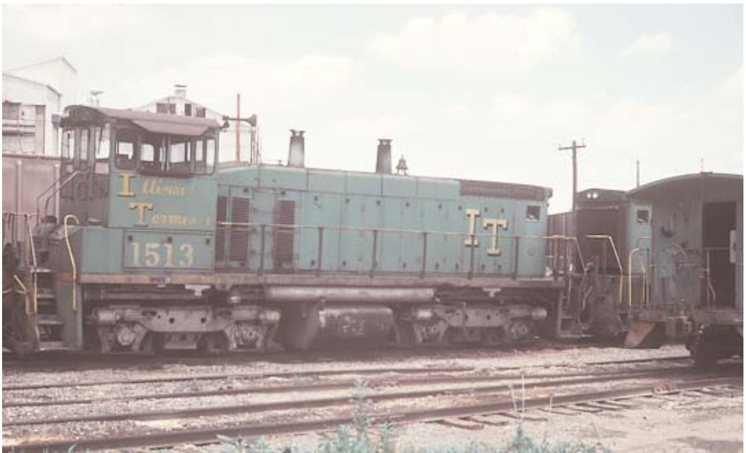
SW1500 at Granite City shown in scheme 1