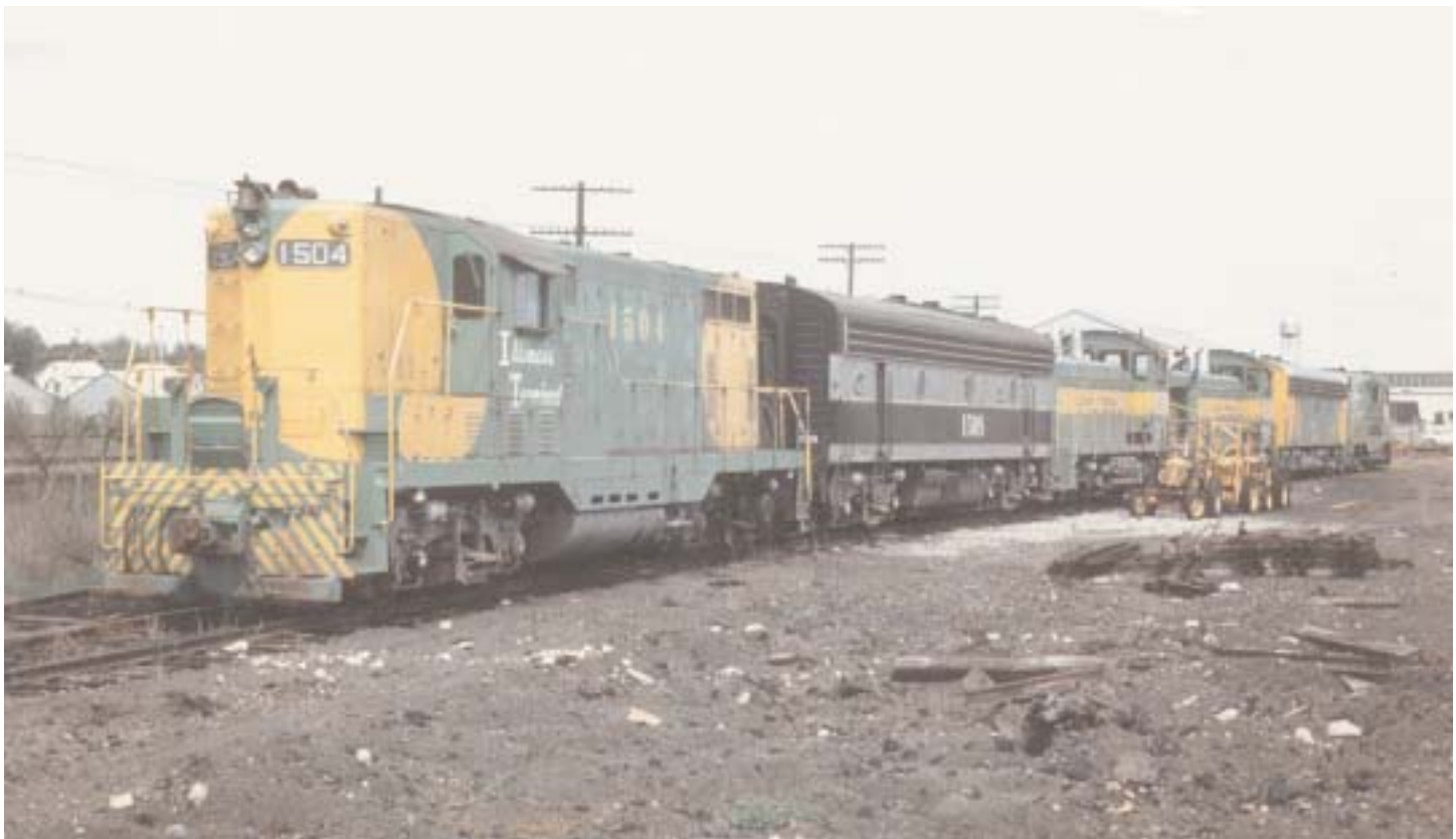
F7B numbers 1508 and 1507 at TP&W yard in East Peoria in the spring 1968