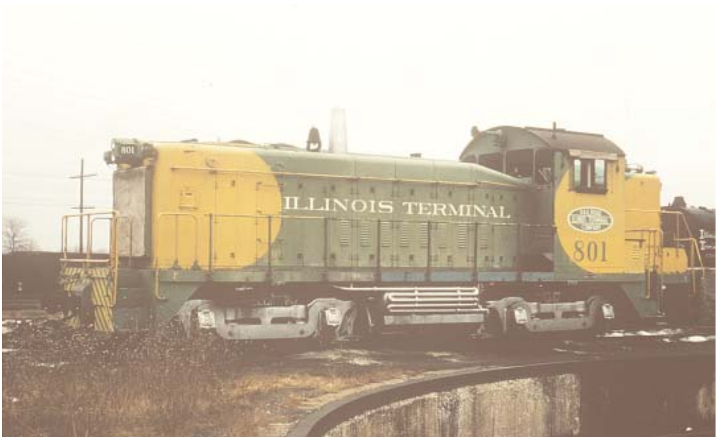
SW800 in scheme 2 at Federal