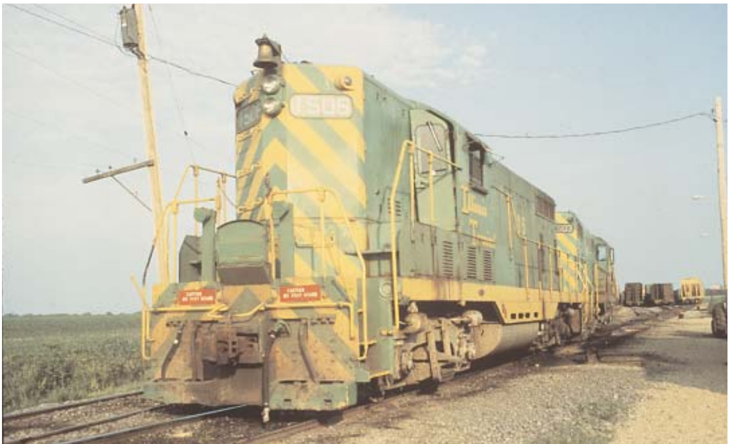
GP7 at Allentown between 1970 and 1980 wearing scheme 5