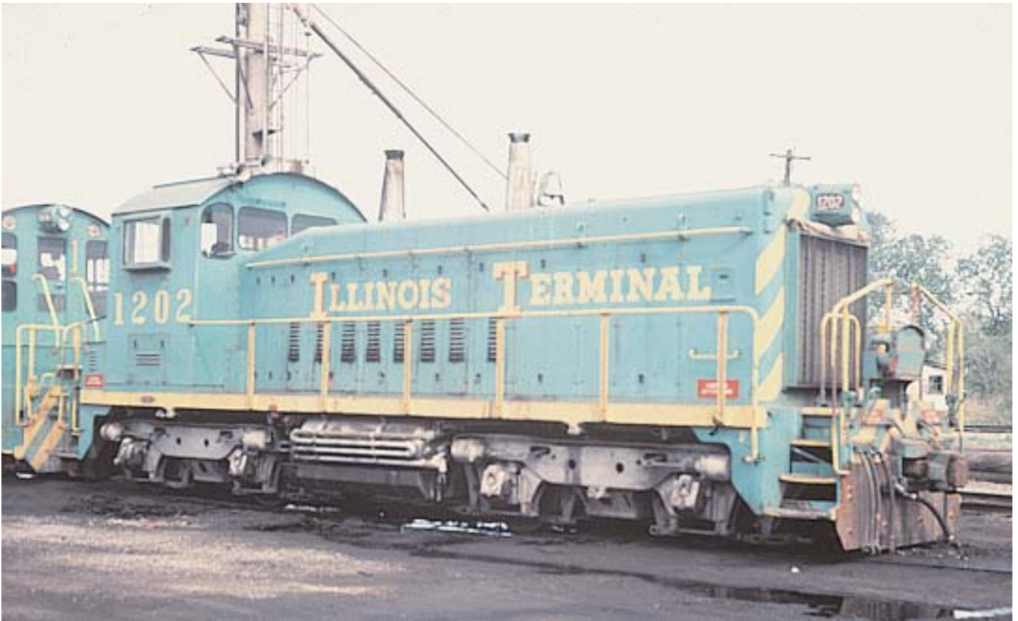
SW1200 at Lang, Madison, IL in 1980 wearing scheme 6