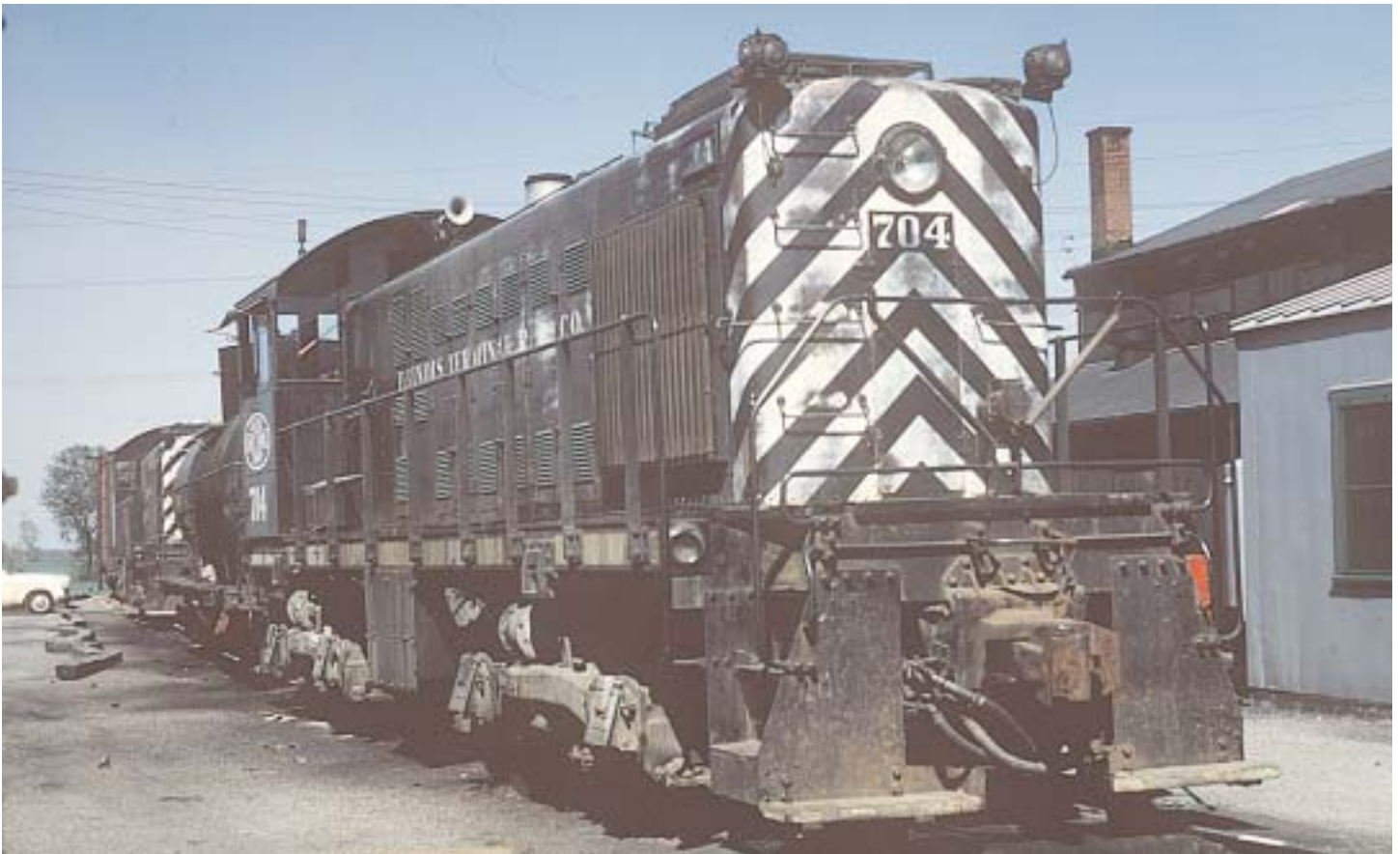
S2 at Lang, Madison, IL in 1965, scheme 1