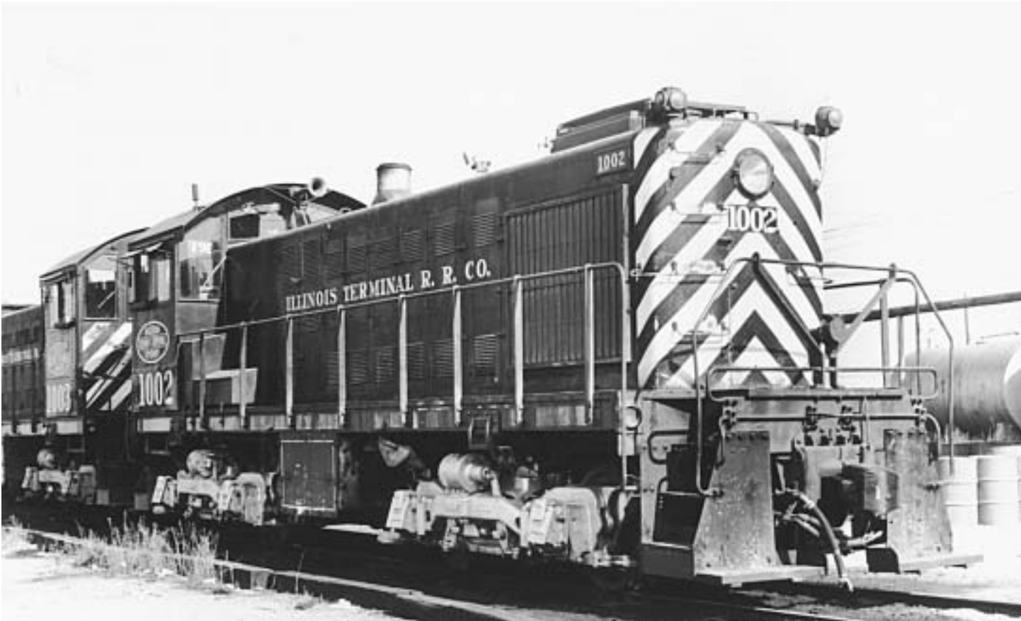
S2 at Madison in August 1967 wearing scheme 1