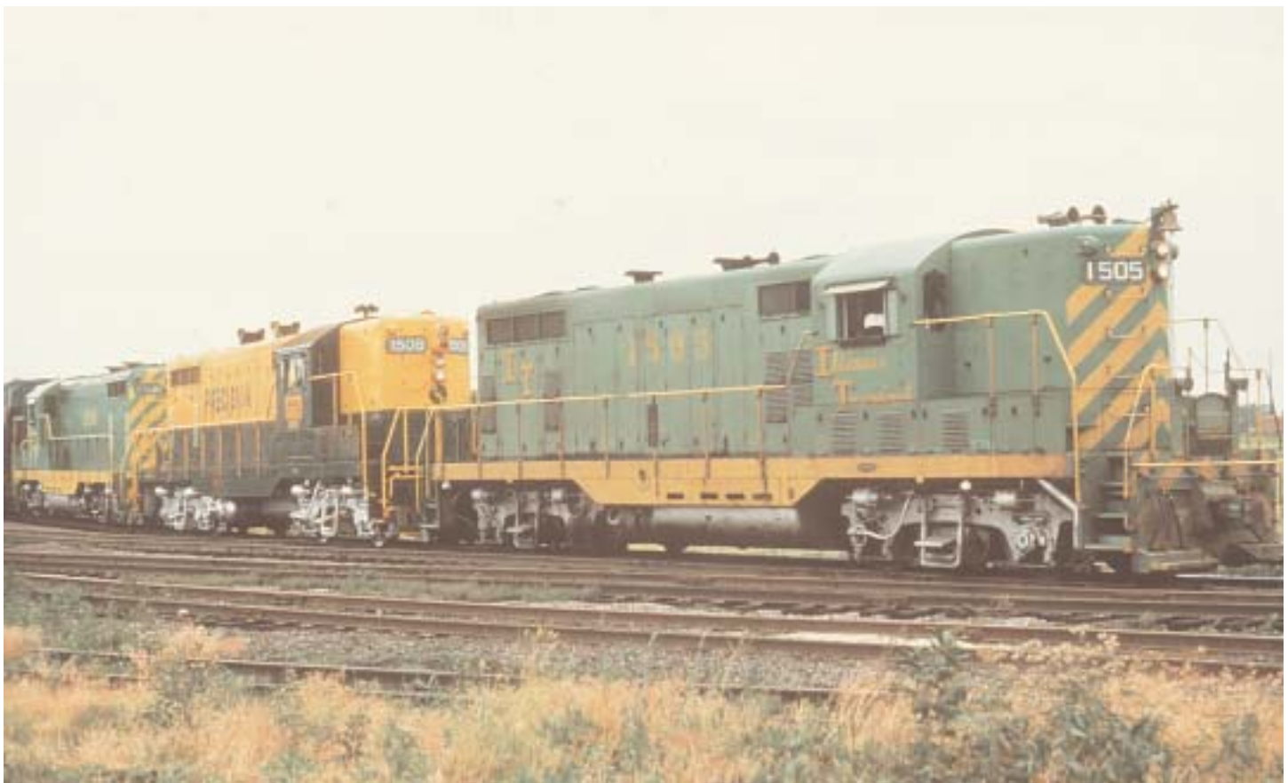
GP7 in Decatur in 1976 wearing scheme 5