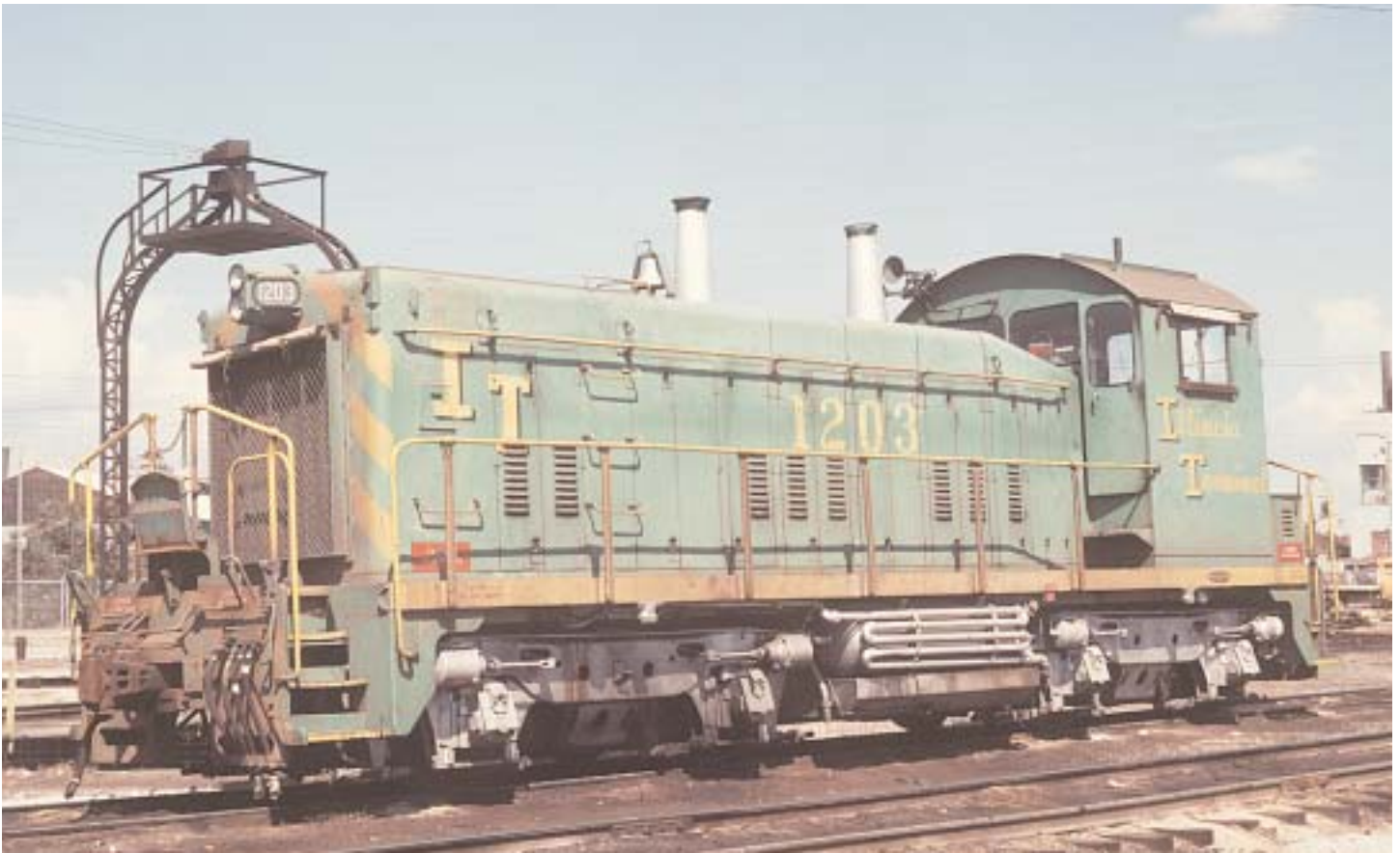
SW1200 at Federal in May 1979 wearing scheme 5