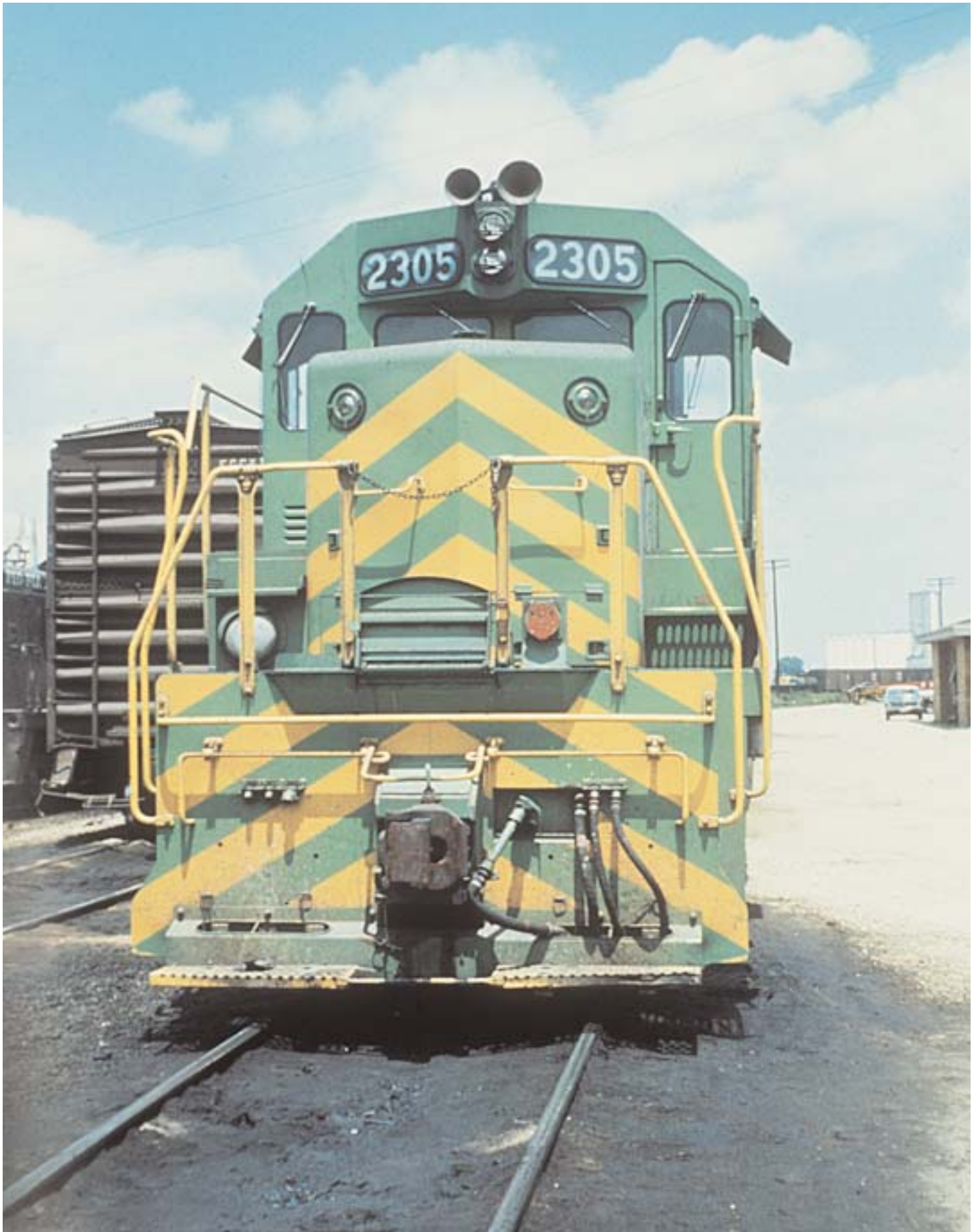
SD39 on P&PU track, E. Peoria in 1972